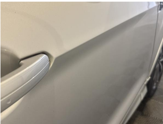
13: Door osf Dented 2 Or Less UpTo 10mm