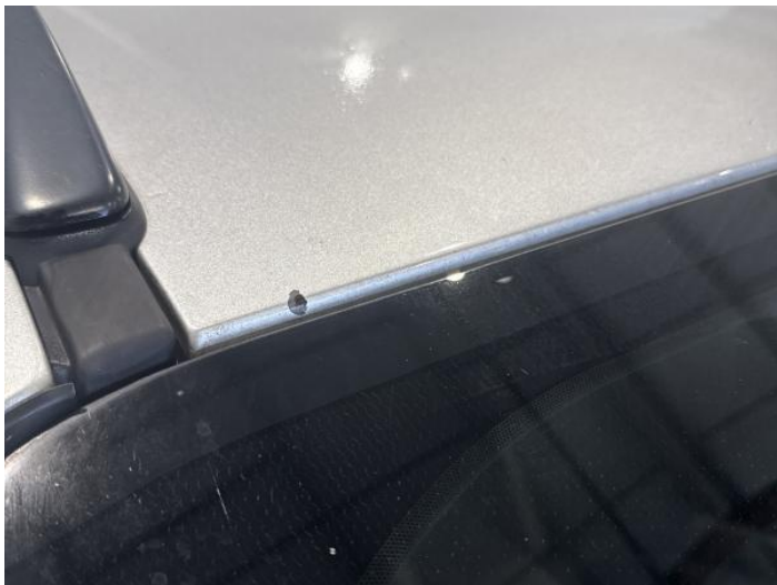
15: Roof Chipped Over 5mm