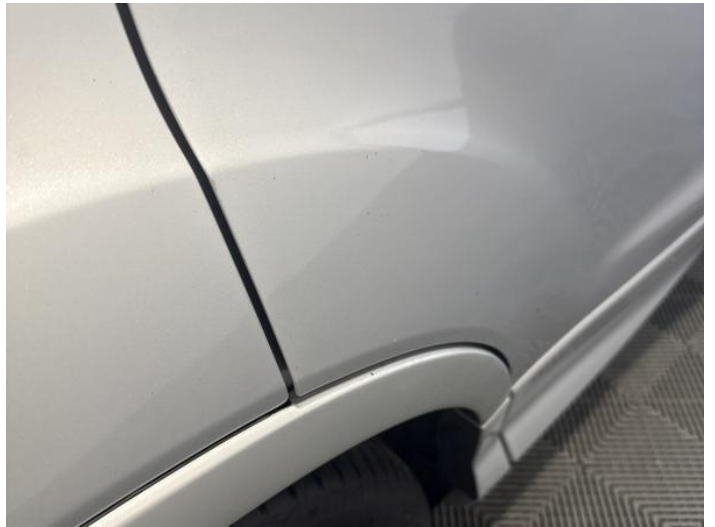
12: Door osr Chipped 1 To 5