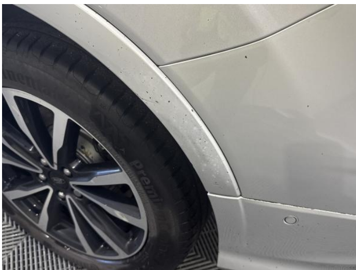
6: Qtr Panel Arch Extension ns Scratched (Painted) Over 25mm Thru Paint