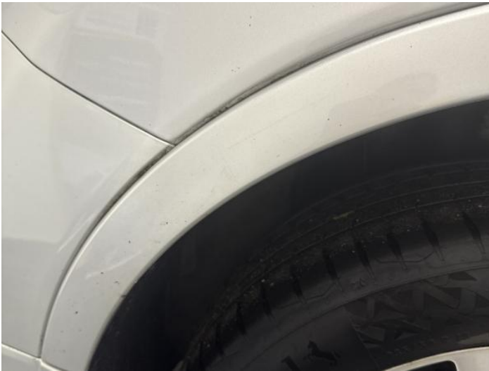
11: Qtr Panel Arch Extension os Scratched (Painted) Over 25mm Thru Paint