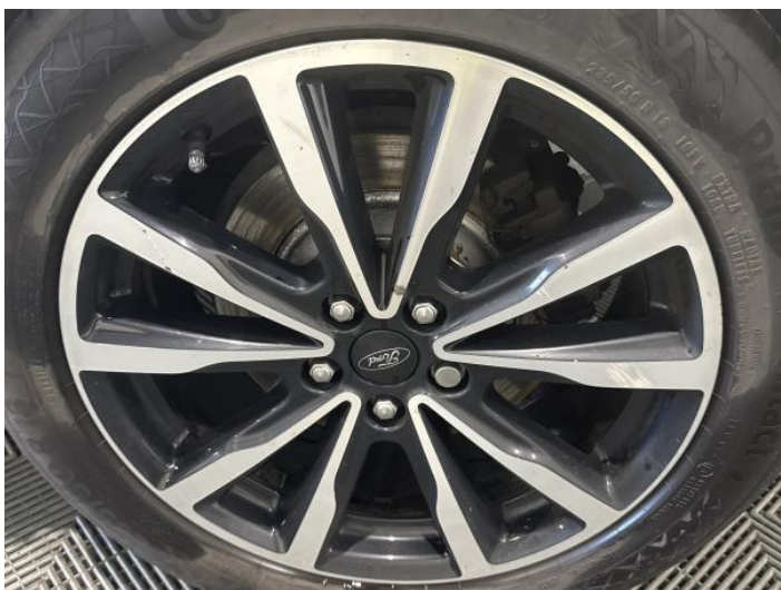
5: Wheel nsr Scratched Over 50mm