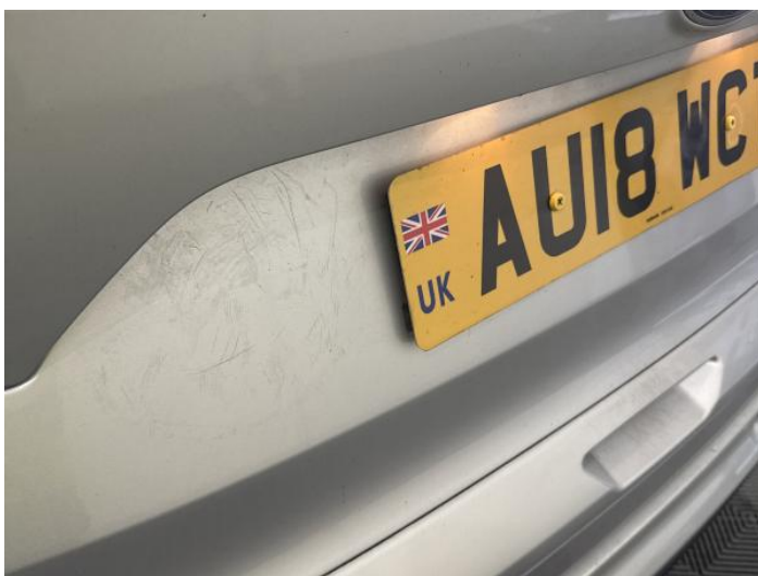
8: Tailgate Scratched Over 25mm Thru Paint