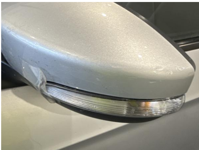
3: Flasher Side Repeater ns Broken Replace