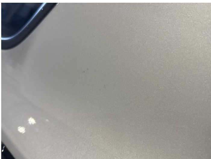
7: Qtr Panel nsr Chipped 1 To 5