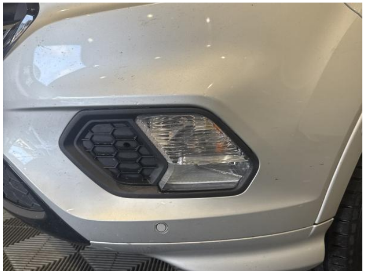
2: Bumper Front Scratched Over 100mm Thru Paint