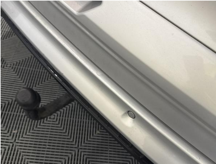
9: Bumper Rear Scratched 25 to 100mm Thru Paint