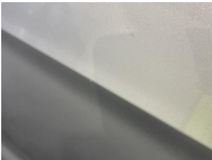
4: Door nsf Chipped 1 To 5