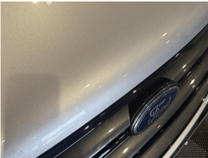
1: Bonnet Chipped Multiple Chips