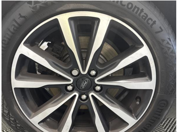
10: Wheel osr Scratched Up To 50mm