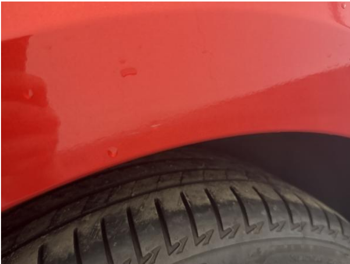
5: Qtr Panel osr Scratched UpTo 25mm Thru Paint