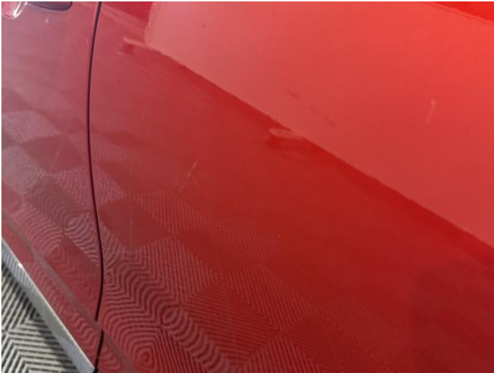
3: Door nsr Scratched Over 25mm Thru Paint