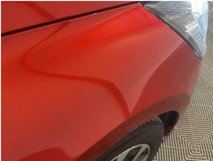
6: Wing osf Scratched UpTo 25mm Thru Paint

Carpet Condition Average Seat Condition Average