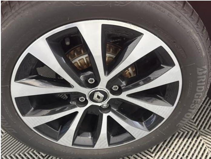
4: Wheel osr Scratched Up To 50mm