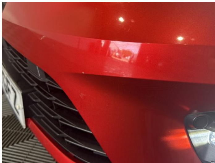
2: Bumper Front Scratched 25 to 100mm Thru Paint