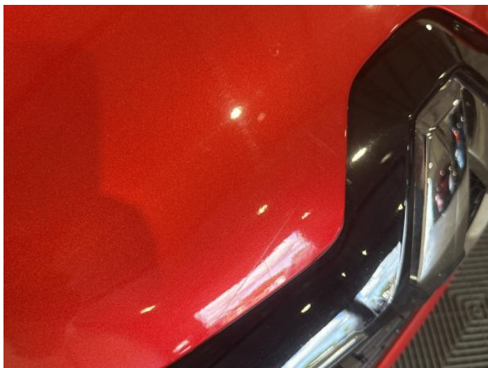
1: Bonnet Scratched Over 25mm Thru Paint