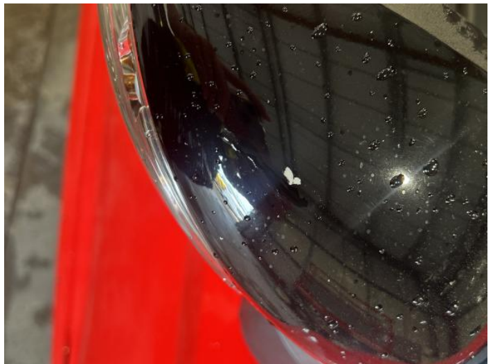
2: Door Mirror Assy osf Scratched (Painted) UpTo 25mm Thru Paint