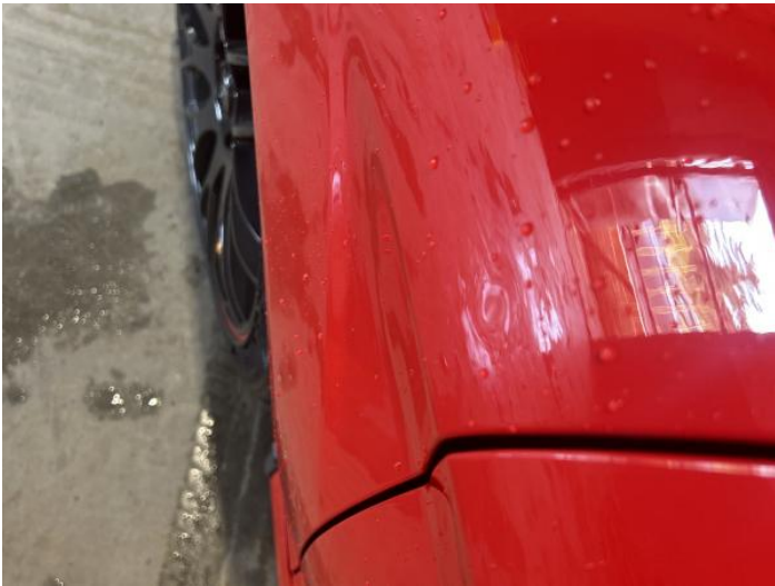
5: Wing nsf Dented Between 10mm + 30mm