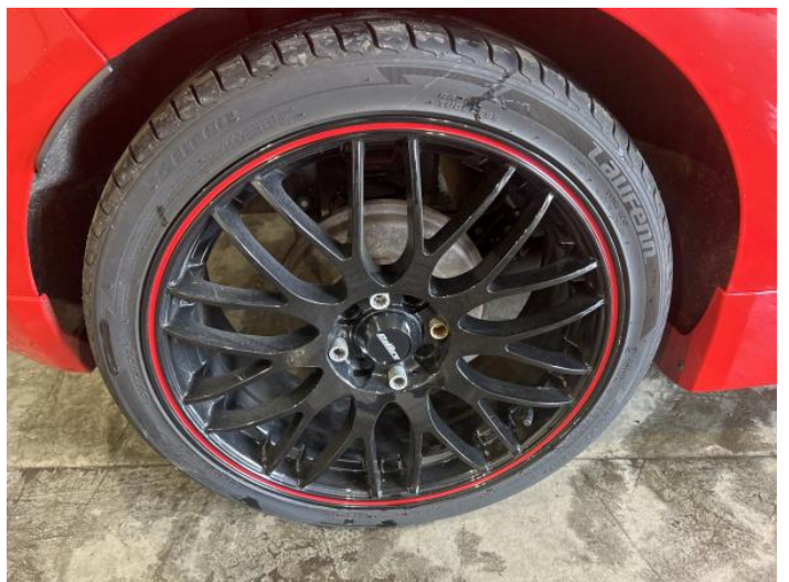
8: Wheel osr Scratched Up To 50mm