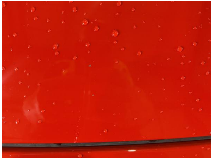
6: Bonnet Chipped 1 To 5