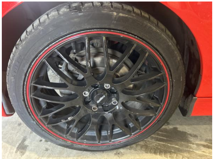
9: Wheel nsr Scratched Over 50mm