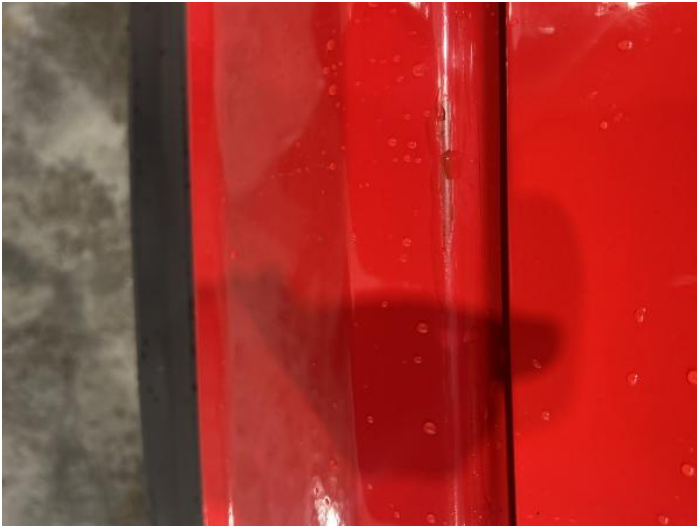
3: Bumper Rear Scratched 25 to 100mm Thru Paint