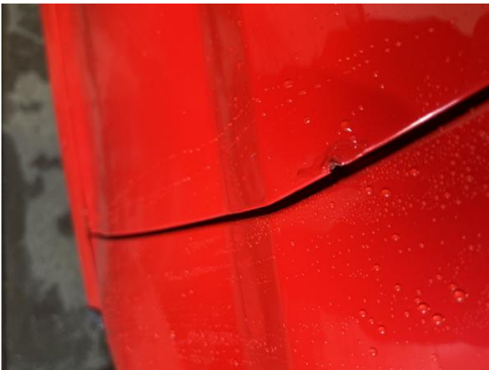
1: Door osf Dented With Paint Damage