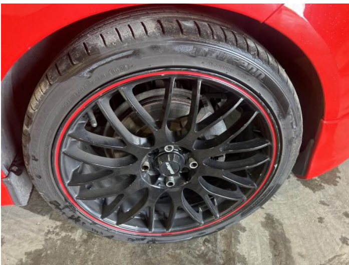
7: Wheel osf Scratched Up To 50mm