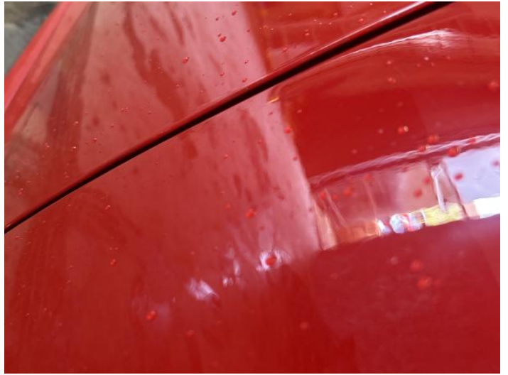
4: Qtr Panel nsr Dented 2 Or Less Up To 10mm