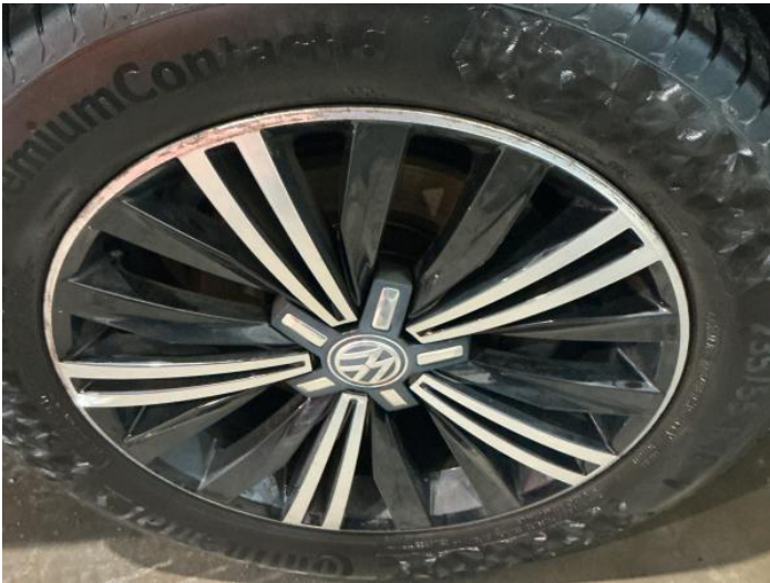
11: Wheel osf Scratched Over 50mm