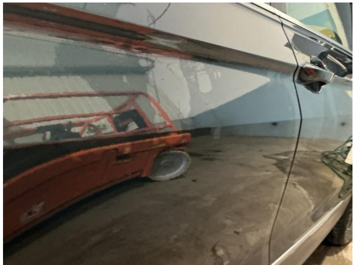
6: Door osr Dented Over 2 UpTo 10mm