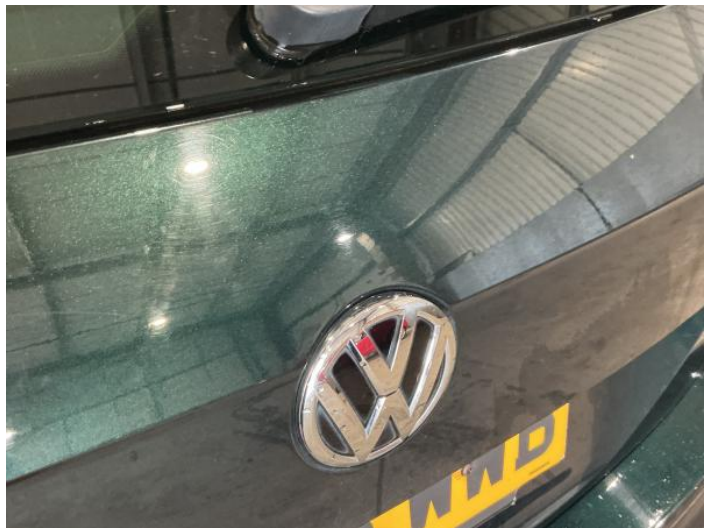
2: Boot Lid Chipped 1 To 5