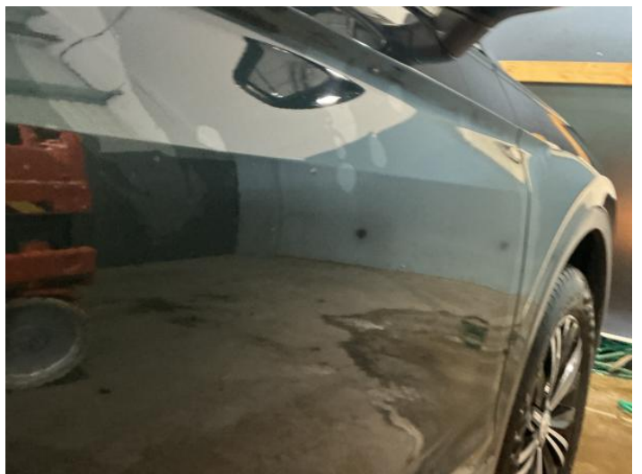
8: Door osf Dented Over 2 UpTo 10mm