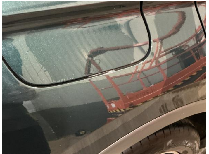
4: Qtr Panel osr Chipped 1 To 5