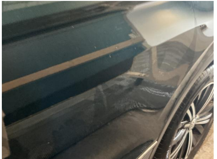
18: Door nsr Chipped 1 To 5