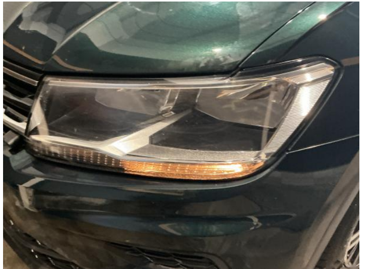
12: Bumper Front Scratched 25 to 100mm Thru Paint