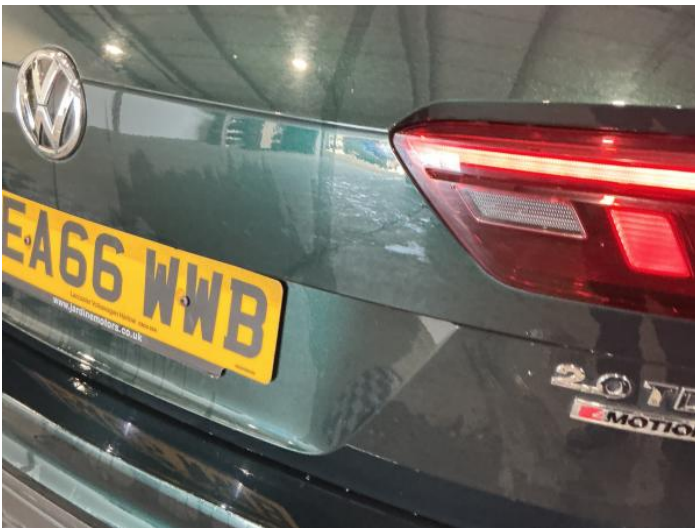
1: Bumper Rear Scratched Over 100mm Thru Paint