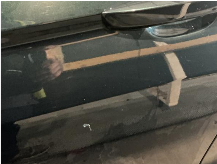
17: Door nsf Dented With Paint Damage