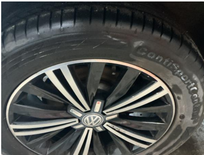
5: Wheel osr Scratched Over 50mm