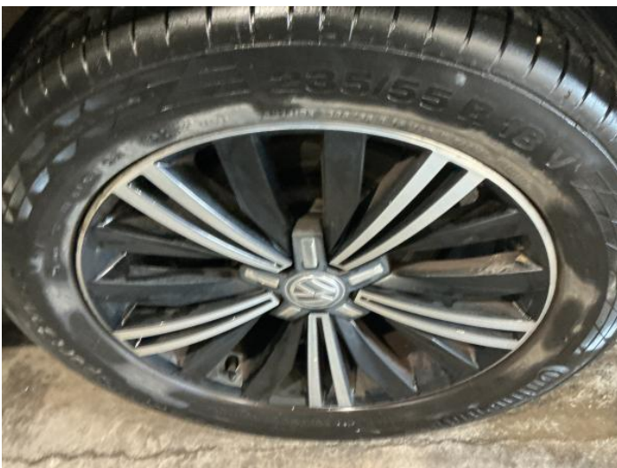
19: Wheel nsr Scratched Over 50mm