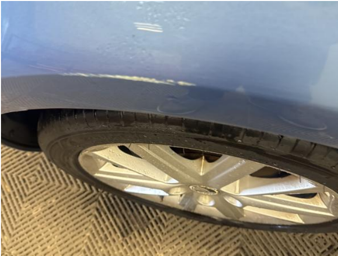
3: Wing nsf Dented With Paint Damage