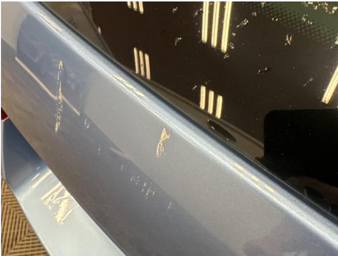
11: Boot Lid Scratched Over 25mm Thru Paint