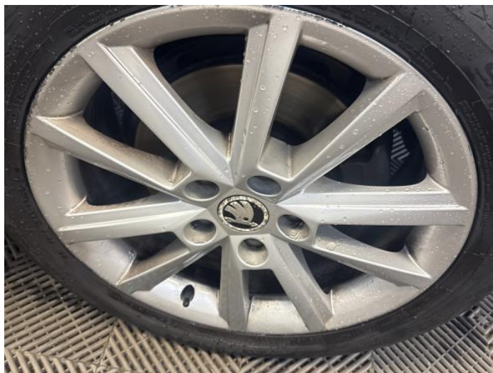
16: Wheel osf Scratched Up To 50mm