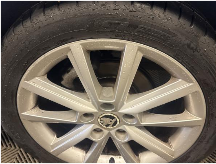
9: Wheel nsr Scratched Up To 50mm