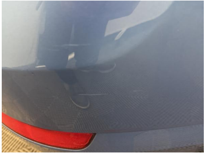
10: Bumper Rear Scratched Over 100mm Thru Paint