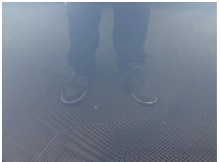
14: Door osr Chipped 1 To 5