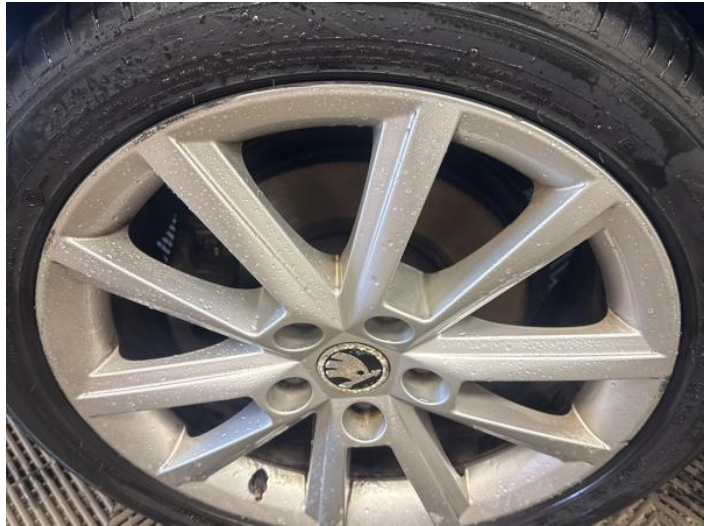
4: Wheel nsf Scratched Over 50mm