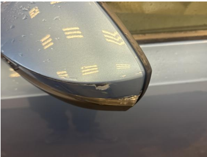
5: Door Mirror Assy nsf Scratched (Painted) Over 25mm Thru Paint