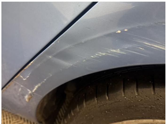
8: Qtr Panel nsr Dented With Paint Damage