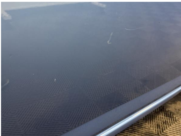
15: Door osf Chipped Multiple Chips