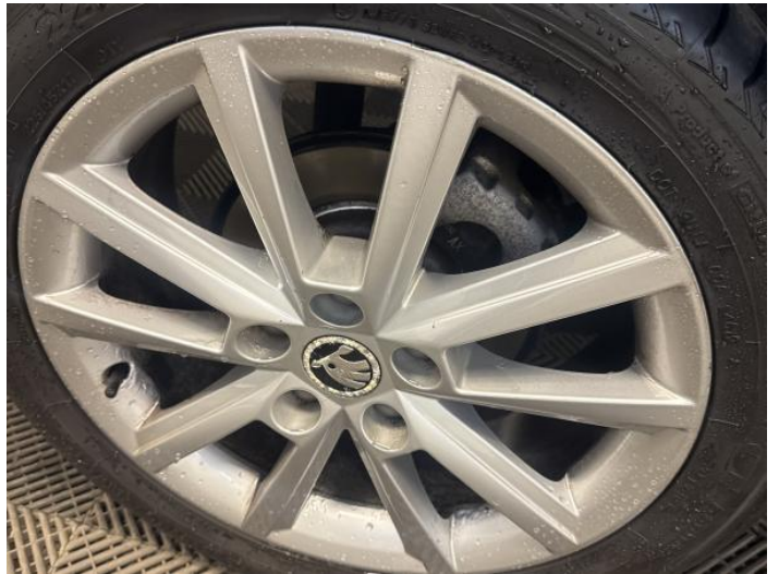
12: Wheel osr Scratched Up To 50mm