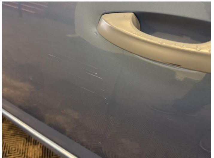
6: Door nsf Dented With Paint Damage