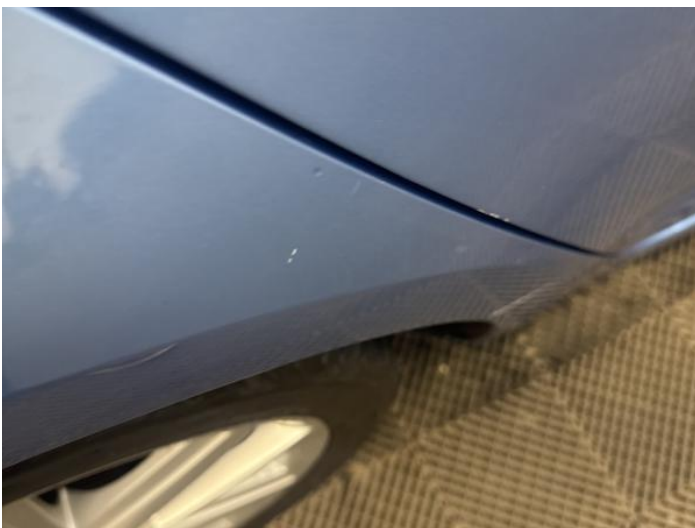
13: Qtr Panel osr Chipped 1 To 5