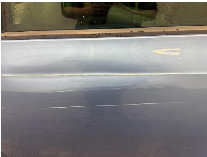
7: Door nsr Dented With Paint Damage