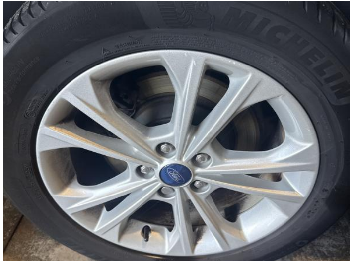
10: Wheel osr Scratched Up To 50mm