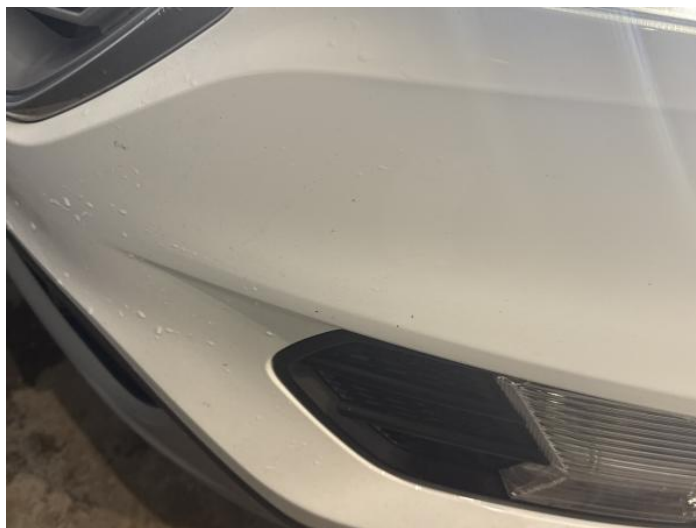
2: Bumper Front Chipped 1 To 5