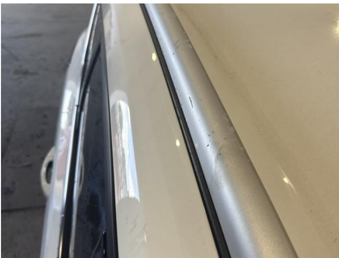
13: Roof Dented Over 30mm