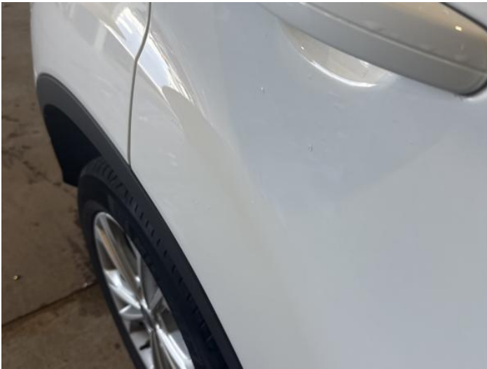
11: Door osr Dented Between 10mm + 30mm