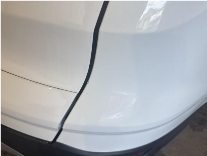
9: Bumper Rear Dented Between 10mm + 30mm