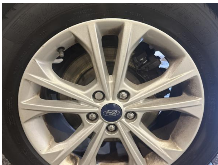
8: Wheel nsr Scratched Up To 50mm