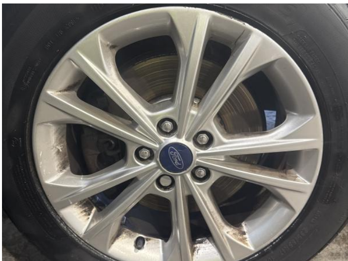
3: Wheel nsf Scratched Up To 50mm