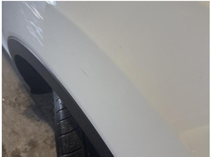
12: Wing osf Scratched UpTo 25mm Not Thru Paint