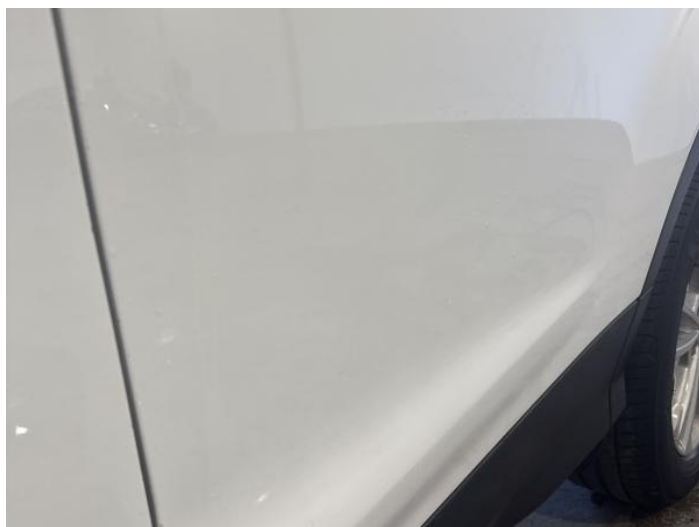
6: Door nsr Dented With Paint Damage