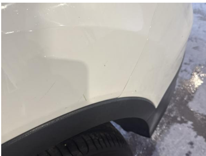
7: Qtr Panel nsr Scratched Up To 25mm Thru Paint