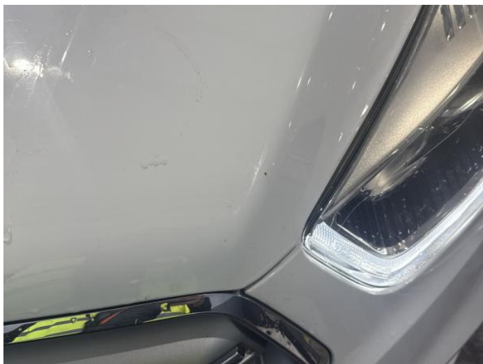
1: Bonnet Chipped 1 To 5