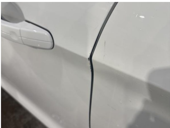
5: Door nsf Chipped Edge Chip