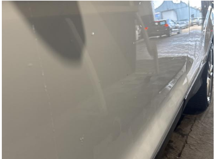
4: Door nsf Poor Previous Repair Rippled UpTo 30%