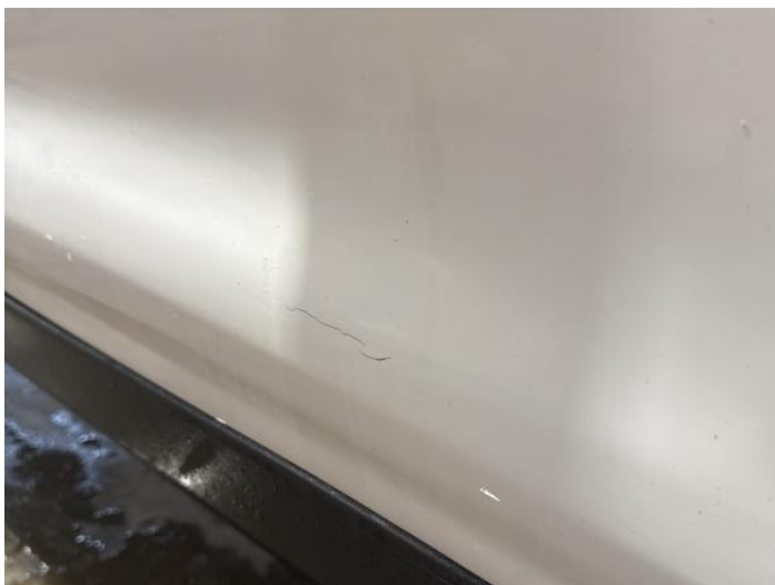
9: Door nsf Poor Previous Repair Rippled Over 30%