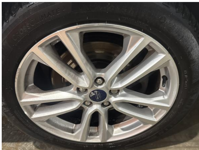
10: Wheel osf Scratched Over 50mm