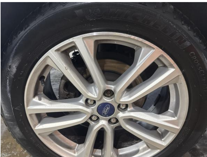
7: Wheel osr Scratched Over 50mm