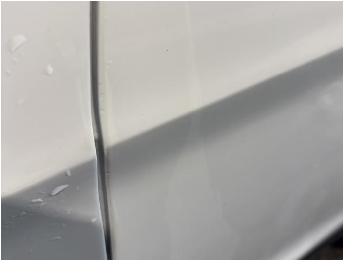
5: Door nsr Poor Previous Repair Poor Paint