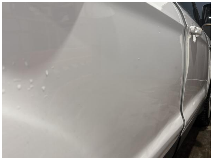
8: Door osr Poor Previous Repair Rippled UpTo 30%