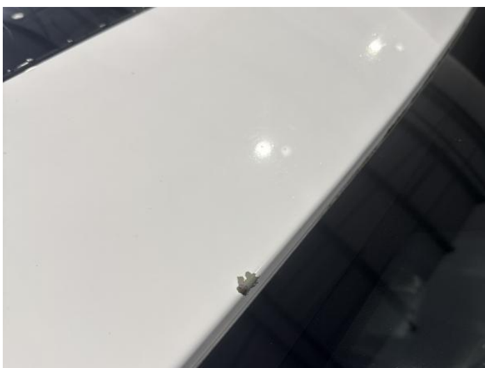
11: Roof Chipped Over 5mm