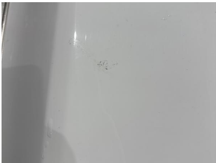
1: Bonnet Scratched Over 25mm Thru Paint