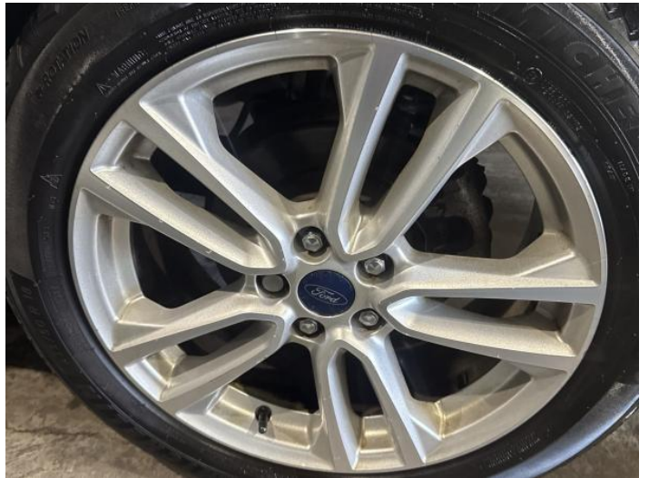
6: Wheel nsr Scratched Over 50mm