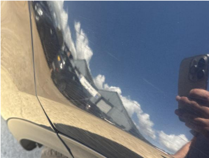
3: Wing nsf Scratched Over 25mm Thru Paint