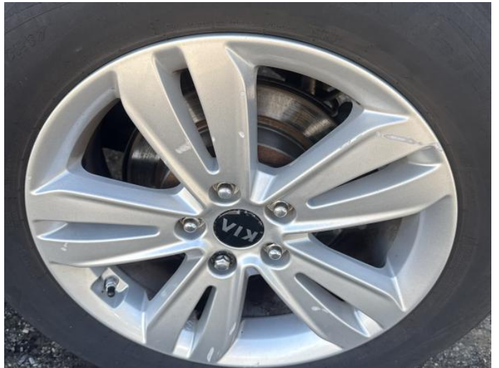
6: Wheel nsr Scratched Over 50mm