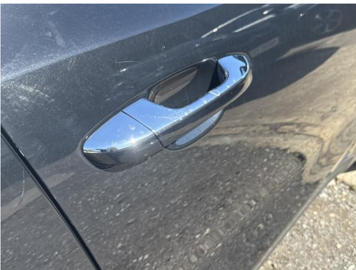
13: Door osf Scratched Over 25mm Thru Paint