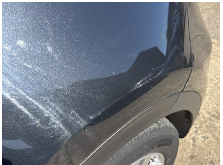
14: Wing osf Chipped Multiple Chips