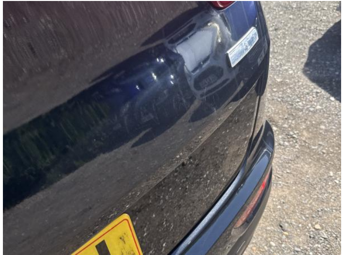
10: Tailgate Scratched Over 25mm Thru Paint