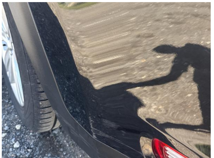
8: Bumper Rear Scratched Over 100mm Thru Paint