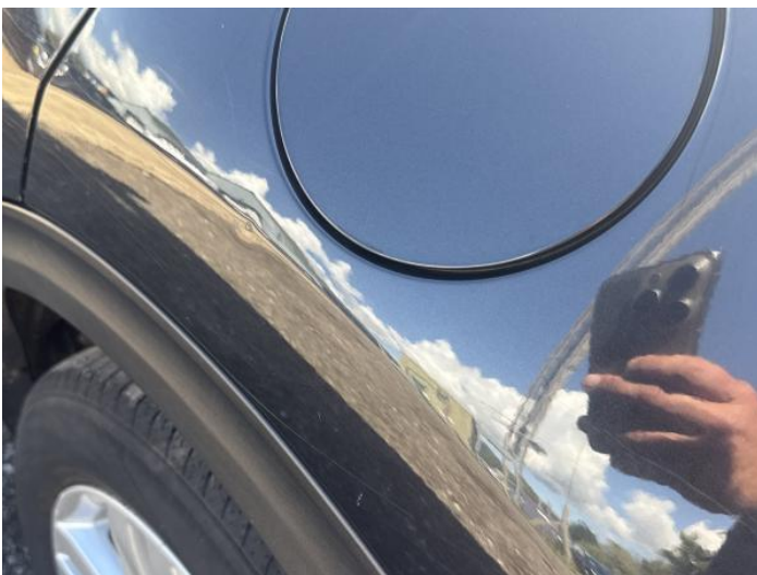
7: Qtr Panel nsr Dented With Paint Damage