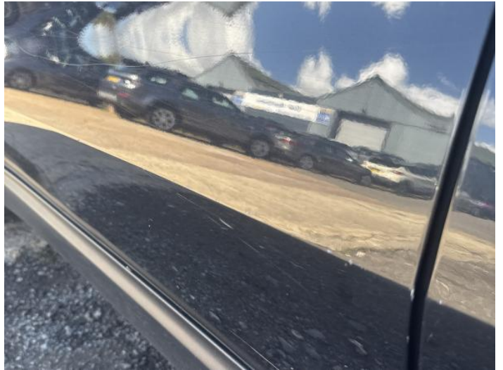
4: Door nsf Scratched Over 25mm Thru Paint