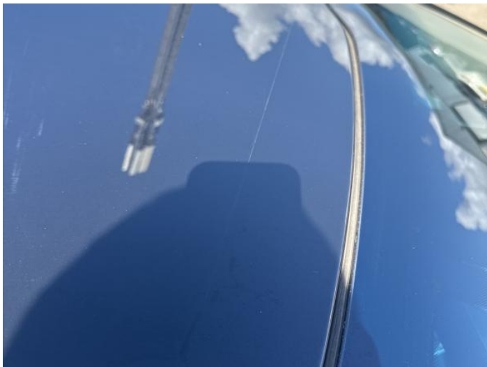
15: Roof Scratched Over 25mm Thru Paint