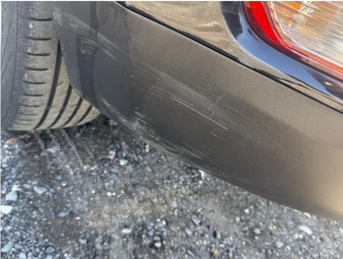
9: Bumper Rear Moulding Scuffed (Unpainted) Over 100mm