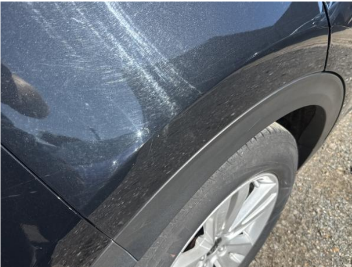
11: Qtr Panel osr Scratched Over 25mm Thru Paint