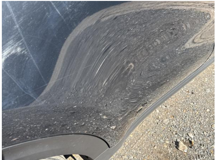
12: Door osr Scratched Over 25mm Thru Paint