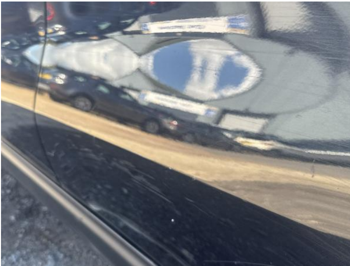
5: Door nsr Dented With Paint Damage