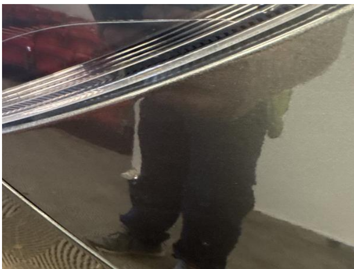
5: Wing nsf Chipped 1 To 5