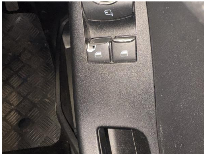
16: Door Pad osf Broken Replace