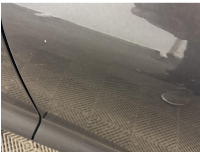
7: Door nsr Chipped 1 To 5