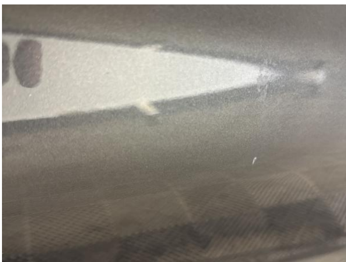
13: Door osf Chipped 1 To 5