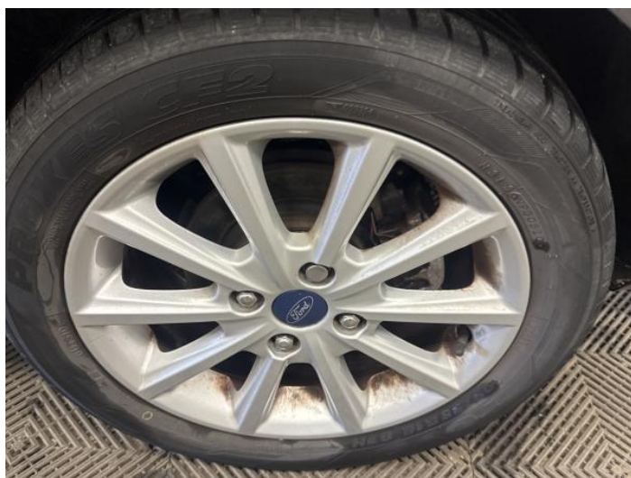
8: Wheel nsr Scratched Up To 50mm