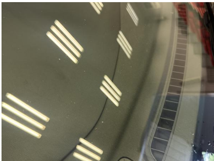
1: Screen Front Chipped UpTo 10mm