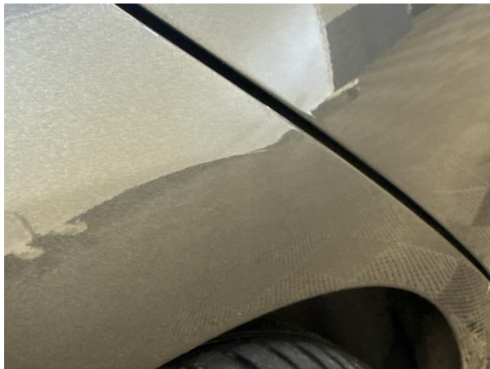
10: Qtr Panel osr Dented 2 Or Less UpTo 10mm