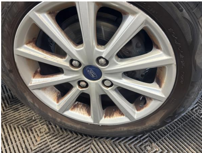
15: Wheel osf Scratched Over 50mm