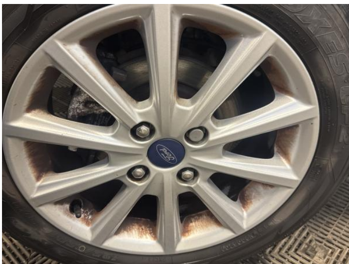
11: Wheel osr Scratched Over 50mm