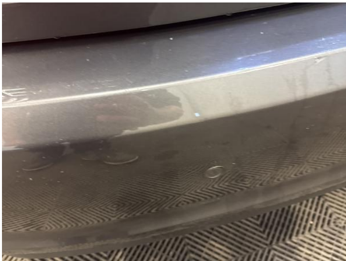
9: Bumper Rear Chipped Multiple Chips