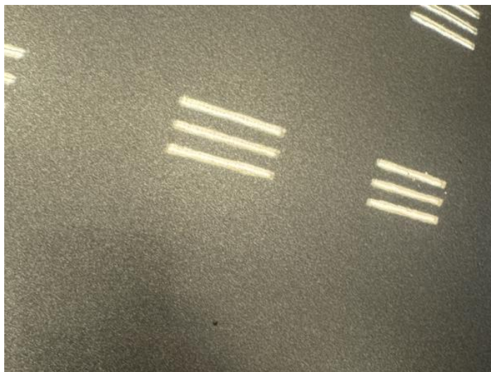
2: Bonnet Chipped 1 To 5