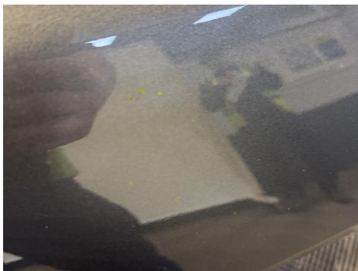
14: Wing osf Chipped 1 To 5