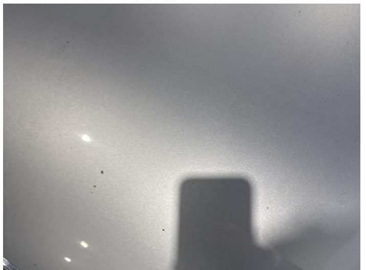
8: Bonnet Chipped Multiple Chips