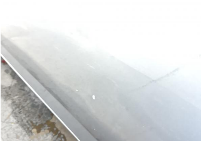
5: Door nsf Dented With Paint Damage