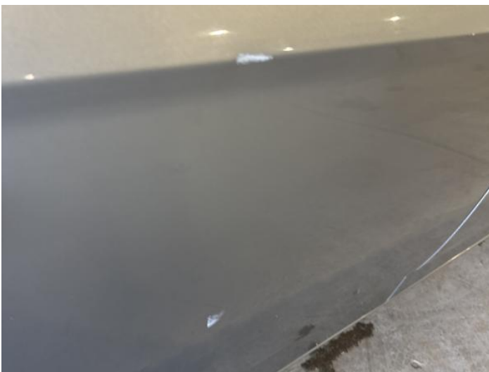
13: Door osr Dented With Paint Damage