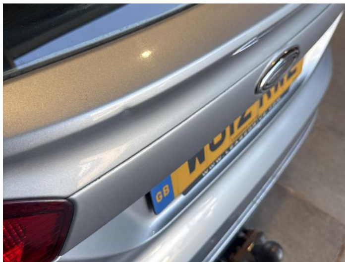
2: Boot Lid Dented With Paint Damage