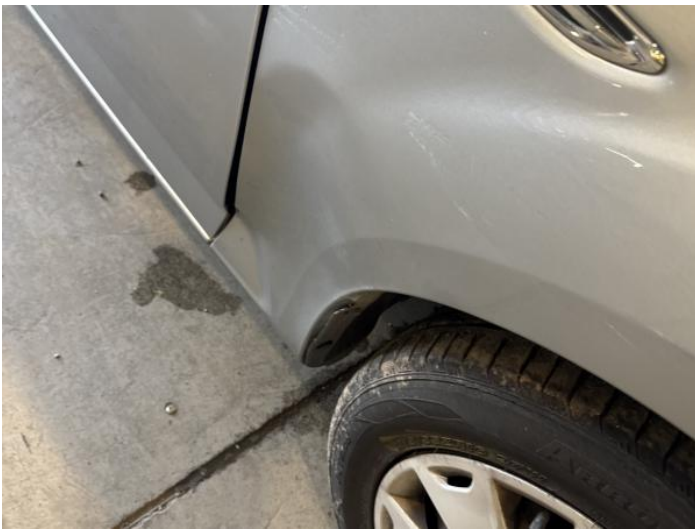
11: Wing osf Dented With Paint Damage