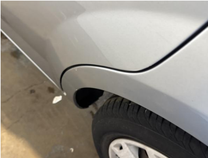
3: Qtr Panel nsr Dented With Paint Damage