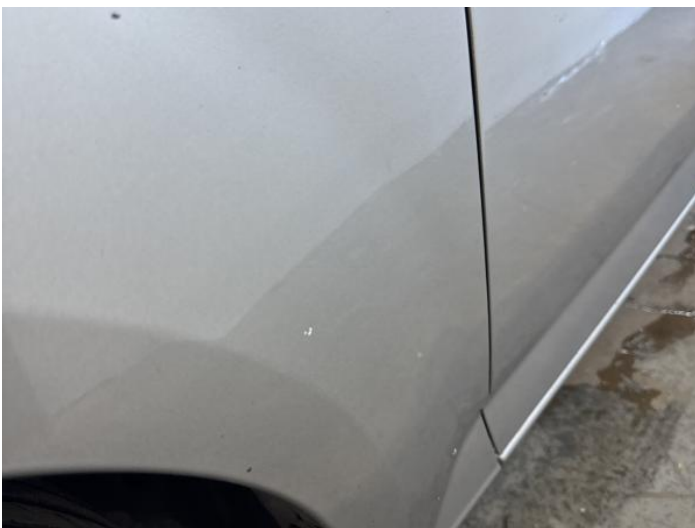
7: Wing nsf Poor Previous Repair Poor Paint