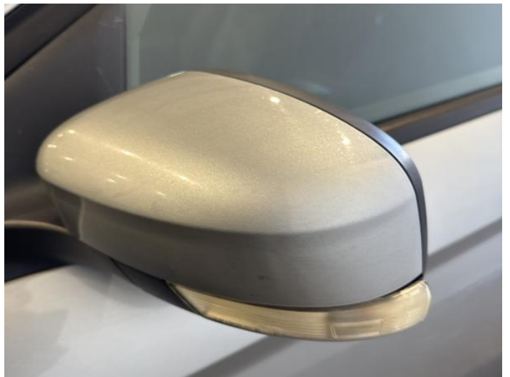
6: Door Mirror Assy nsf Broken Replace