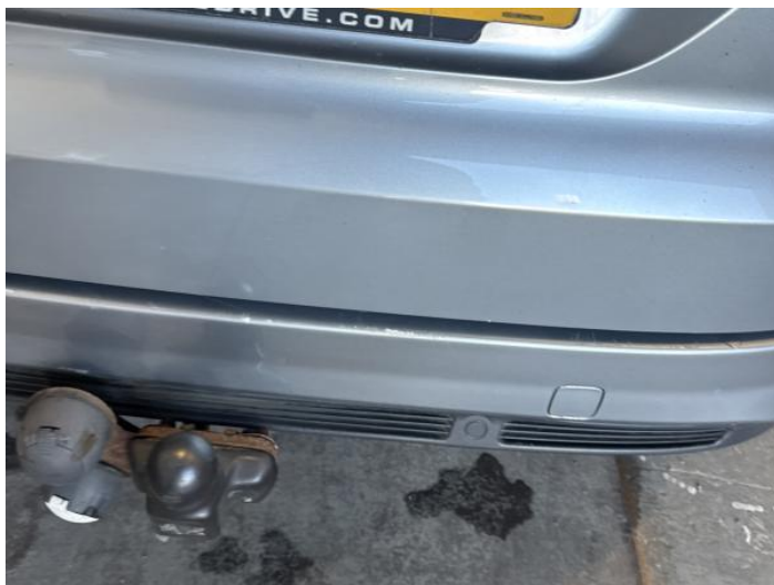
1: Bumper Rear Scratched Over 100mm Thru Paint