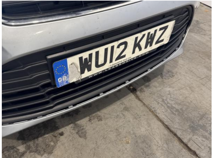
10: Bumper Front Grill Broken Replace