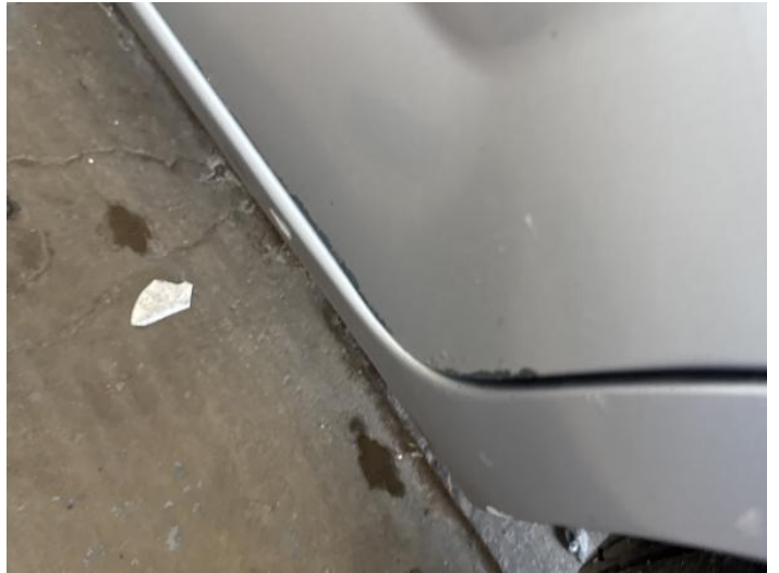
4: Door nsr Rusted Over 5mm