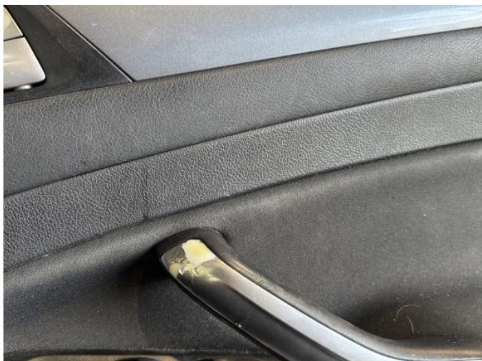
15: Handle Inner osf Damaged Replace