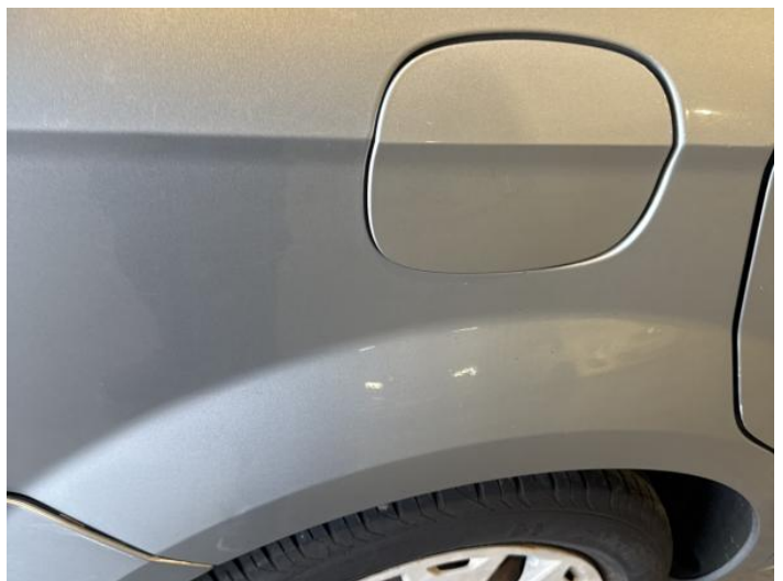
14: Qtr Panel osr Dented With Paint Damage