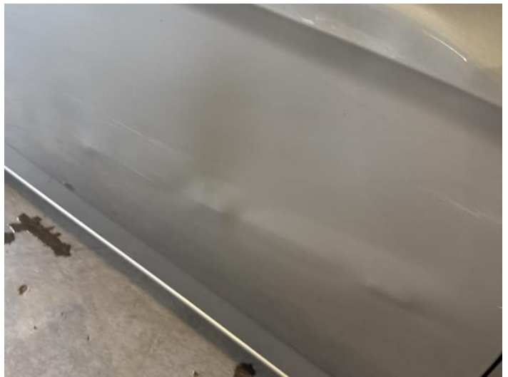
12: Door osf Dented With Paint Damage