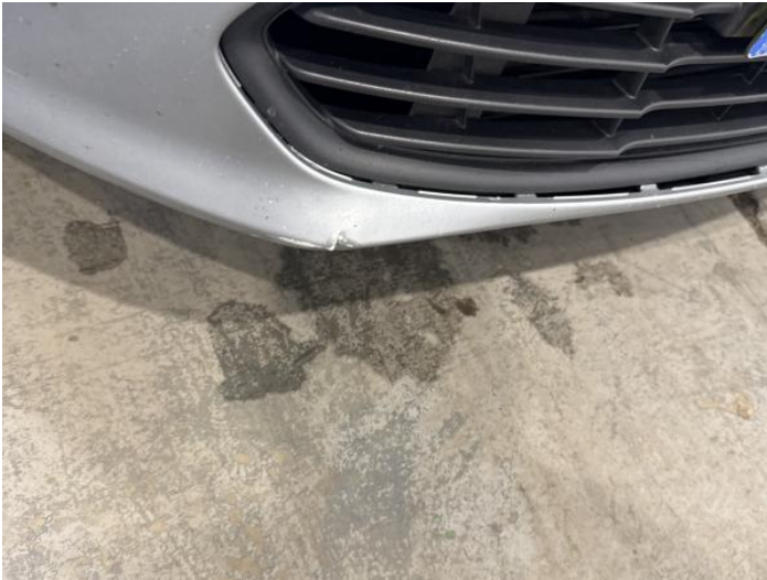
9: Bumper Front Cracked UpTo 25mm