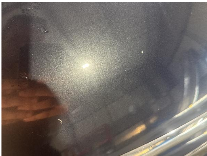
1: Bonnet Chipped 1 To 5