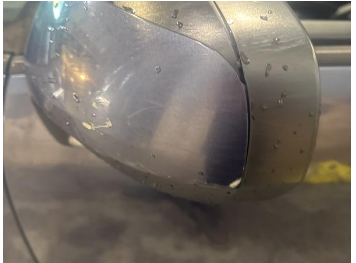
18: Door Mirror Assy nsf Scratched (Painted) Over 25mm Thru Paint