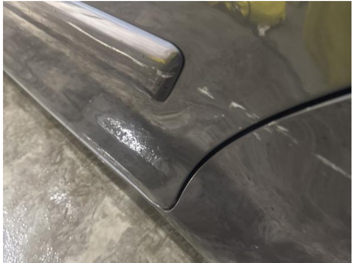
16: Door nsr Dented With Paint Damage