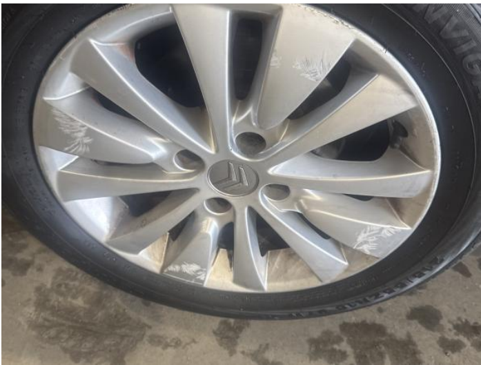
11: Wheel osr Scratched Over 50mm