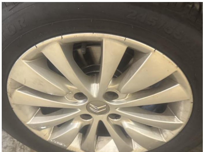
20: Wheel nsf Scratched Over 50mm