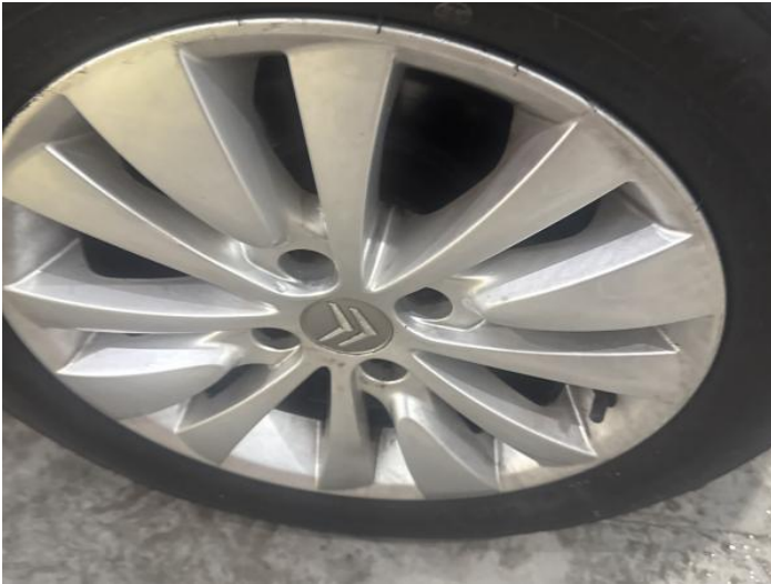
15: Wheel nsr Scratched Over 50mm