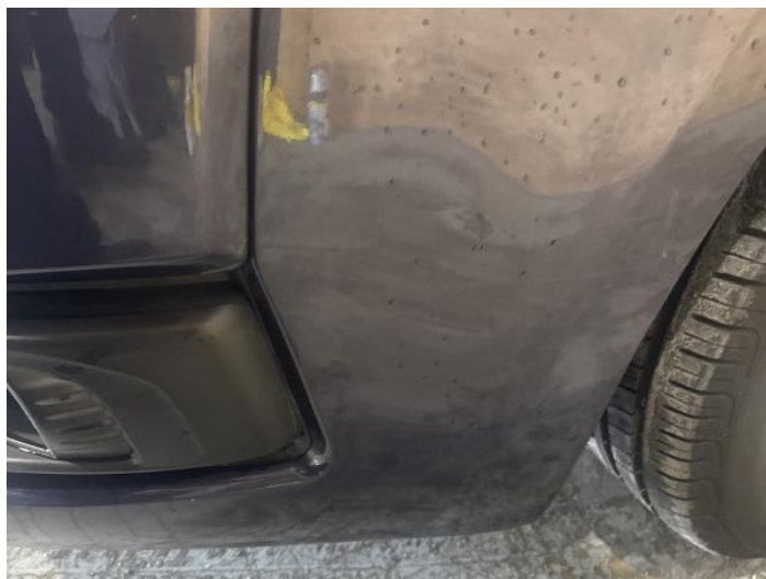
2: Bumper Front Scratched 25 to 100mm Thru Paint