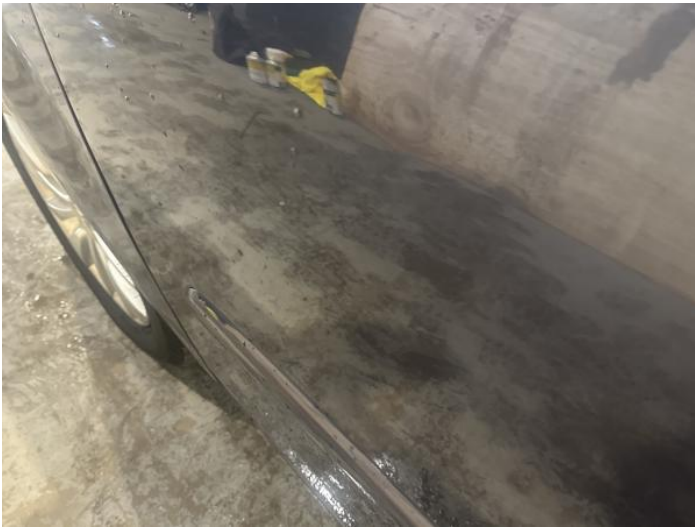
17: Door nsf Dented Over 2 UpTo 10mm