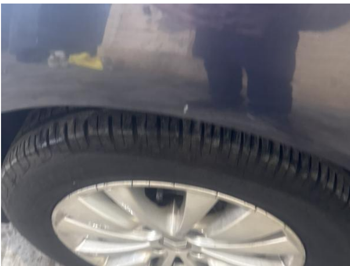
19: Wing nsf Chipped 1 To 5