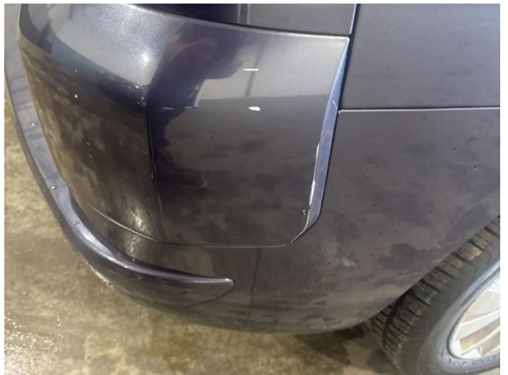
12: Bumper Rear Scratched Over 100mm Thru Paint