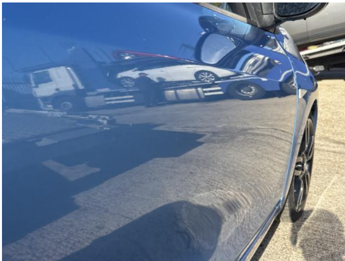
17: Door osf Poor Previous Repair Poor Paint