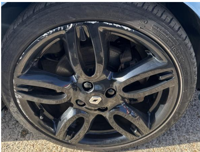
19: Wheel osf Scratched Over 50mm