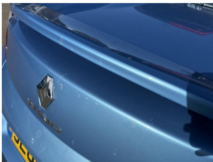
12: Boot Lid Chipped 1 To 5