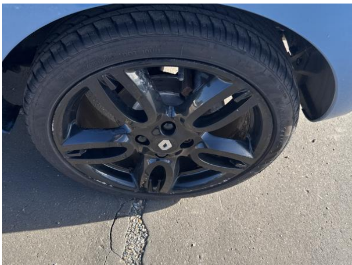
9: Wheel nsr Scratched Over 50mm