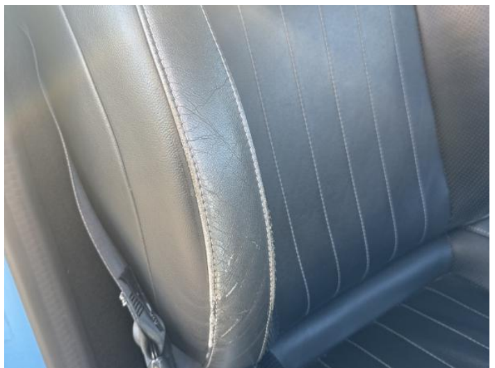
20: Seat Back Cover osf Scuffed Over 25mm