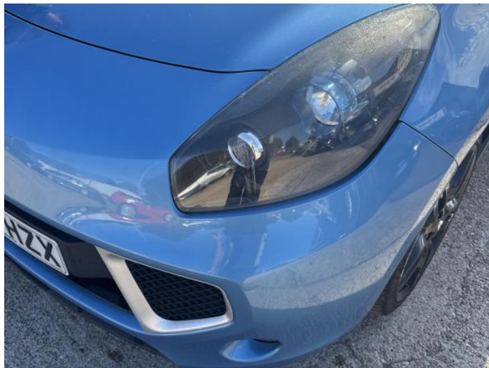
2: Bumper Front Chipped Multiple Chips