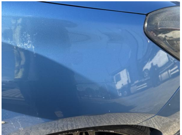
18: Wing osf Chipped 1 To 5