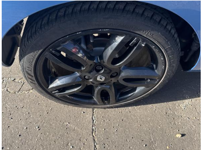
16: Wheel osf Scratched Over 50mm