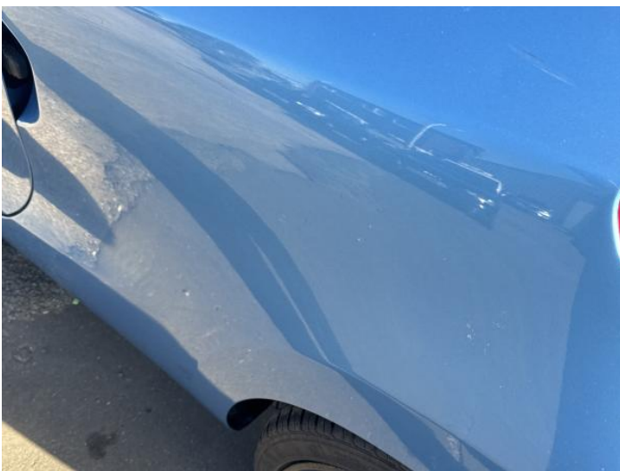
7: Qtr Panel nsr Dented Over 2 UpTo 10mm