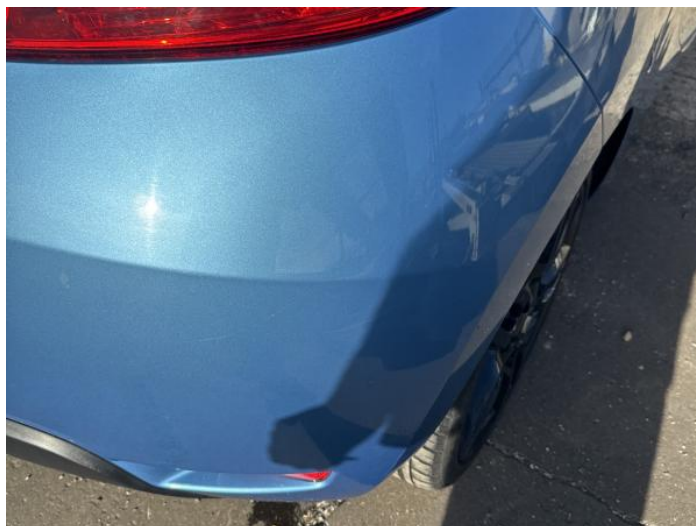
10: Bumper Rear Scratched 25 to 100mm Thru Paint