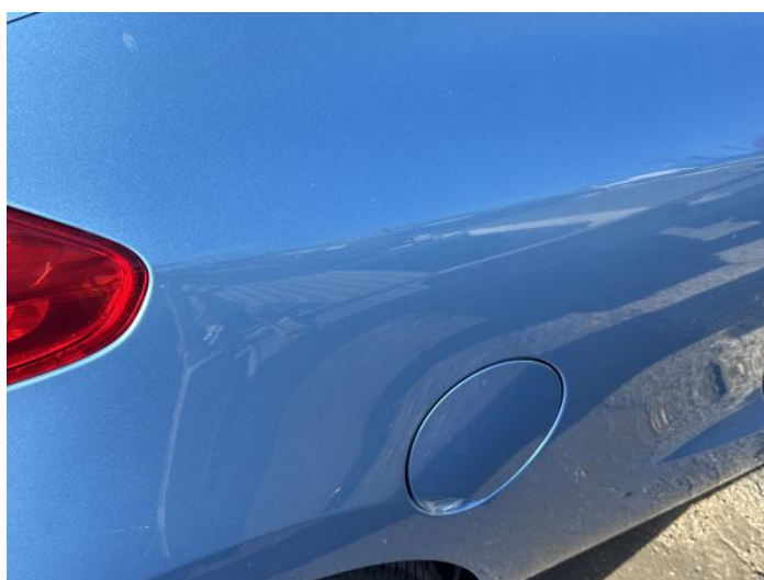
14: Qtr Panel osr Chipped 1 To 5