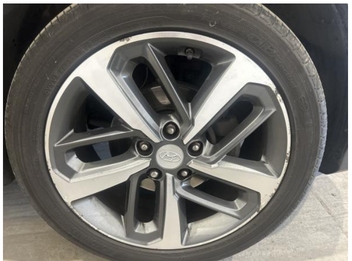
8: Wheel osf Scratched Over 50mm