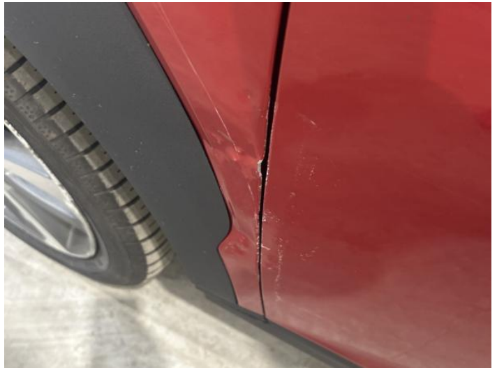
6: Wing nsf Dented With Paint Damage