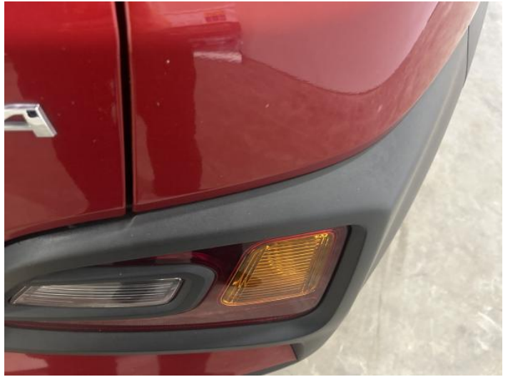
4: Qtr Panel osr Chipped 1 To 5