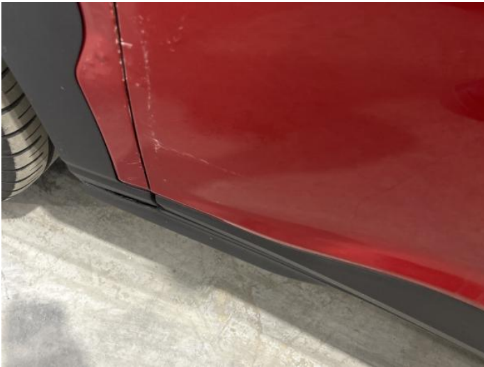
5: Door nsf Scratched Over 25mm Thru Paint