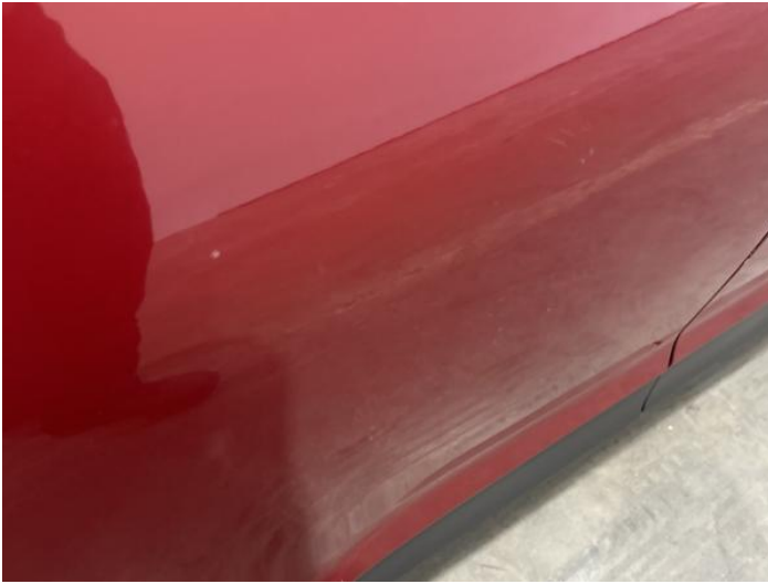
3: Door osr Chipped 1 To 5