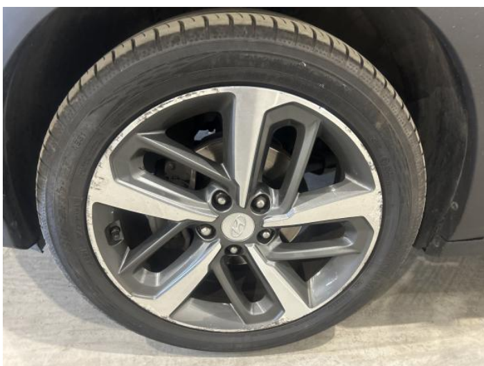
11: Wheel nsf Scratched Over 50mm