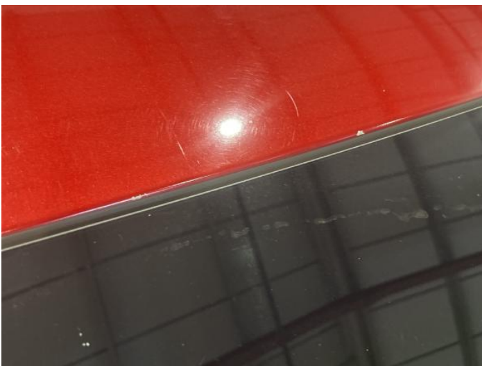
7: Roof Chipped 1 To 5