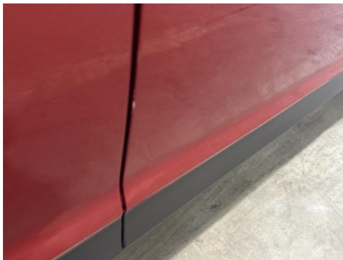
2: Door osf Chipped Edge Chip