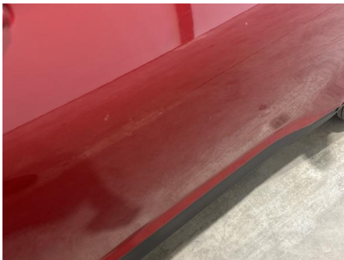
1: Door osf Chipped 1 To 5