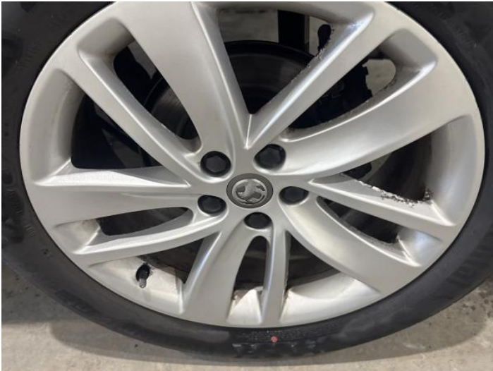
9: Wheel nsr Corroded Light