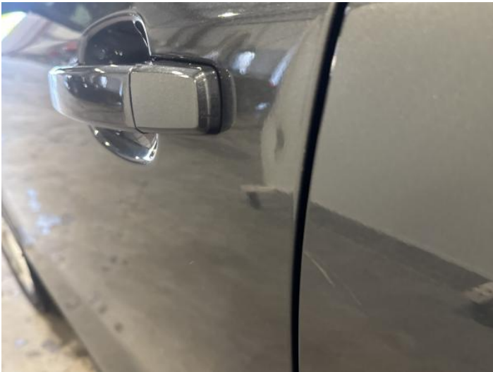
11: Door nsf Dented Over 2 UpTo 10mm