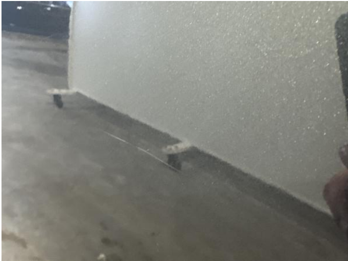
10: Door nsr Scratched Over 25mm Not Thru Paint