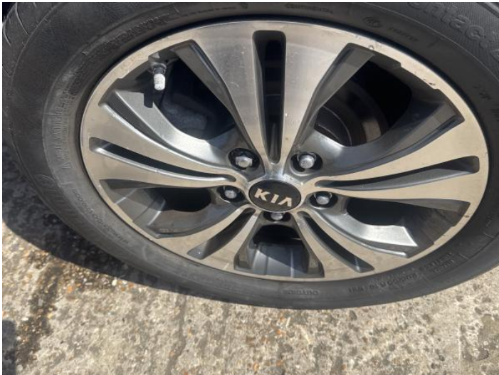
6: Wheel osr Scratched Over 50mm