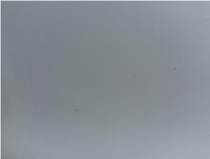
3: Wing osf Chipped 1 To 5