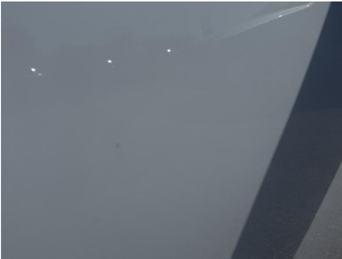
5: Door osf Chipped 1 To 5