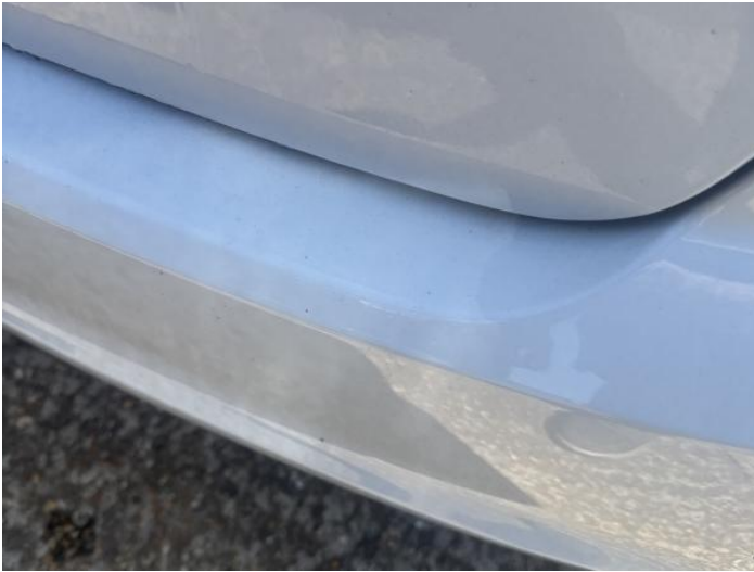
7: Bumper Rear Chipped Multiple Chips