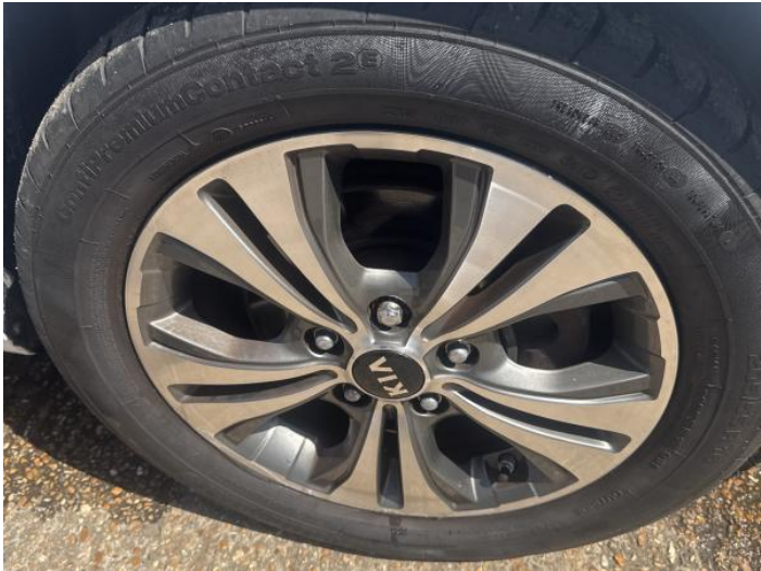
4: Wheel osf Scratched Over 50mm