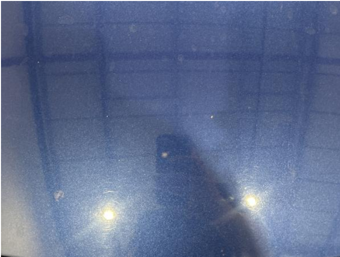
9: Bonnet Chipped 1 To 5