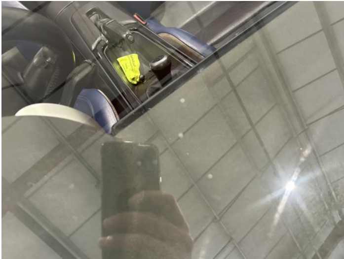
10: Screen Front Chipped UpTo 10mm