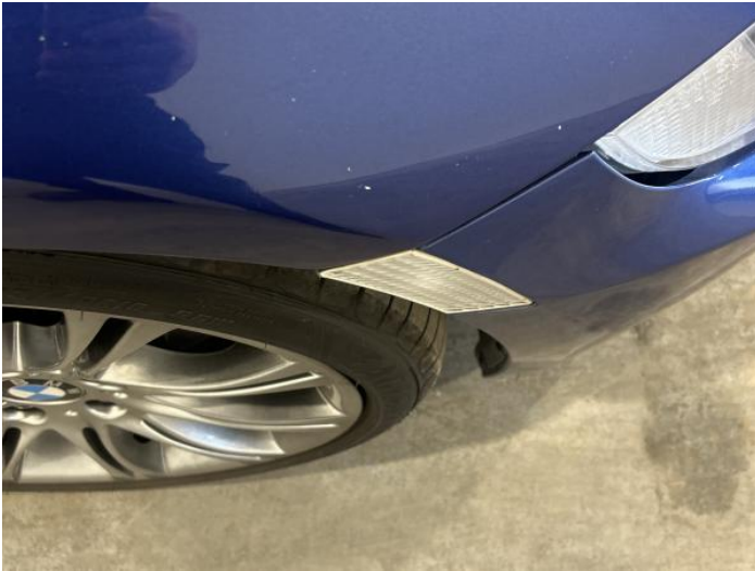
3: Wing osf Chipped 1 To 5