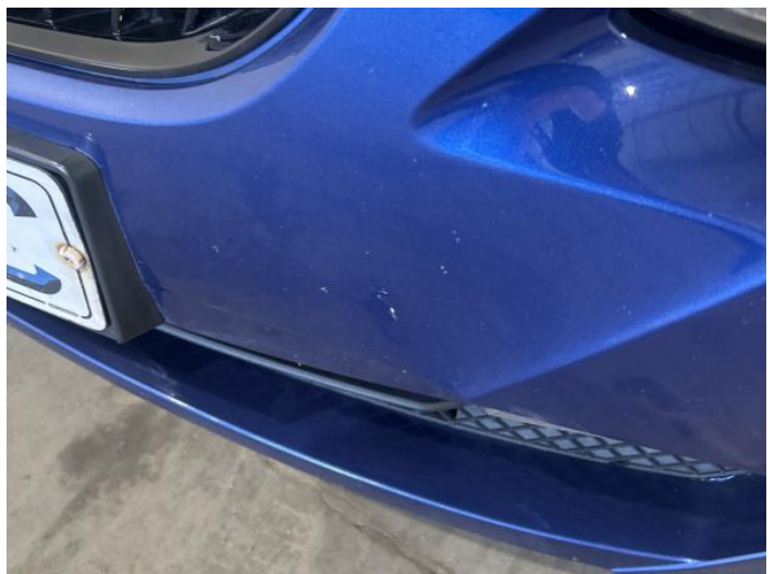
8: Bumper Front Chipped Multiple Chips