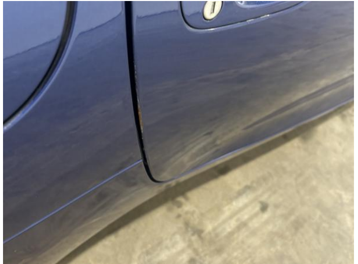
4: Door osf Chipped Edge Chip