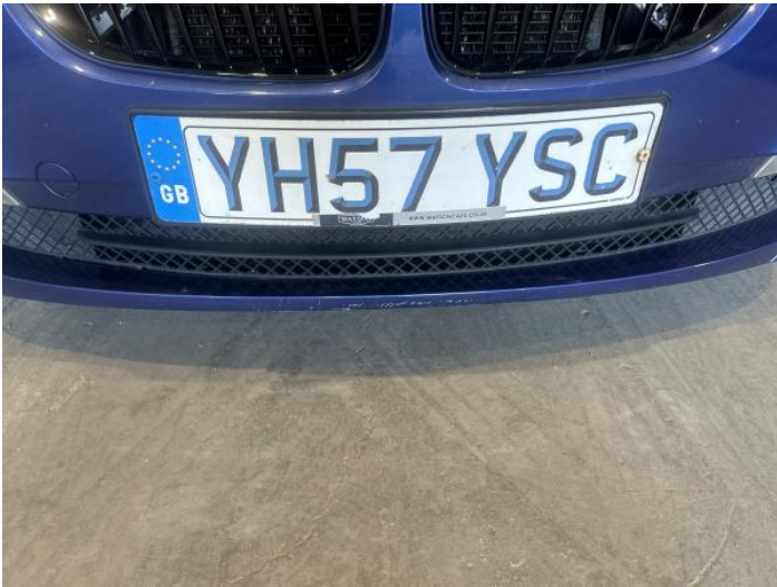
11: Bumper Front Scratched 25 to 100mm Thru Paint