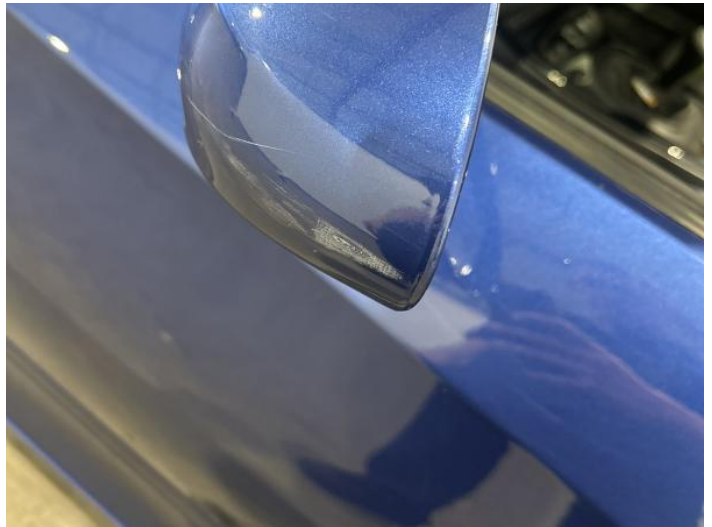
6: Door Mirror Assy nsf Scratched (Painted) UpTo 25mm Thru Paint