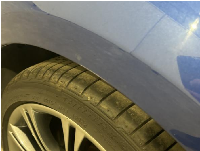
5: Qtr Panel nsf Scratched Over 25mm Not Thru Paint