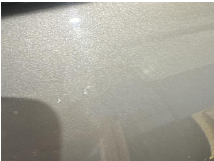
9: Boot Lid Chipped 1 To 5