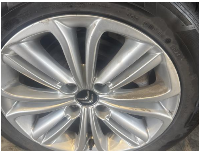
11: Wheel nsr Scratched Over 50mm