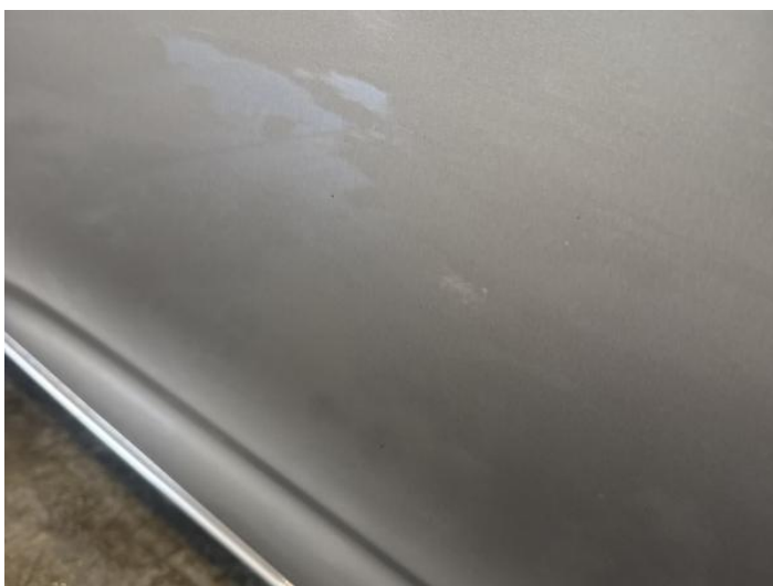
13: Door nsf Scratched UpTo 25mm Not Thru Paint