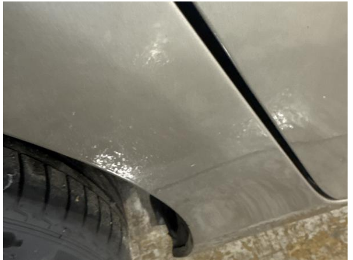
6: Qtr Panel osr Chipped 1 To 5