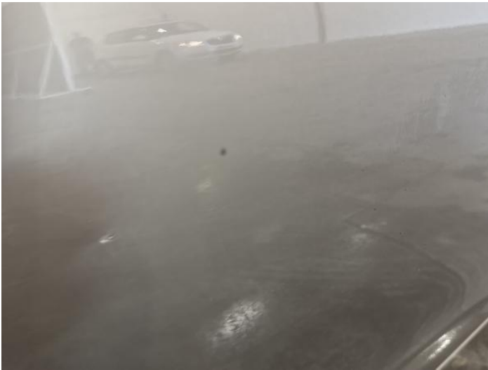
5: Door osf Chipped 1 To 5