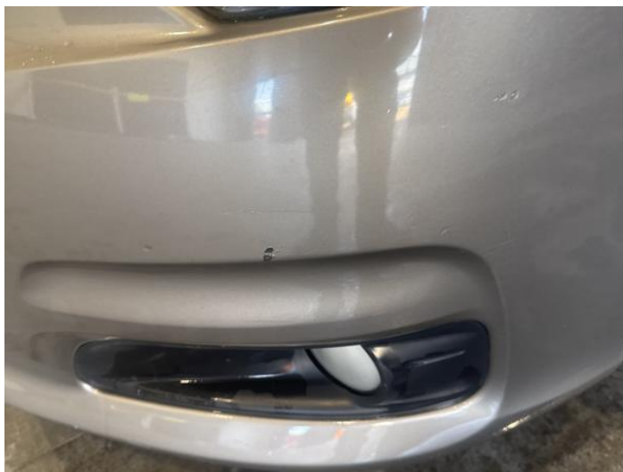
1: Bumper Front Scratched 25 to 100mm Thru Paint