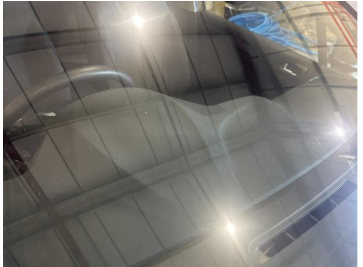
4: Screen Front Chipped UpTo 10mm