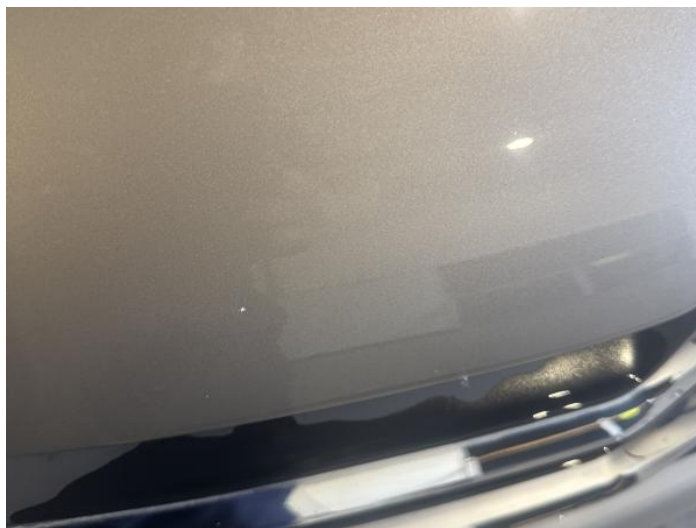
2: Bonnet Chipped 1 To 5