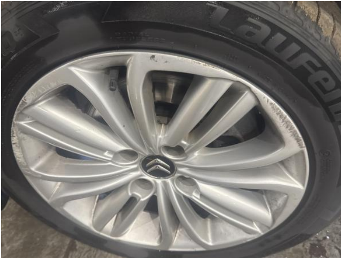
3: Wheel osf Scratched Over 50mm