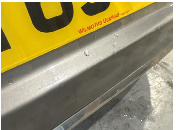
8: Bumper Rear Chipped 1 To 5