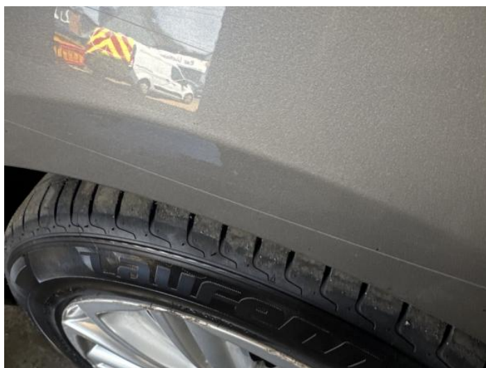
14: Wing nsf Scratched Over 25mm Thru Paint