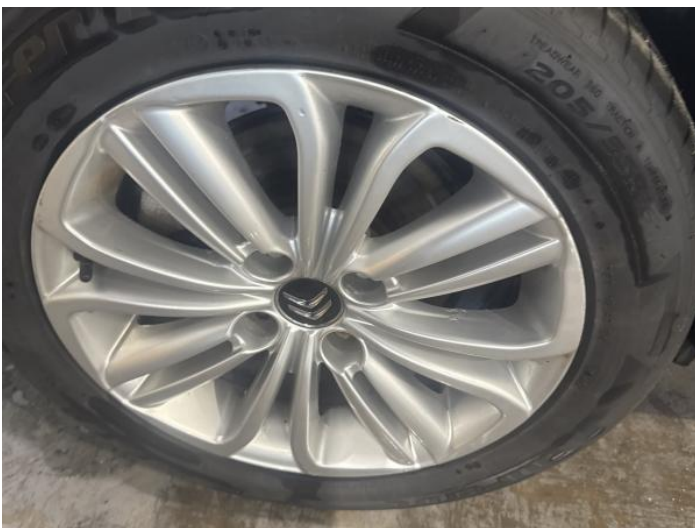
7: Wheel osr Scratched Over 50mm