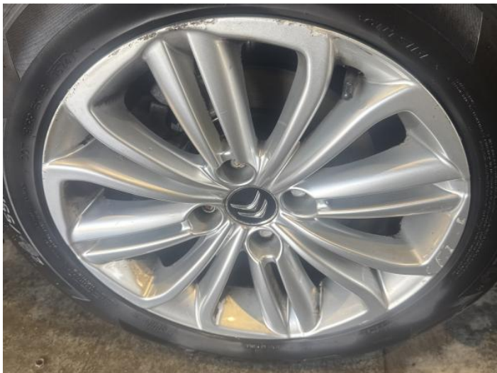
15: Wheel nsf Scratched Over 50mm