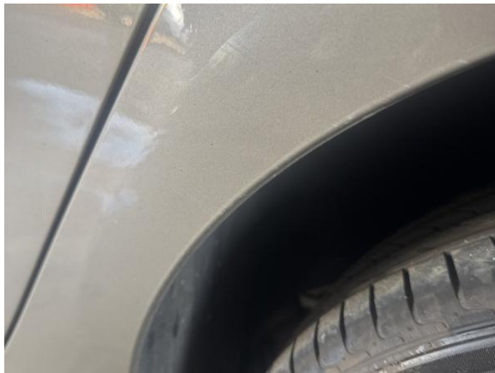
10: Qtr Panel nsr Chipped Multiple Chips