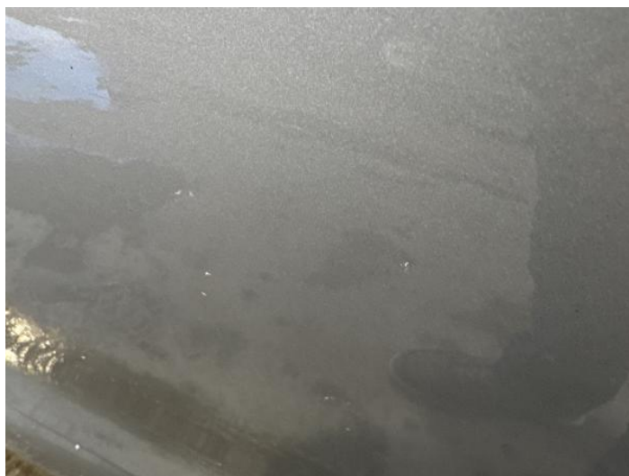
12: Door nsr Chipped 1 To 5