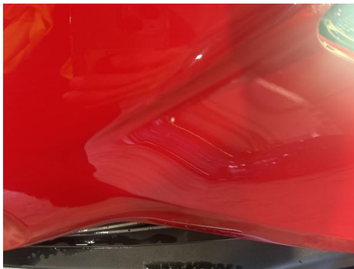
2: Bumper Front Chipped 1 To 5