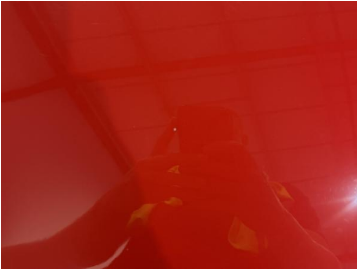
3: Bonnet Chipped 1 To 5