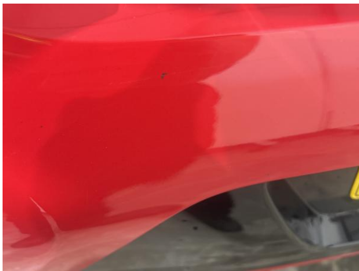
1: Bumper Rear Chipped 1 To 5