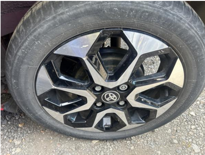
5: Wheel nsr Scratched Up To 50mm