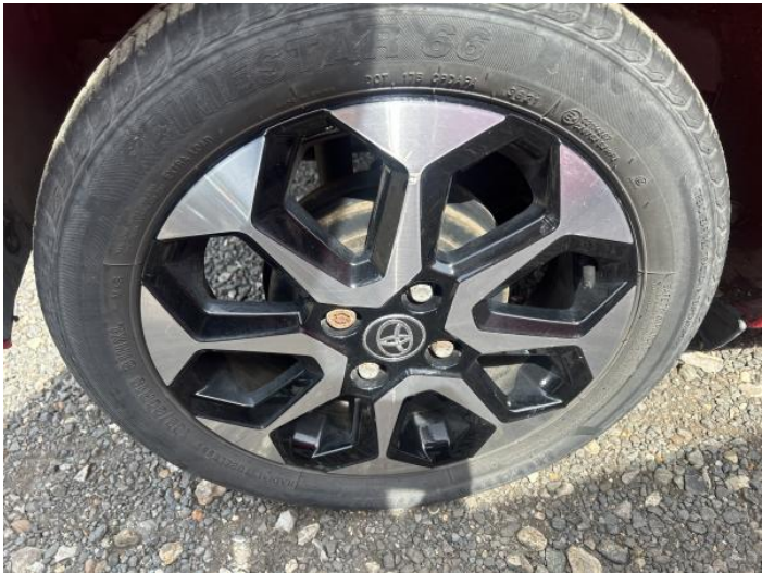
6: Wheel osr Scratched Up To 50mm

Carpet Condition Average Seat Condition Average