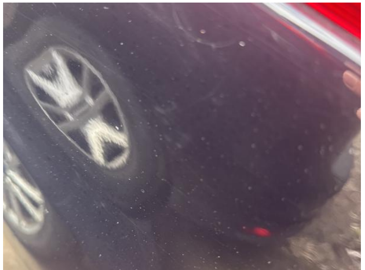
12: Qtr Panel nsr Chipped 1 To 5