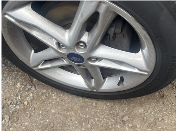
4: Wheel osf Scratched Over 50mm