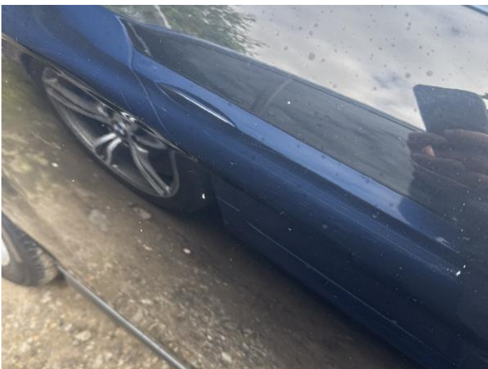
7: Door osr Chipped Multiple Chips