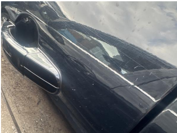
15: Door nsf Chipped 1 To 5