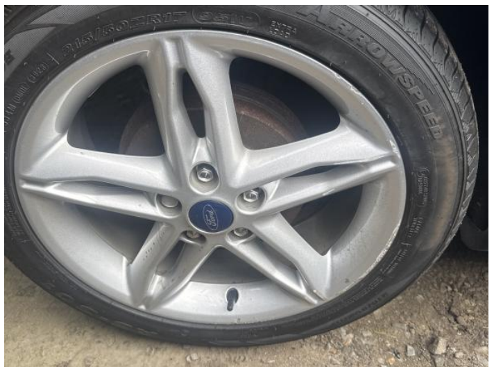
8: Wheel osr Scratched Over 50mm