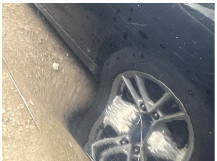
14: Door nsr Scratched Over 25mm Thru Paint