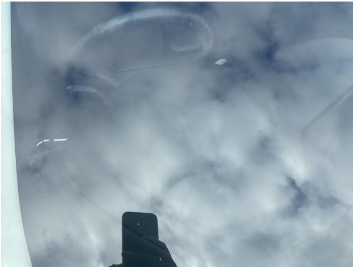
5: Screen Front Chipped UpTo 10mm