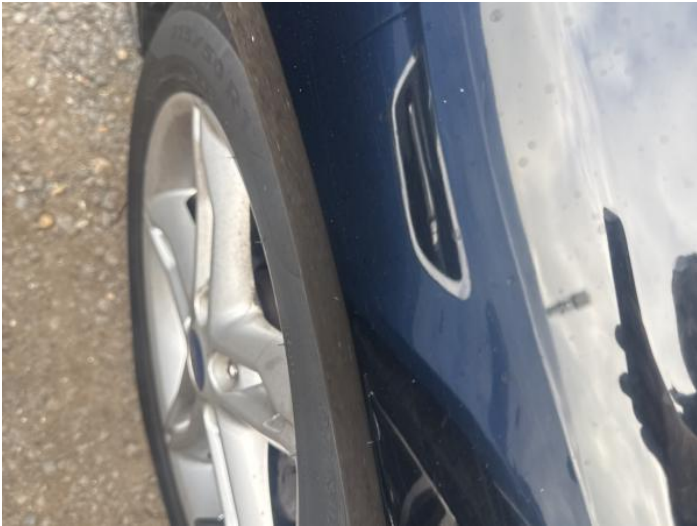
3: Wing osf Chipped Multiple Chips