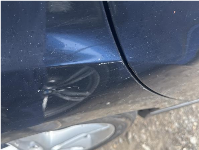
9: Qtr Panel osr Chipped 1 To 5