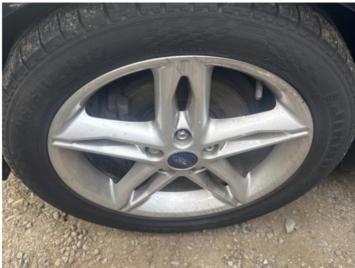
17: Wheel nsf Scratched Over 50mm