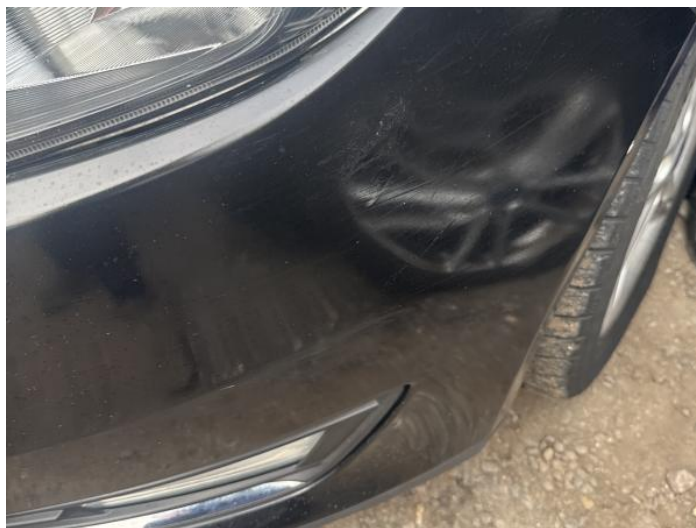
2: Bumper Front Poor Previous Repair Poor Paint