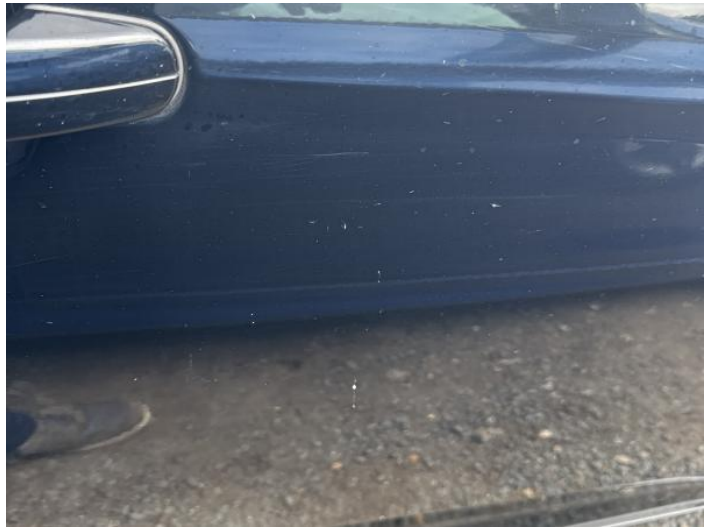
6: Door osf Chipped Multiple Chips