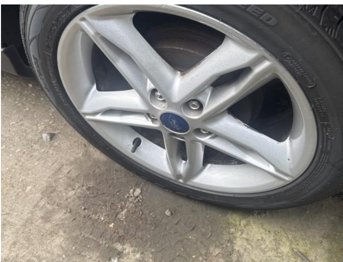
13: Wheel nsr Scratched Over 50mm