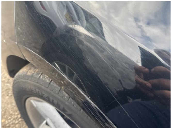
16: Wing nsf Scratched Over 25mm Thru Paint