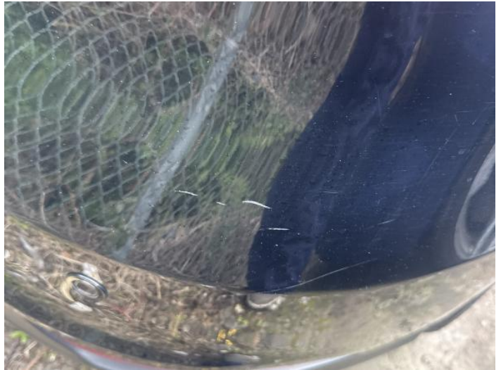
10: Bumper Rear Scratched 25 to 100mm Thru Paint