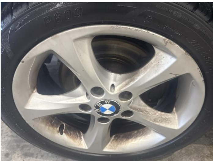
13: Wheel nsf Scratched Over 50mm