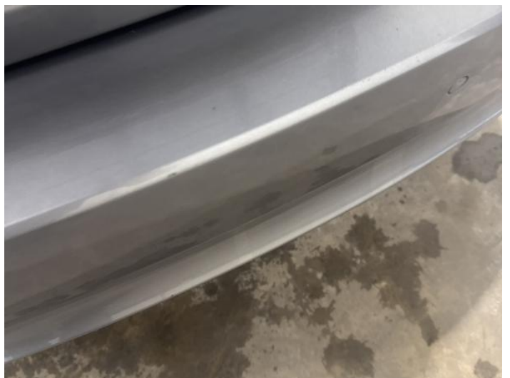
8: Bumper Rear Chipped Multiple Chips