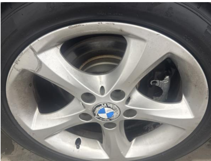
7: Wheel osf Scratched Over 50mm