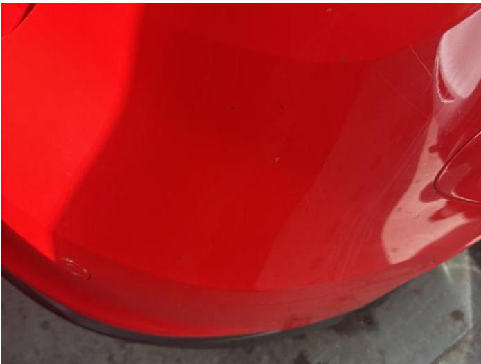
1: Bumper Rear Chipped Multiple Chips