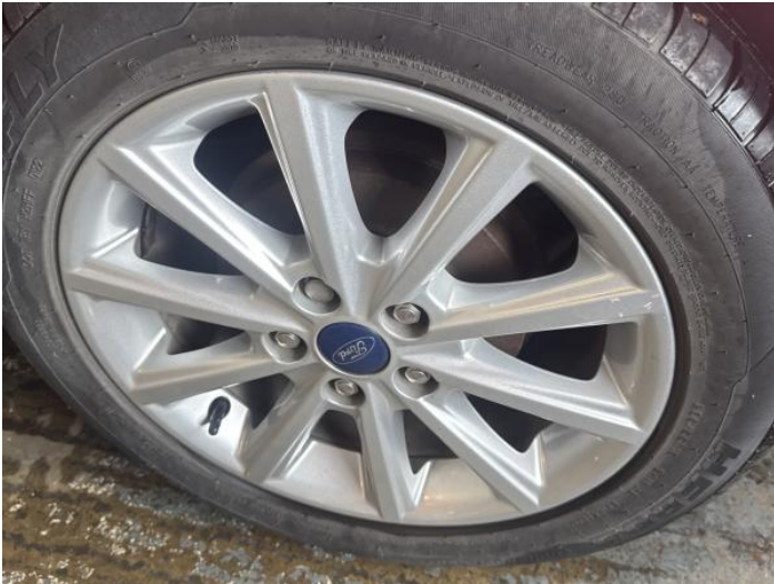
3: Wheel nsr Scratched Over 50mm