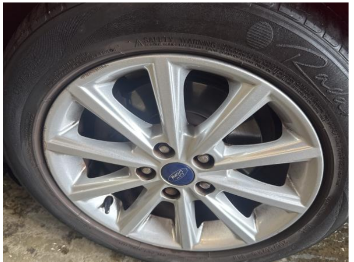
6: Wheel nsf Scratched Over 50mm