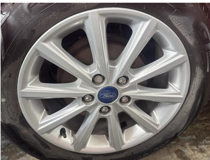
13: Wheel osr Scratched Up To 50mm