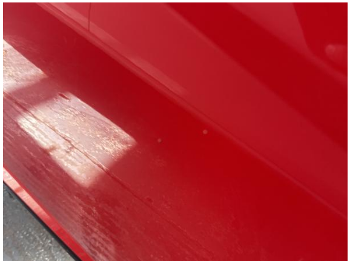
12: Door osf Chipped 1 To 5