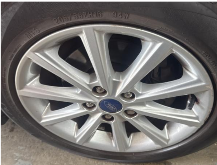
11: Wheel osf Scratched Over 50mm