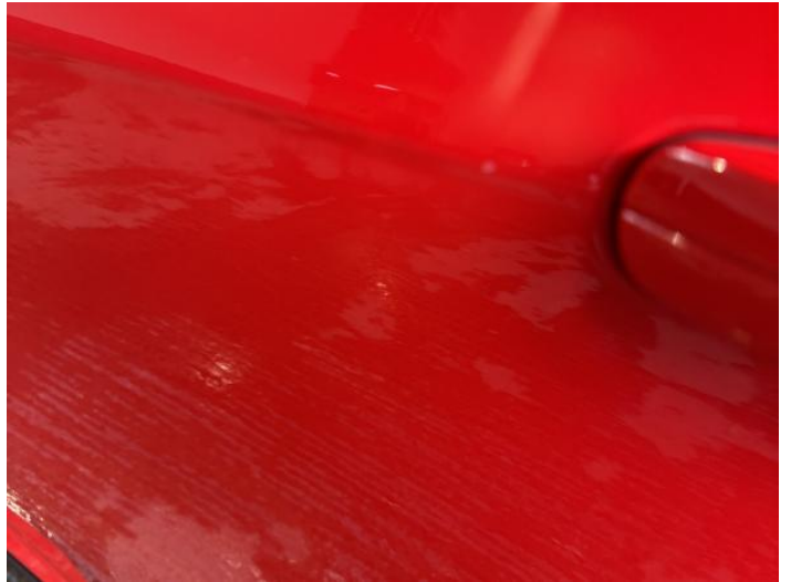
4: Door nsr Chipped 1 To 5