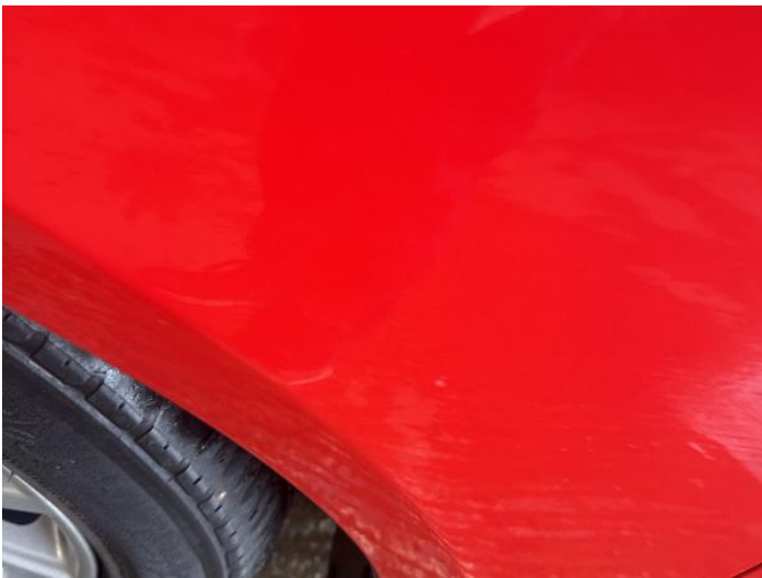
5: Wing nsf Chipped 1 To 5