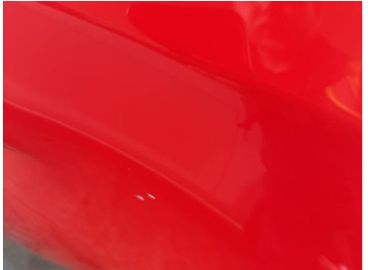
10: Wing osf Chipped 1 To 5