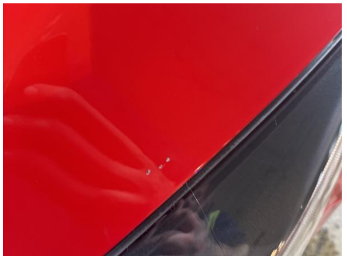
8: Bonnet Chipped 1 To 5