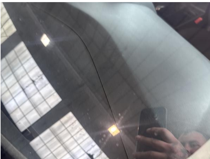
7: Screen Front Chipped UpTo 10mm