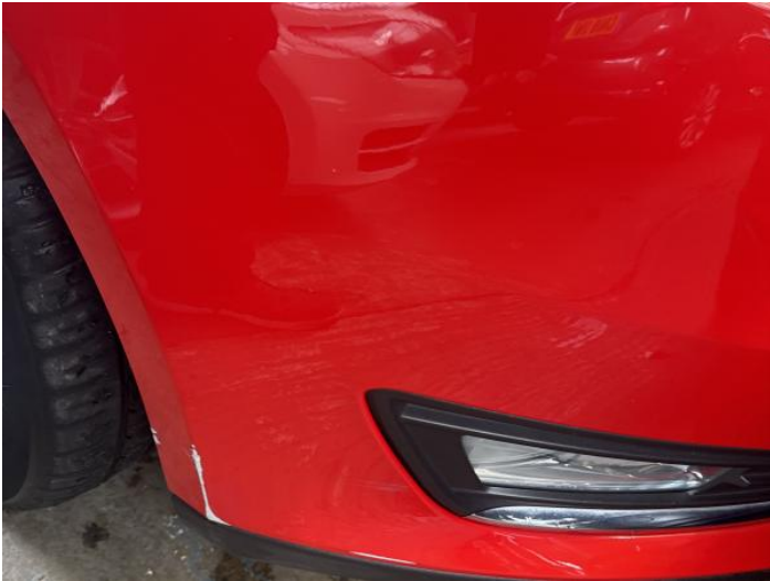
9: Bumper Front Scratched 25 to 100mm Thru Paint