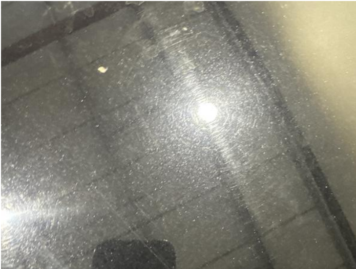
9: Boot Lid Chipped 1 To 5