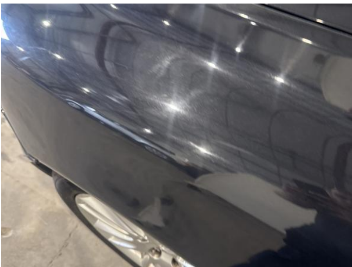
13: Wing nsf Scratched Over 25mm Not Thru Paint