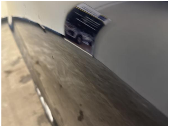
6: Qtr Panel osr Dented With Paint Damage