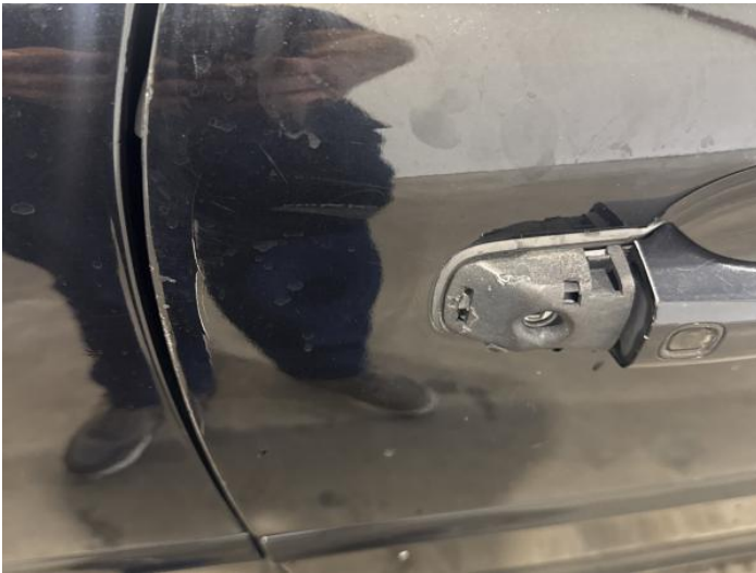
5: Door osf Dented Over 30mm