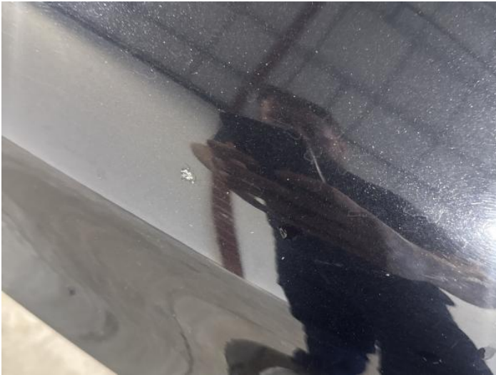
3: Wing osf Chipped Multiple Chips