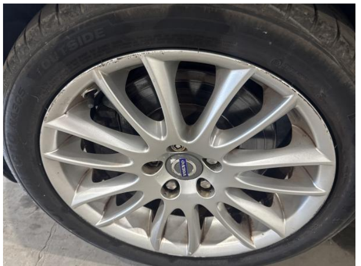
14: Wheel nsf Scratched Over 50mm