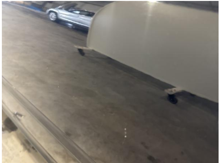
12: Door nsf Dented With Paint Damage