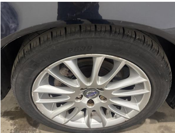
7: Wheel osr Scratched Over 50mm