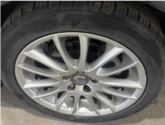
11: Wheel nsr Scratched Over 50mm