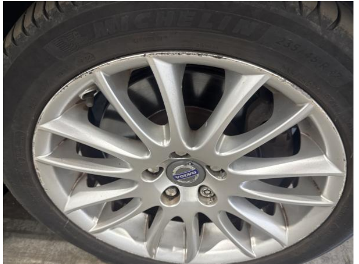
4: Wheel osf Scratched Up To 50mm