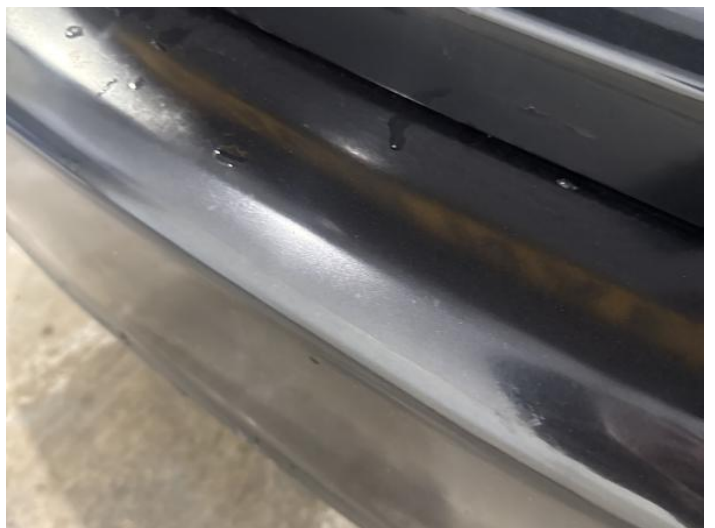
8: Bumper Rear Poor Previous Repair Poor Paint