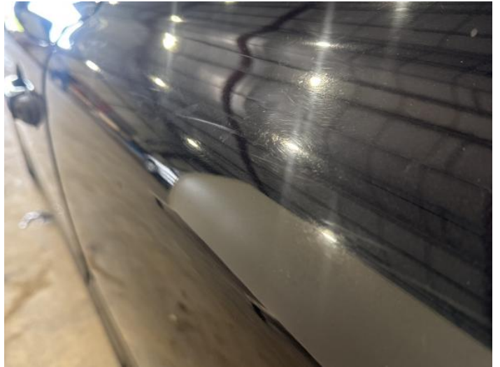
10: Qtr Panel nsr Dented Over 2 UpTo 10mm