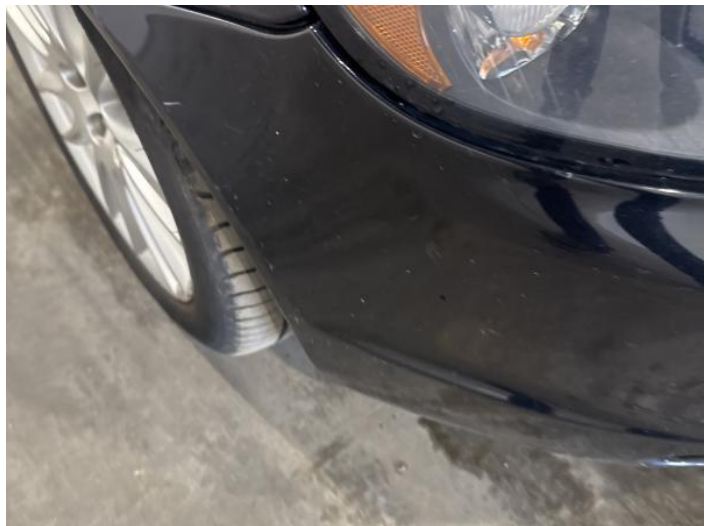
2: Bumper Front Poor Previous Repair Poor Paint