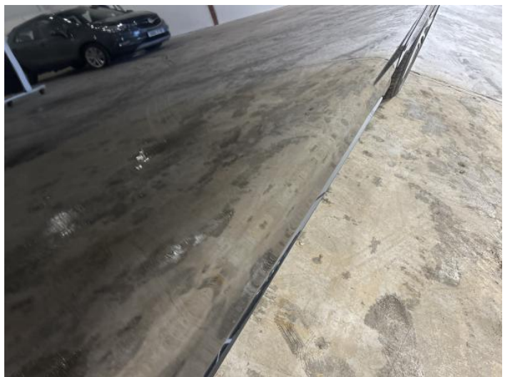
2: Door osf Dented 2 Or Less UpTo 10mm