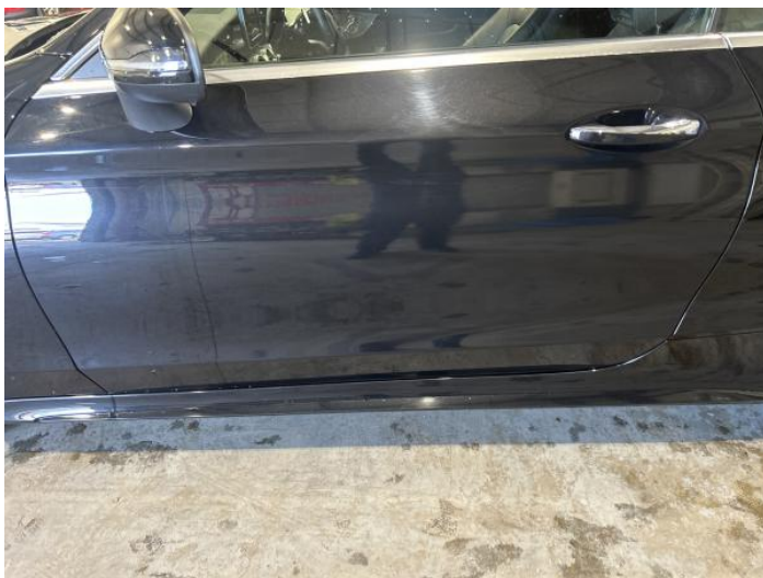
1: Door nsf Poor Previous Repair Poor Colour