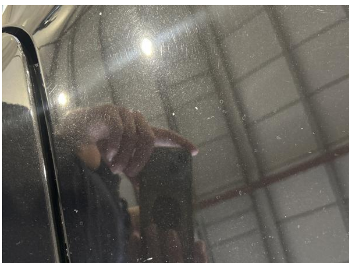
5: Bonnet Chipped 1 To 5