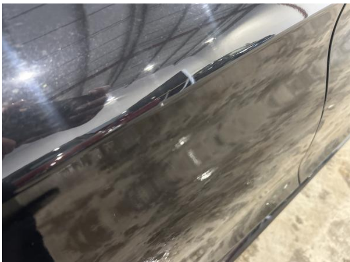
3: Qtr Panel osr Chipped 1 To 5