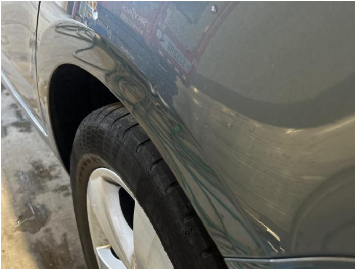
3: Qtr Panel nsr Dented 2 Or Less UpTo 10mm