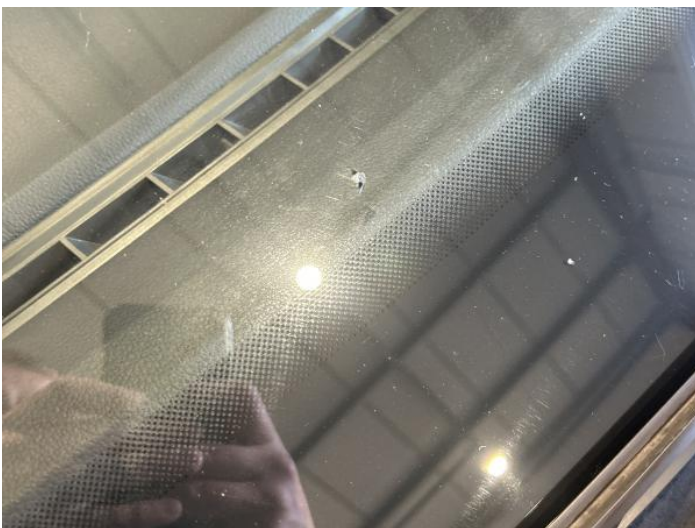
7: Screen Front Chipped UpTo 10mm