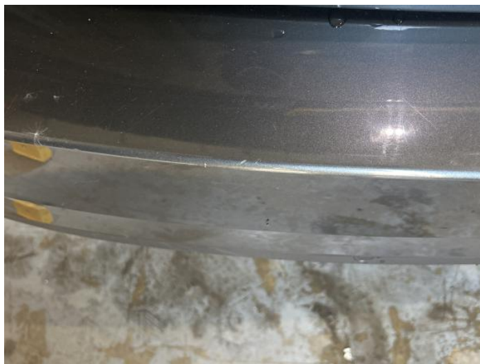
2: Bumper Rear Chipped 1 To 5