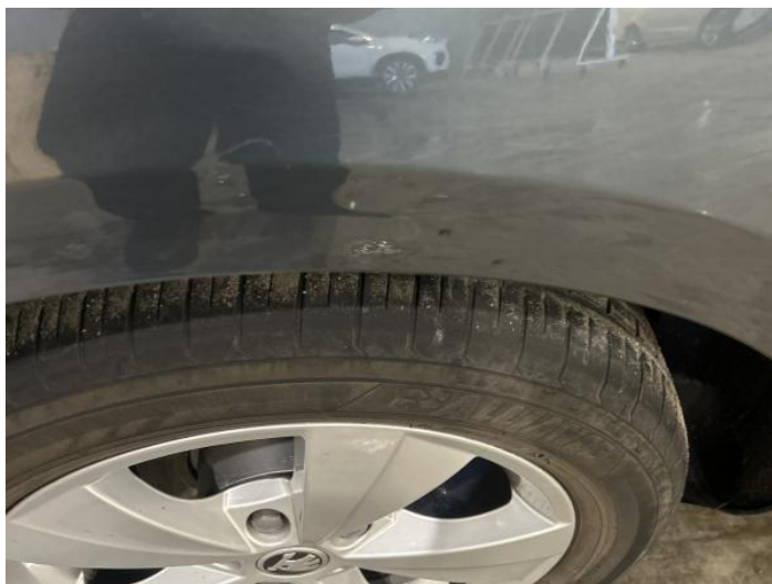
1: Qtr Panel osr Chipped 1 To 5