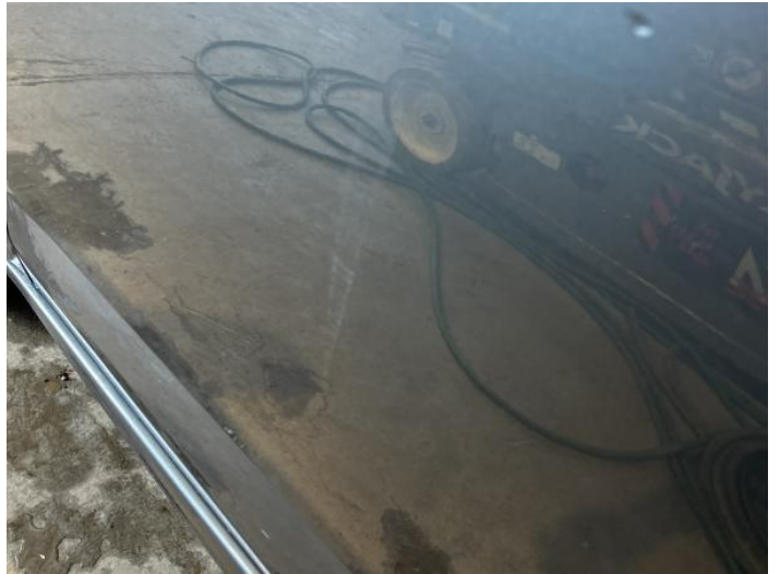
4: Door nsf Scratched Over 25mm Not Thru Paint