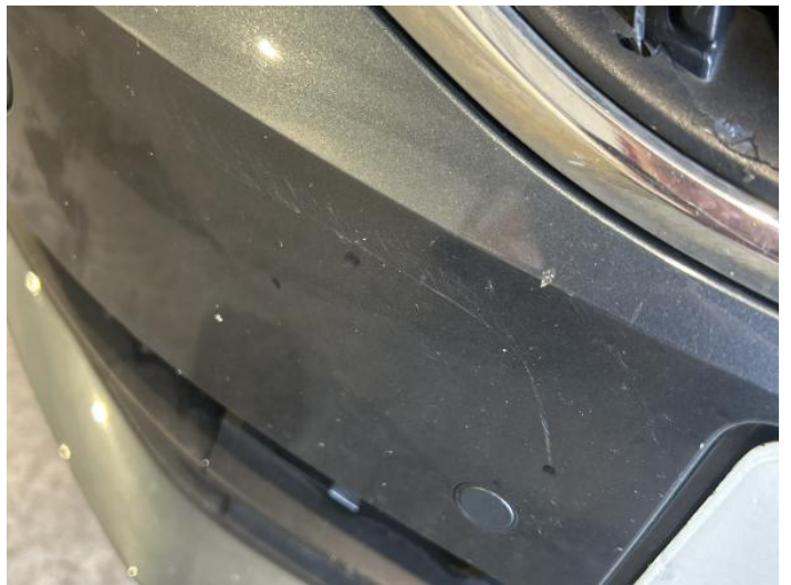
6: Bumper Front Scratched Over 25mm Not Thru Paint