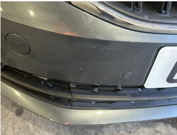
5: Bumper Front Chipped Multiple Chips