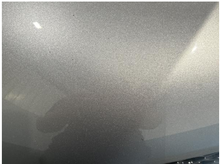
10: Bonnet Chipped 1 To 5