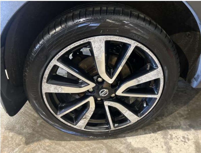
5: Wheel osr Scratched Over 50mm