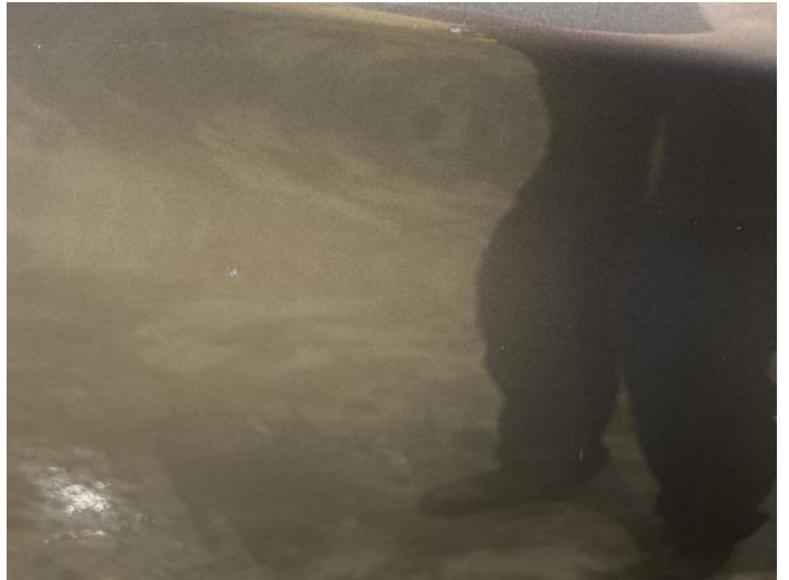
4: Door osr Chipped 1 To 5