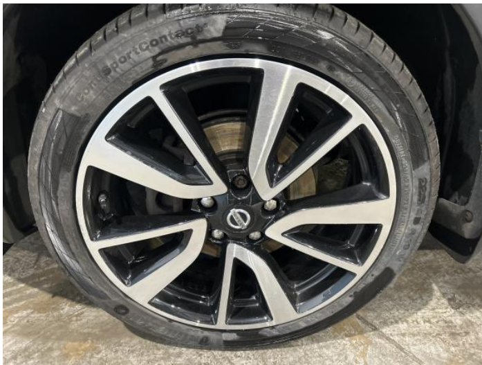
9: Wheel nsf Scratched Over 50mm