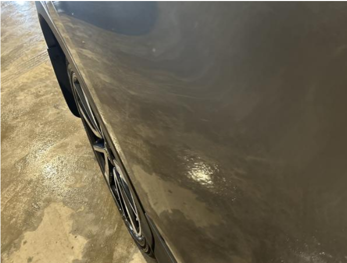
3: Door osr Dented 2 Or Less UpTo 10mm