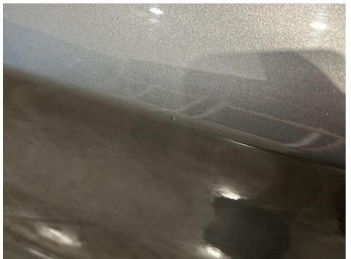
8: Door nsf Chipped 1 To 5