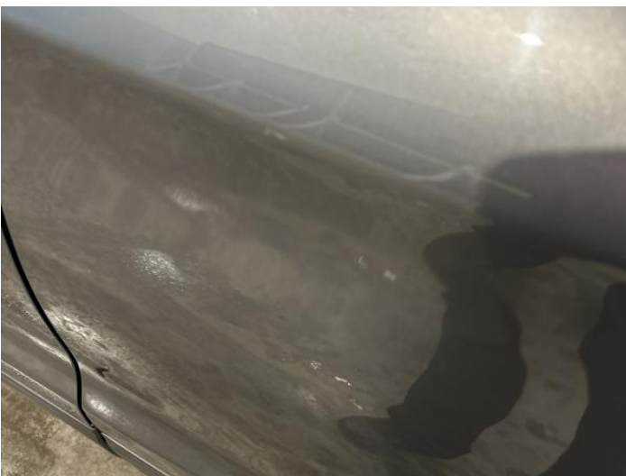
7: Door nsr Chipped 1 To 5