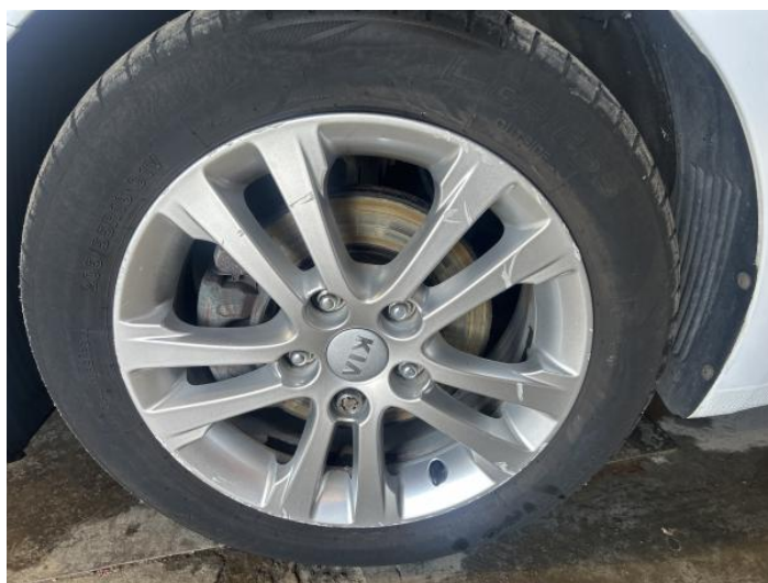
14: Wheel nsf Scratched Over 50mm