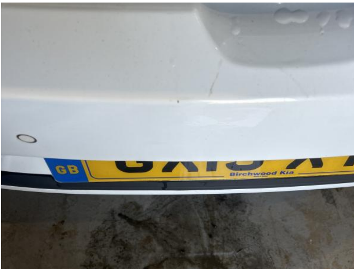
5: Bumper Rear Chipped 1 To 5