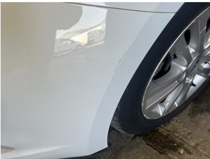
7: Bumper Front Scratched Over 25mm Not Thru Paint