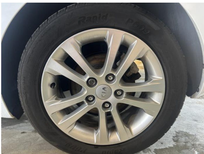
13: Wheel nsr Scratched Up To 50mm