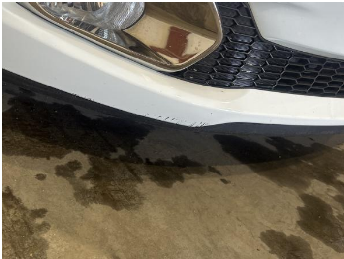
15: Bumper Front Scratched 25 to 100mm Thru Paint