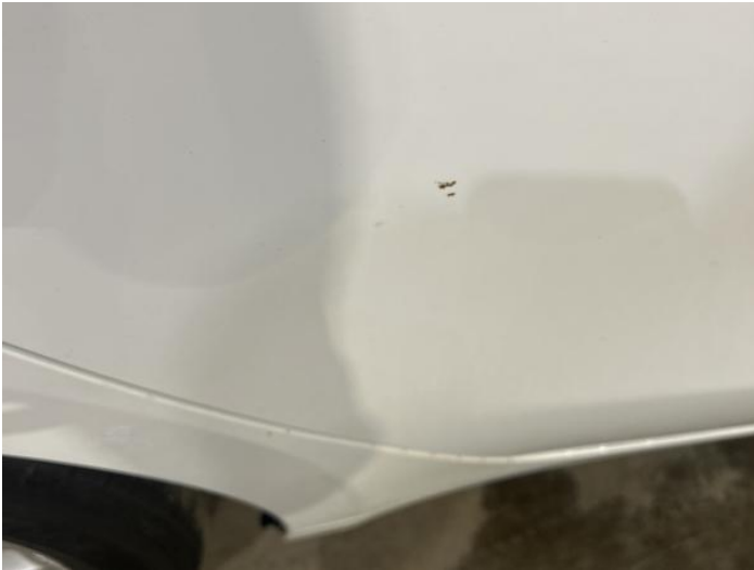
3: Door osr Chipped 1 To 5