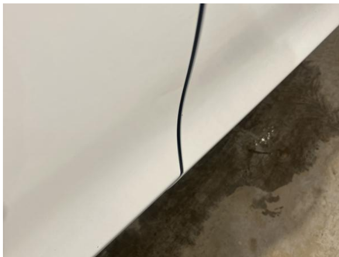
2: Door osr Dented Between 10mm + 30mm