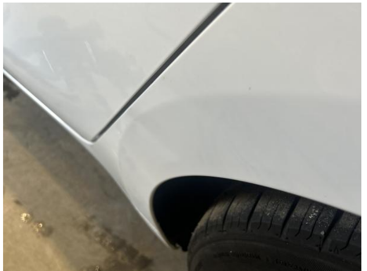
6: Qtr Panel nsr Dented Over 30mm