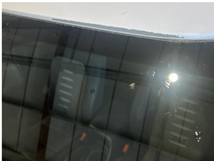
10: Roof Poor Previous Repair Paint Flake