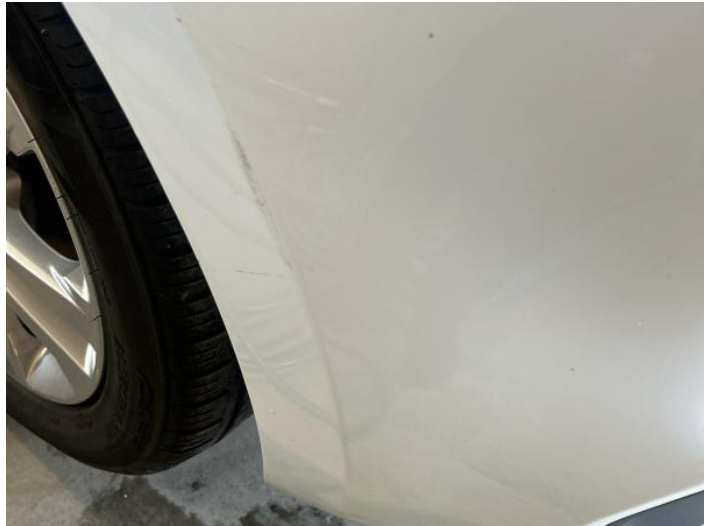
4: Bumper Rear Scratched 25 to 100mm Thru Paint