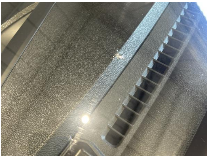
9: Screen Front Chipped UpTo 10mm