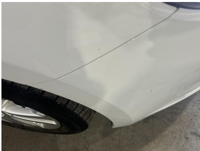
1: Wing osf Chipped 1 To 5