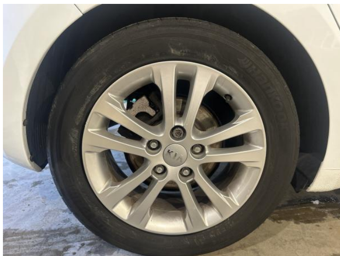
12: Wheel osr Scratched Over 50mm