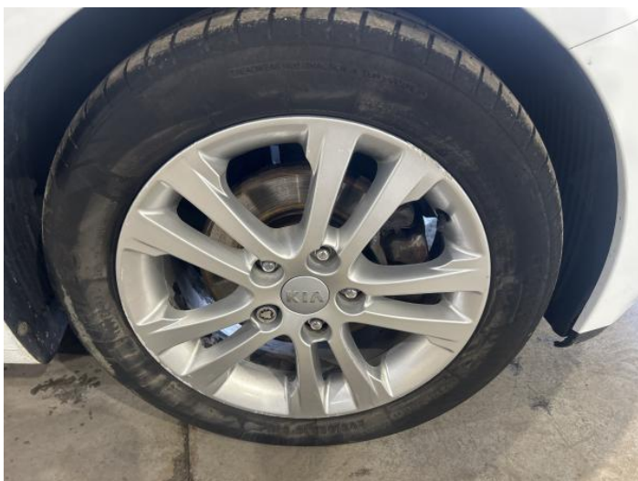
11: Wheel osf Scratched Over 50mm