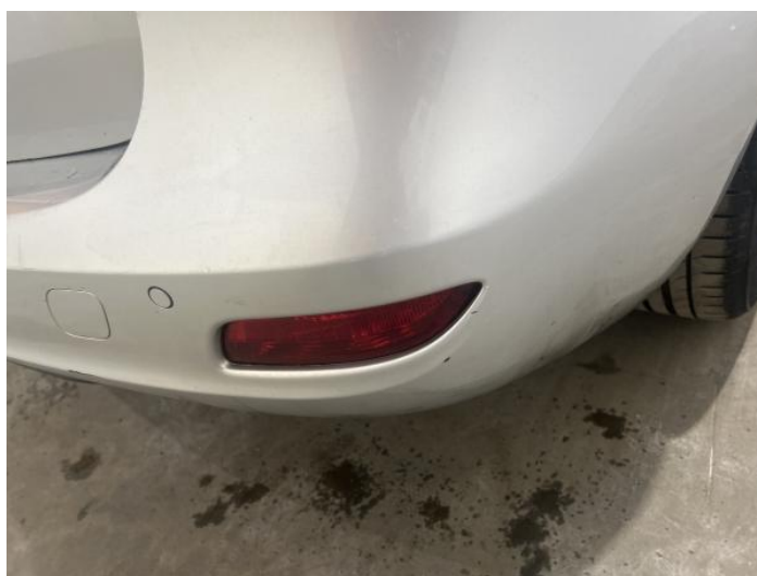
6: Bumper Rear Chipped 1 To 5