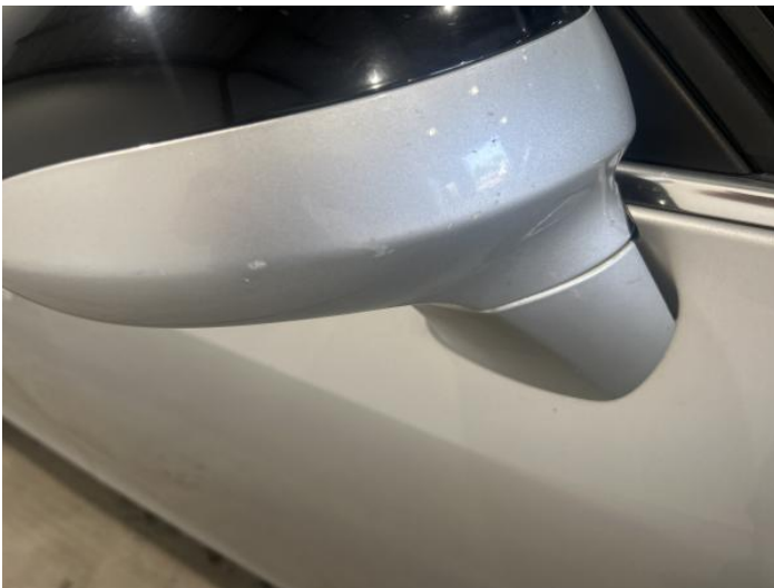
1: Door Mirror Assy osf Scratched (Painted) UpTo 25mm Thru Paint