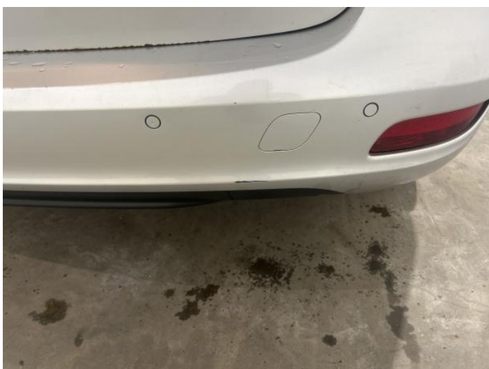
5: Bumper Rear Scratched 25 to 100mm Thru Paint