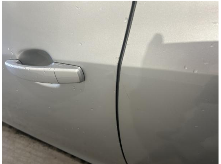
10: Door nsf Poor Previous Repair Poor Paint