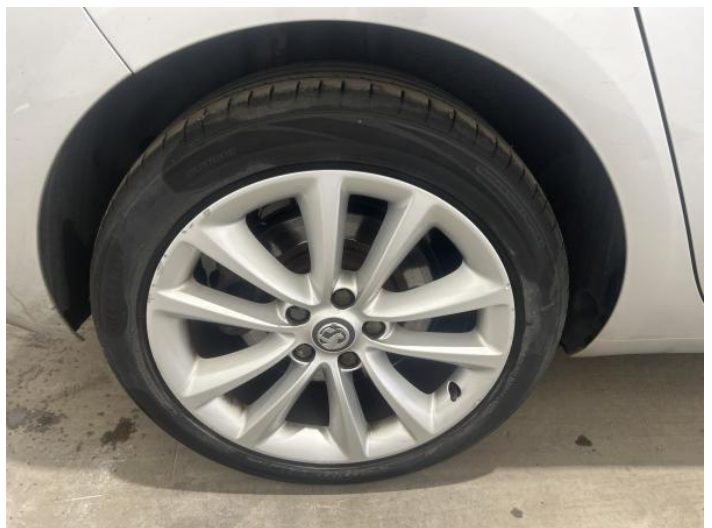
14: Wheel osr Scratched Over 50mm