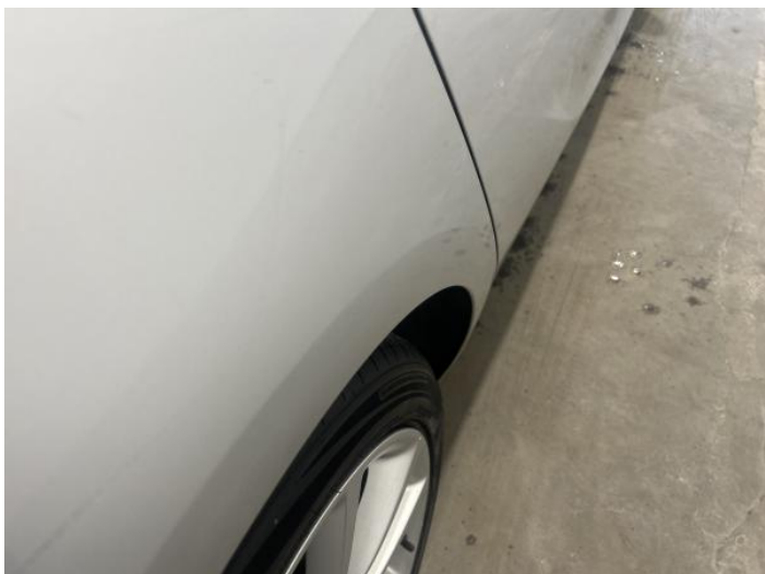
3: Qtr Panel osr Dented 2 Or Less UpTo 10mm