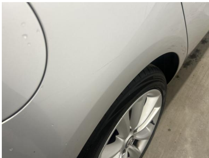
4: Qtr Panel osr Scratched Over 25mm Not Thru Paint