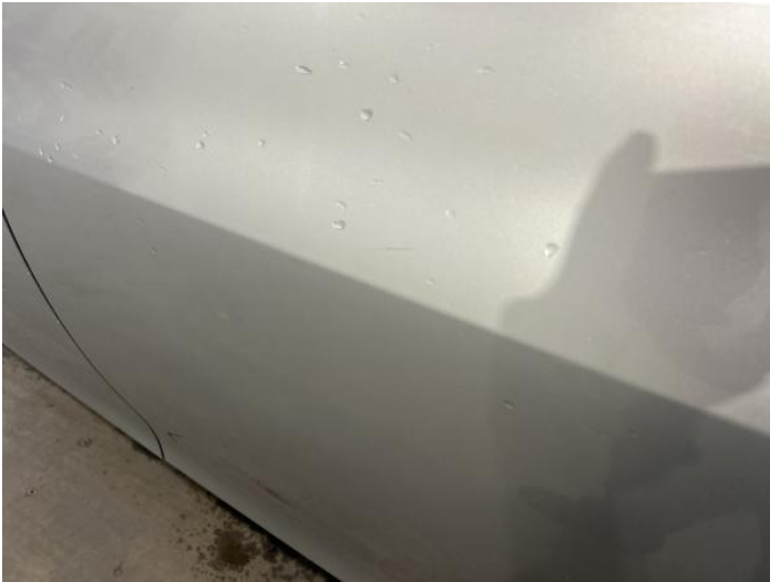
9: Door nsr Scratched UpTo 25mm Thru Paint