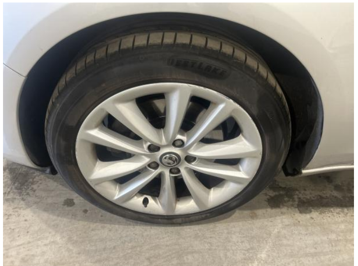
16: Wheel nsf Scratched Over 50mm