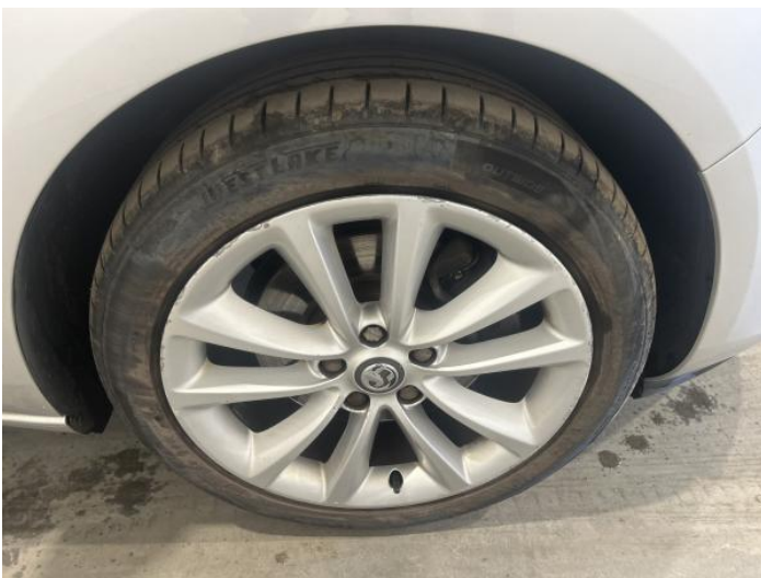
13: Wheel osf Scratched Over 50mm