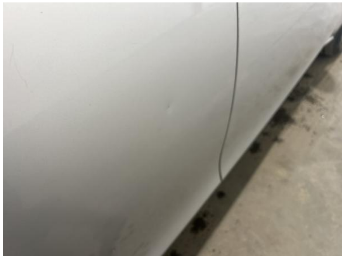
2: Door osr Dented 2 Or Less UpTo 10mm