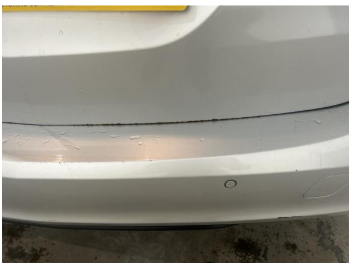
7: Tailgate Rusted Over 5mm