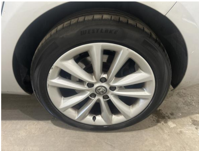
15: Wheel nsr Scratched Over 50mm