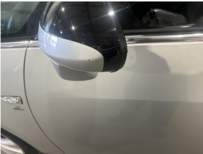
11: Door Mirror Assy nsf Scratched (Painted) UpTo 25mm Thru Paint