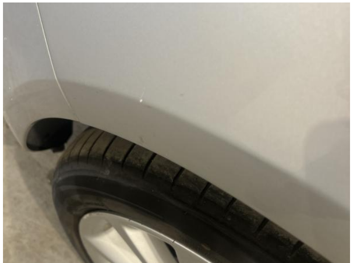
12: Wing nsf Chipped 1 To 5