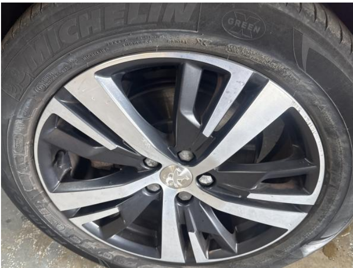
5: Wheel nsf Corroded Light