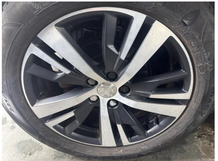
12: Wheel osr Corroded Light