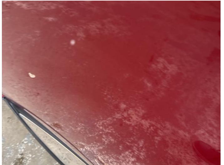
4: Door nsf Chipped 1 To 5