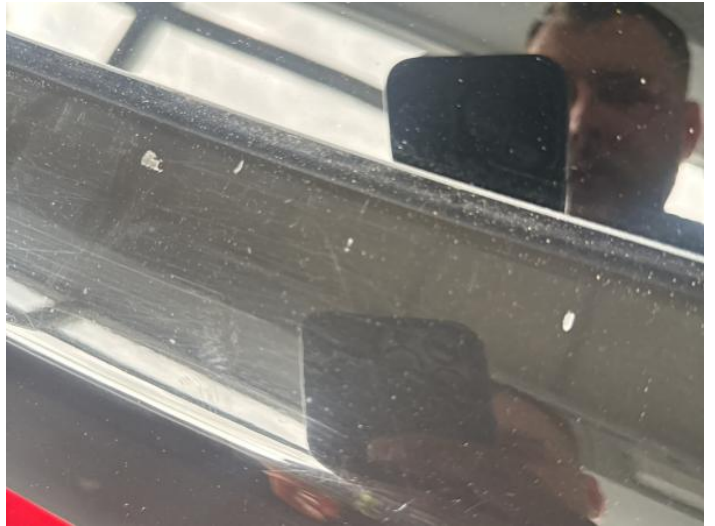
10: Boot Lid Chipped 1 To 5