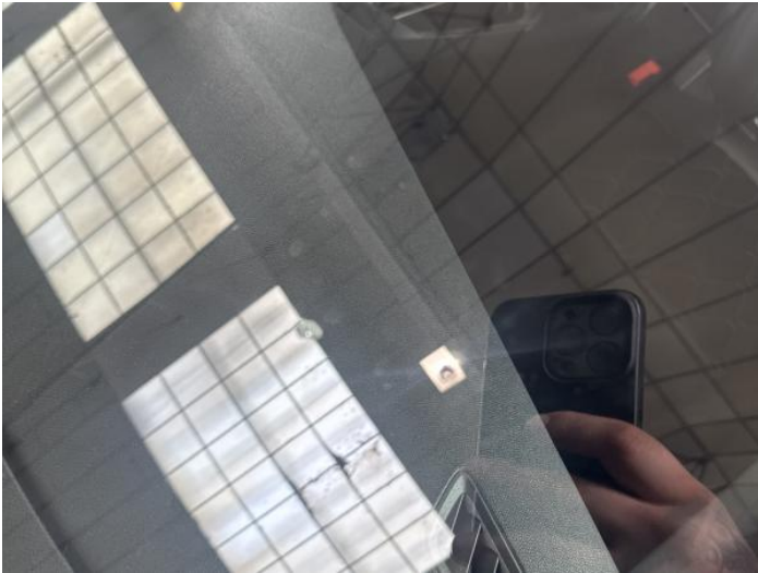
3: Screen Front Chipped UpTo 10mm