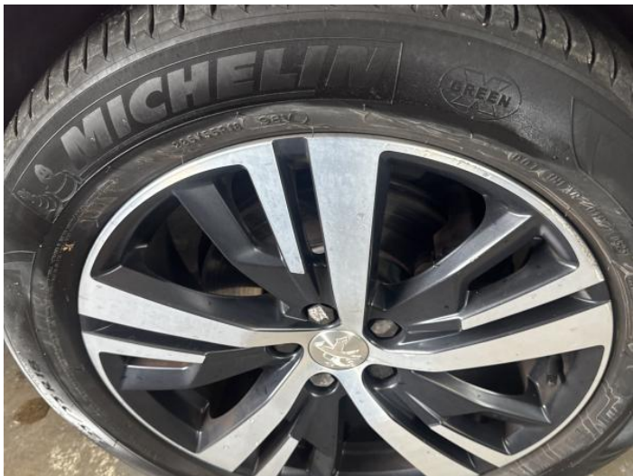
15: Wheel of Corroded Light