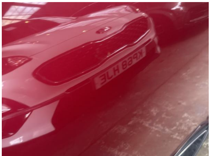
14: Door osf Chipped 1 To 5