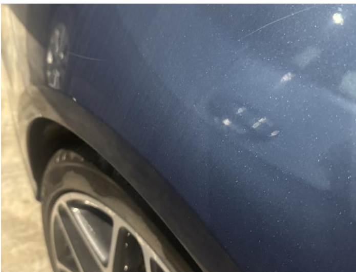
7: Qtr Panel osr Scratched Over 25mm Thru Paint