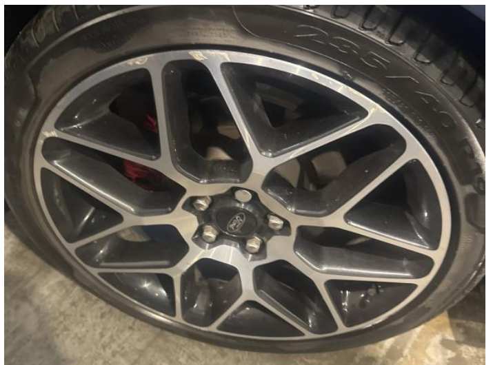
8: Wheel osr Scratched Up To 50mm