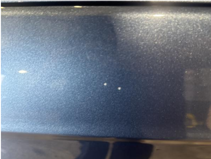
16: Wing nsf Chipped 1 To 5