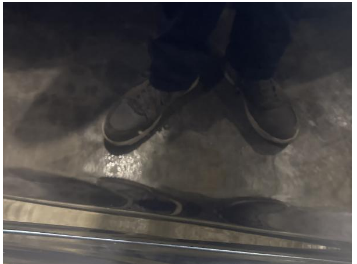
6: Door osr Chipped 1 To 5