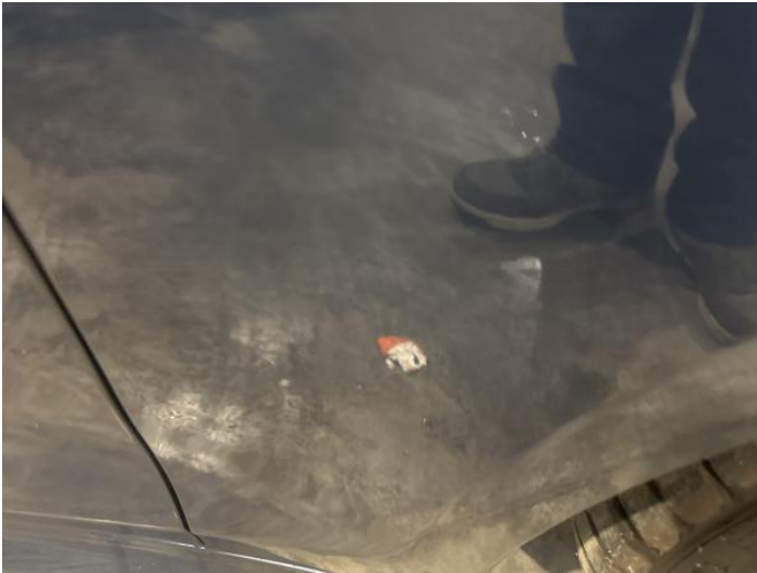
3: Wing osf Chipped 1 To 5