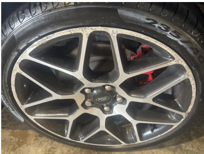
13: Wheel nsr Scratched Over 50mm