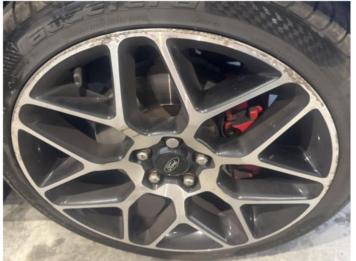
4: Wheel osf Scratched Over 50mm