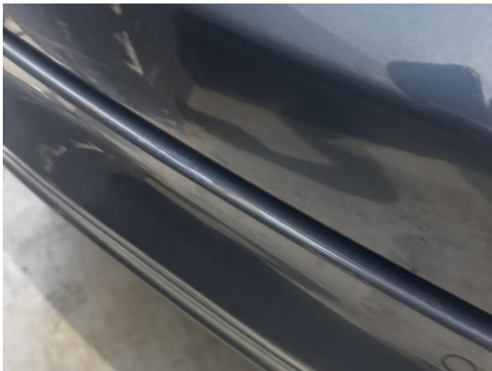
9: Bumper Rear Scratched 25 to 100mm Thru Paint