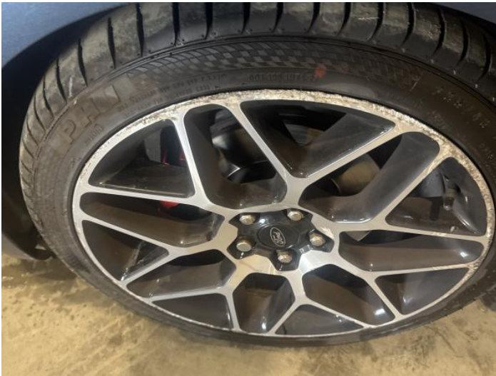
17: Wheel nsf Scratched Over 50mm