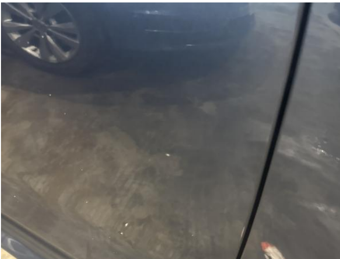
5: Door osf Dented With Paint Damage