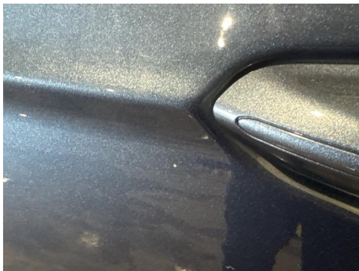
14: Door nsf Chipped 1 To 5