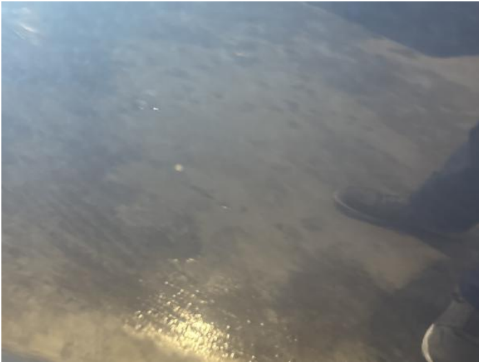
15: Door nsf Chipped 1 To 5