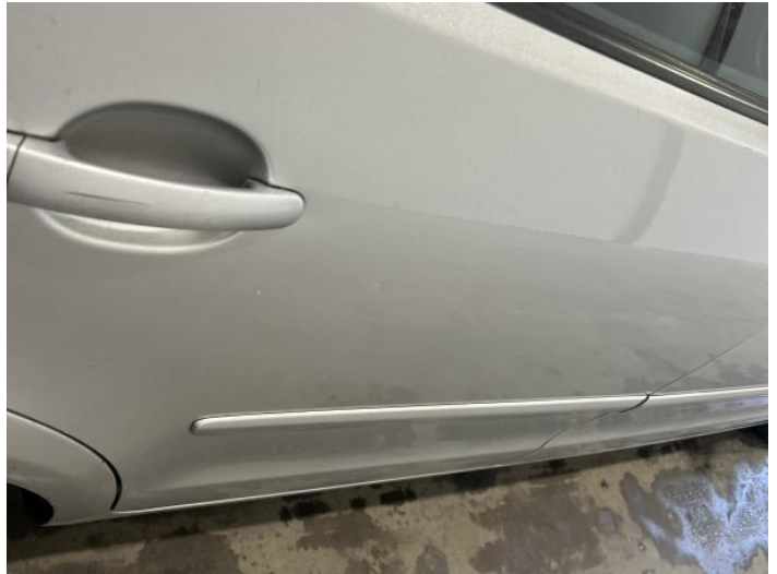
4: Door osr Scratched Over 25mm Not Thru Paint