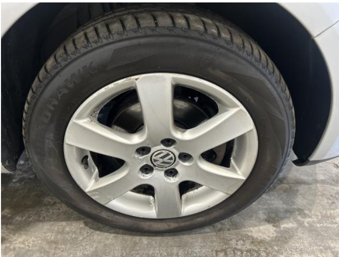
1: Wheel osf Scratched Over 50mm