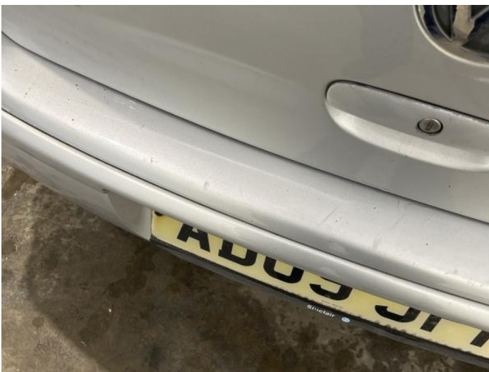
7: Bumper Rear Scratched Over 25mm Not Thru Paint