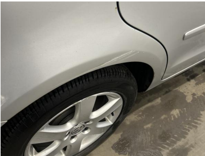
5: Qtr Panel osr Scratched Over 25mm Thru Paint