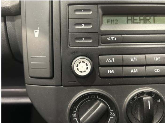
16: Other N/A N/A