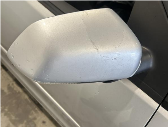
3: Door Mirror Assy osf Scratched (Painted) Over 25mm Thru Paint