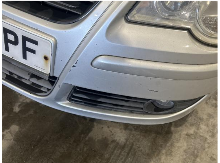
10: Bumper Front Scratched Over 100mm Thru Paint