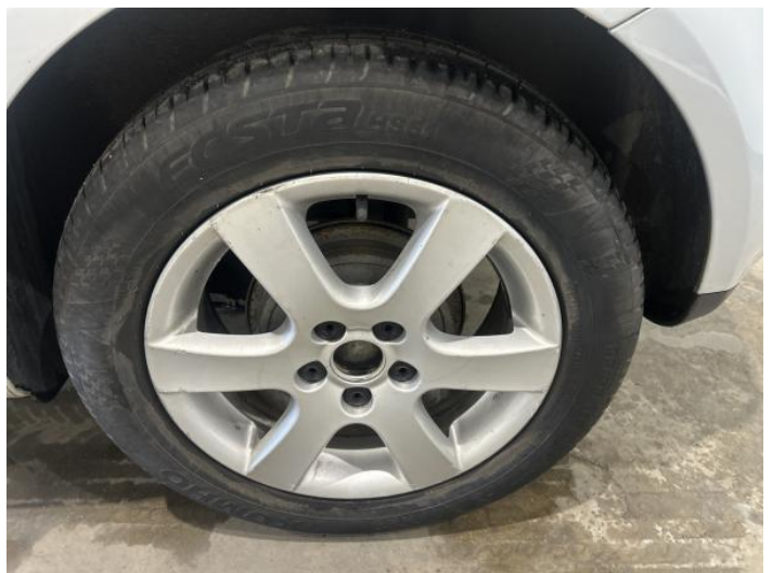
14: Wheel nsr Scratched Over 50mm