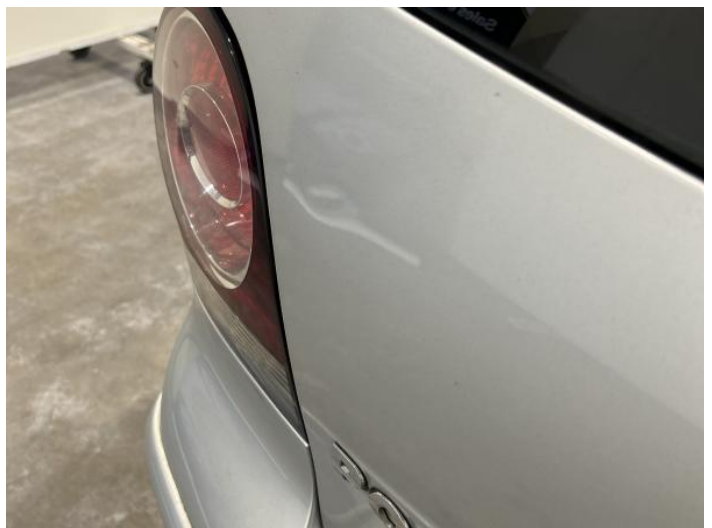
8: Tailgate Dented Between 10mm + 30mm