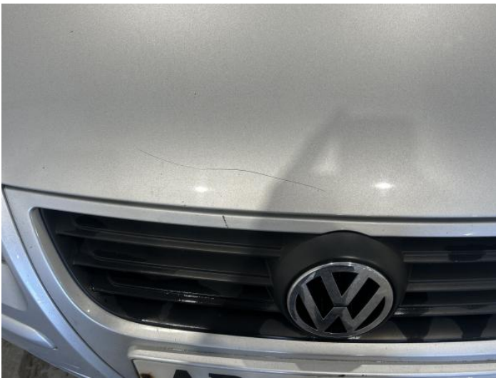
11: Bonnet Scratched Over 25mm Thru Paint