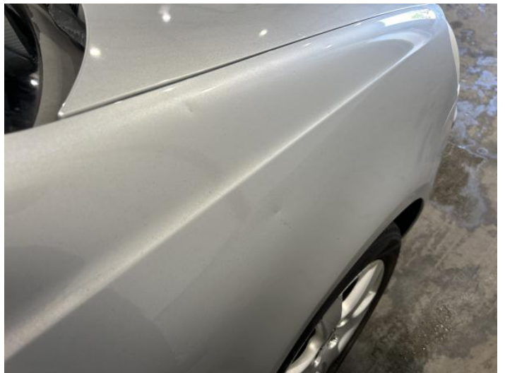
2: Wing osf Dented Over 2 UpTo 10mm