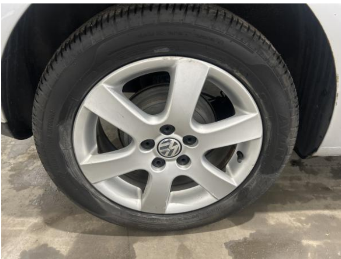
13: Wheel osr Scratched Over 50mm