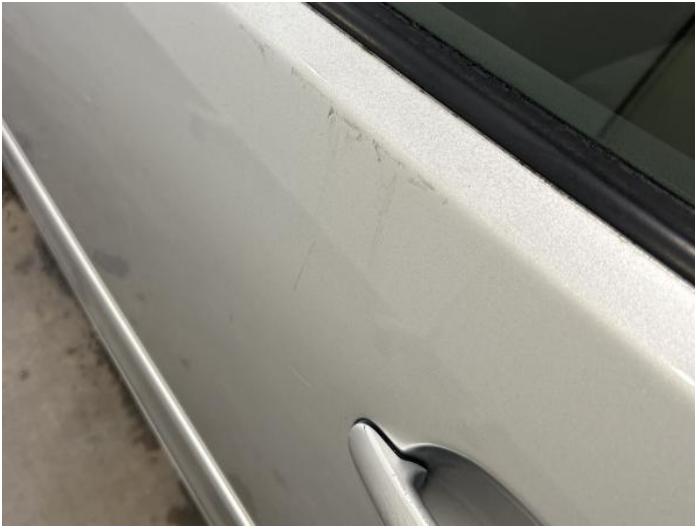
9: Door nsr Scratched Over 25mm Not Thru Paint