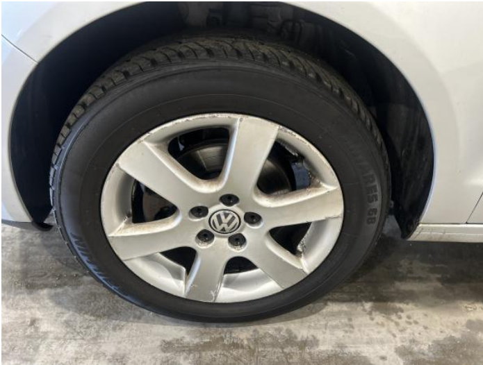
15: Wheel nsf Scratched Over 50mm