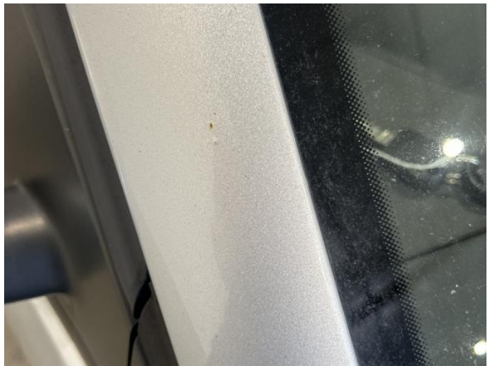
12: A Post os Chipped 1 To 5