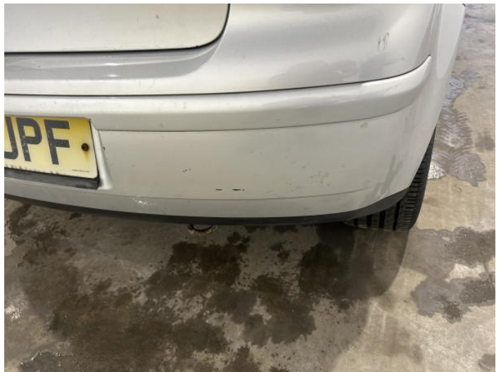
6: Bumper Rear Scratched 25 to 100mm Thru Paint