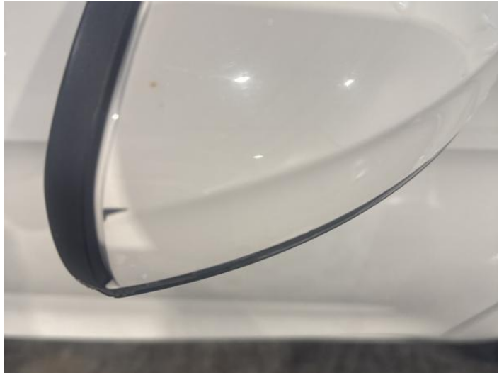
4: Door Mirror Assy osf Scratched (Painted) UpTo 25mm Thru Paint