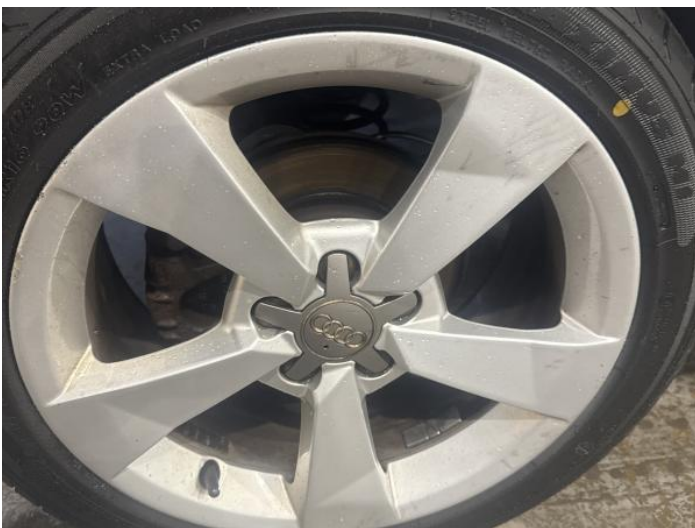
7: Wheel osr Scratched Over 50mm