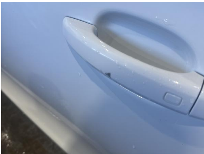
13: Door nsf Chipped 1 To 5