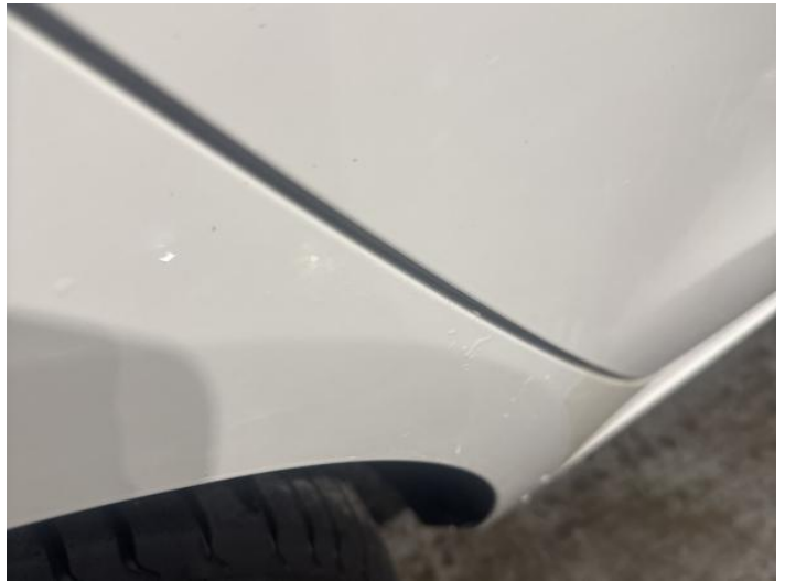
6: Qtr Panel osr Dented 2 Or Less UpTo 10mm