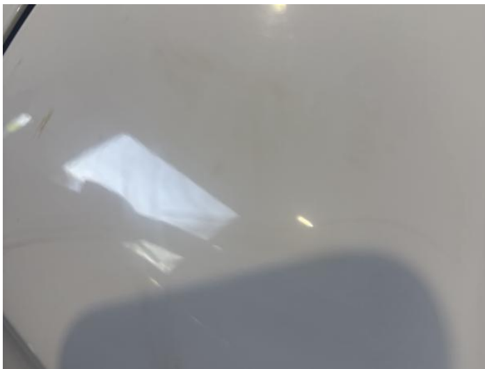
11: Door nsr Scratched Over 25mm Not Thru Paint