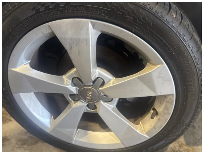
12: Wheel nsr Scratched Up To 50mm