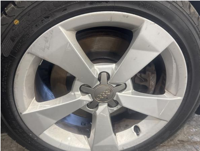
3: Wheel osf Scratched Over 50mm