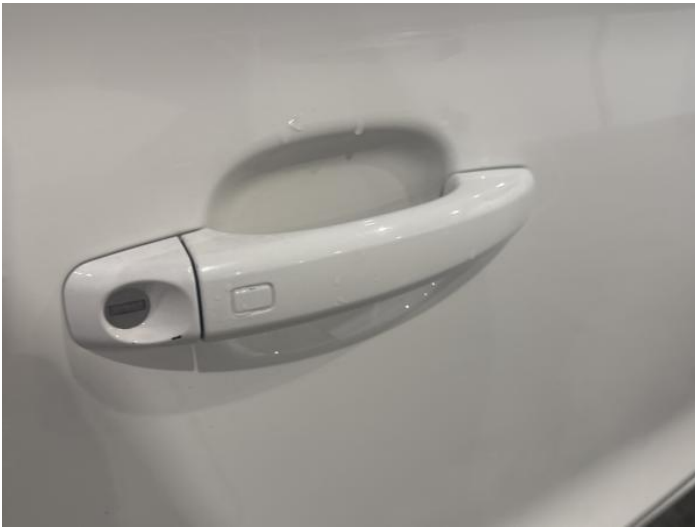
5: Door osf Chipped 1 To 5