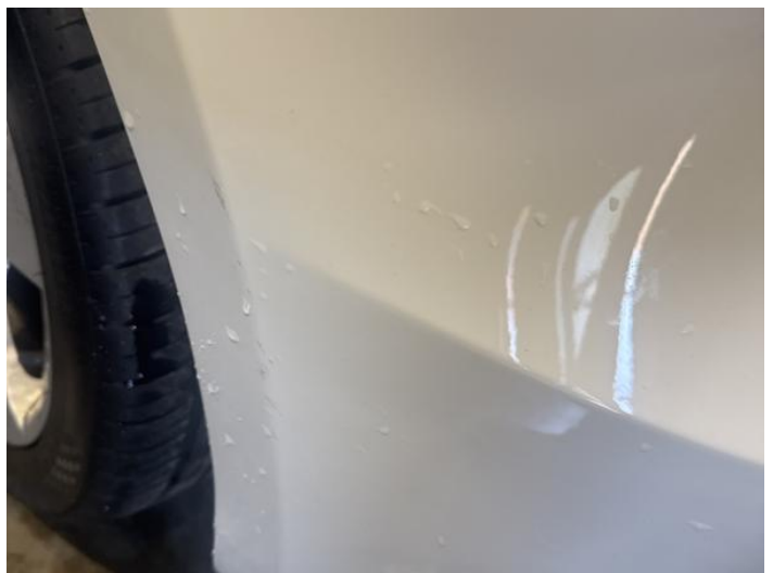
8: Bumper Rear Scratched 25 to 100mm Thru Paint