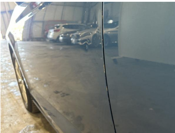
13: Door nsf Chipped Edge Chip