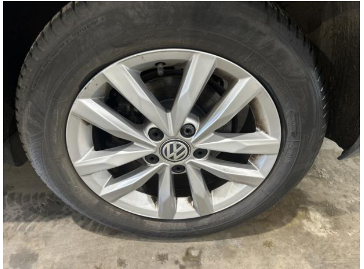
10: Wheel nsr Scratched Up To 50mm