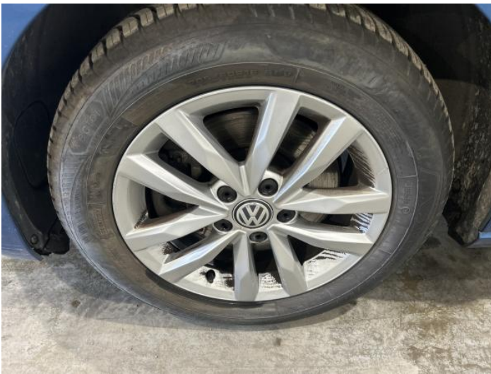
17: Wheel nsf Scratched Up To 50mm