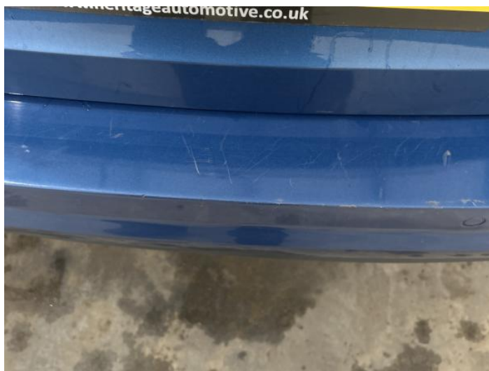
8: Bumper Rear Scratched Over 25mm Not Thru Paint