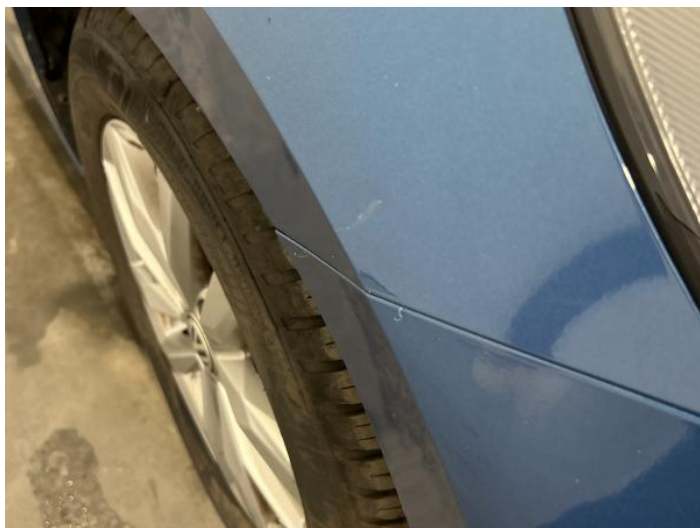
1: Wing osf Dented Between 10mm + 30mm