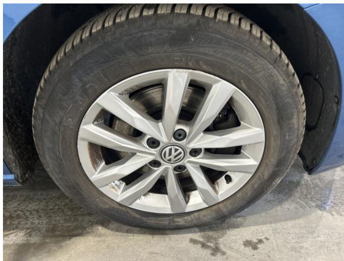
2: Wheel osf Scratched Over 50mm