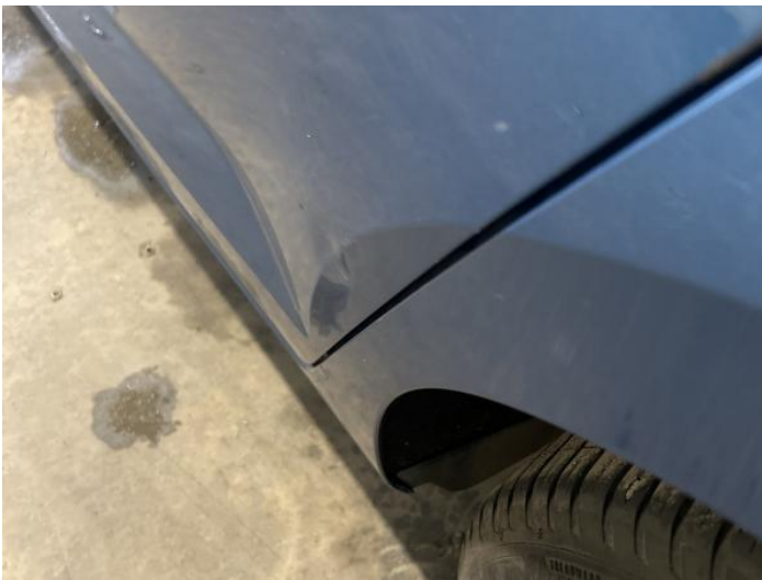
11: Door nsr Dented Over 30mm