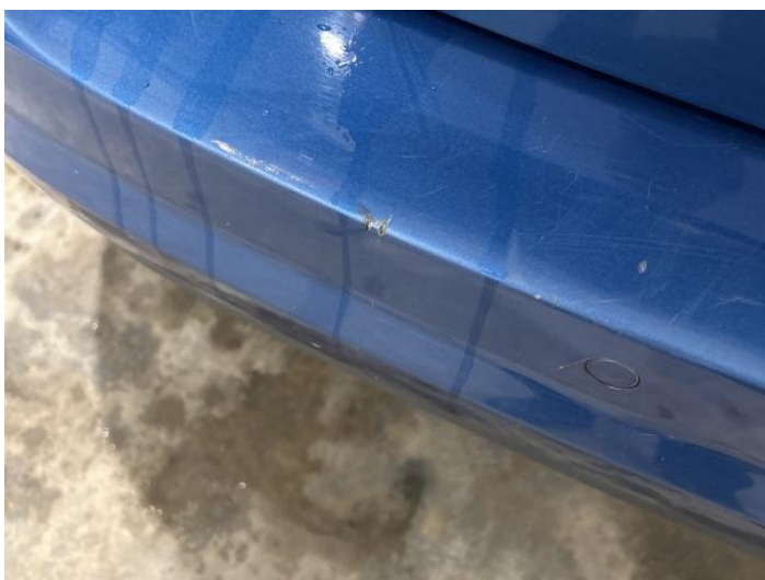
7: Bumper Rear Chipped Multiple Chips