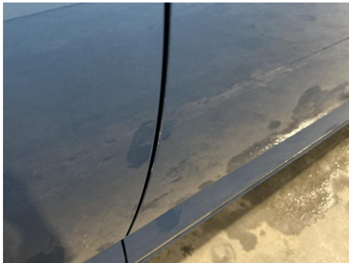
4: Door osf Chipped Edge Chip