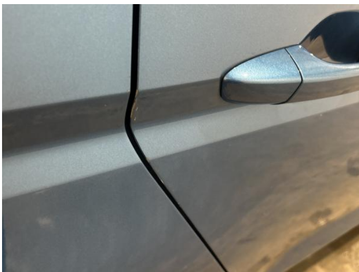
5: Door osr Chipped Edge Chip