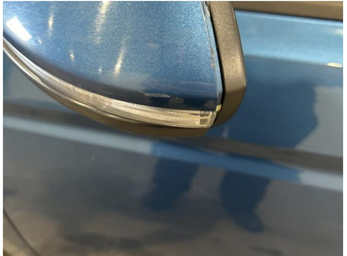
16: Door Mirror Assy nsf Scratched (Painted) UpTo 25mm Thru Paint