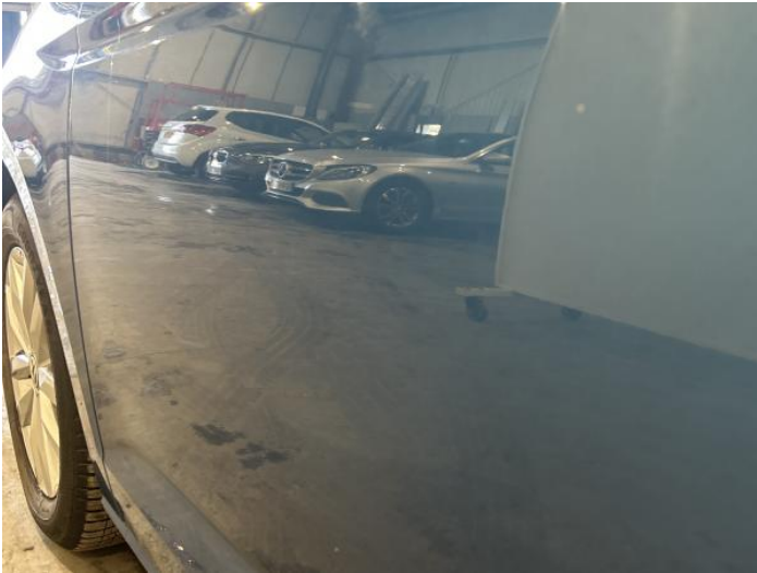
15: Door nsf Scratched Over 25mm Not Thru Paint