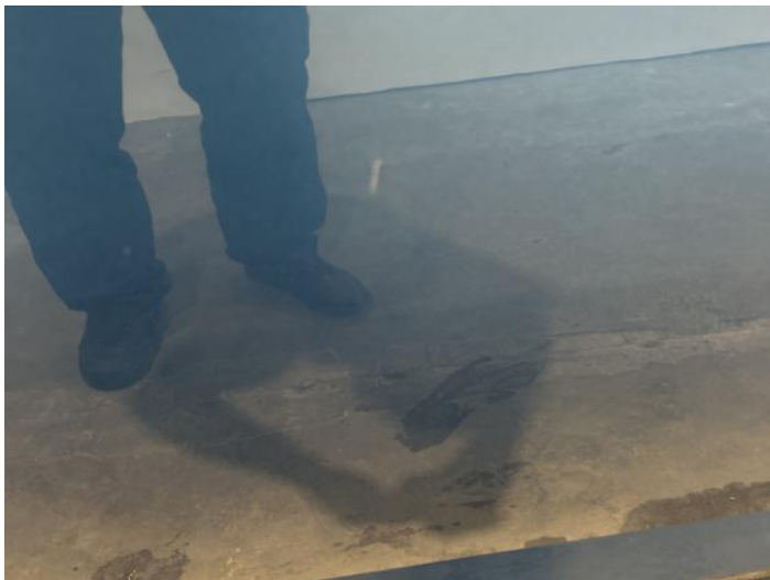
3: Door osf Scratched Up To 25mm Thru Paint