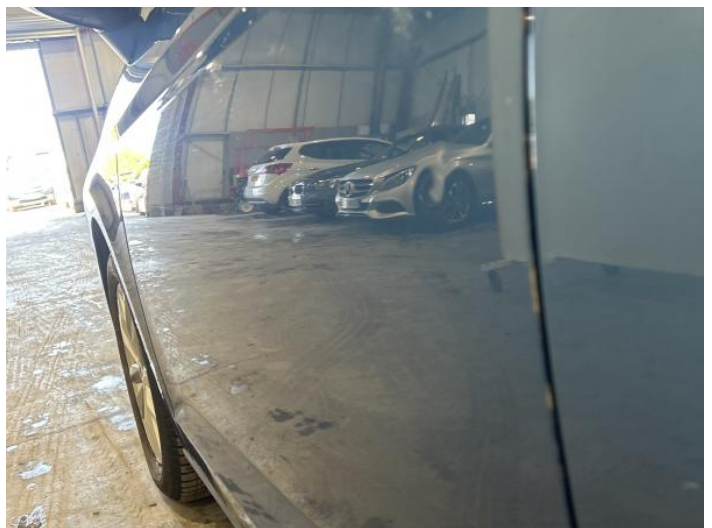
14: Door nsf Dented 2 Or Less Up To 10mm