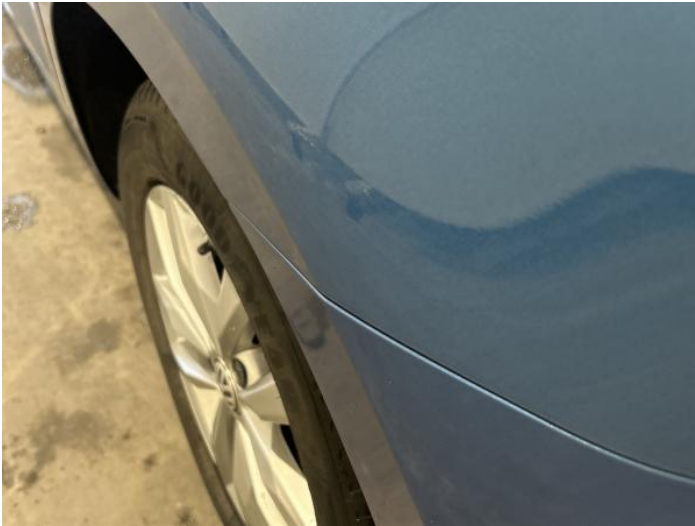
9: Qtr Panel nsr Scratched Over 25mm Not Thru Paint