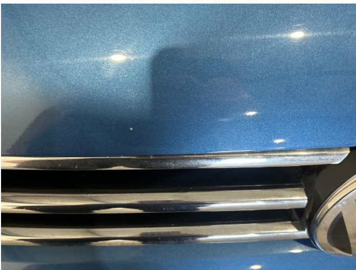
19: Bonnet Chipped 1 To 5