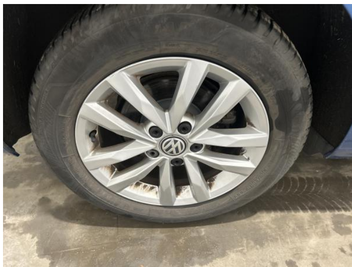
6: Wheel osr Scratched Up To 50mm