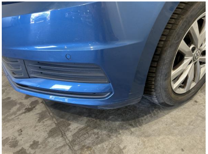
18: Bumper Front Scratched Over 100mm Thru Paint