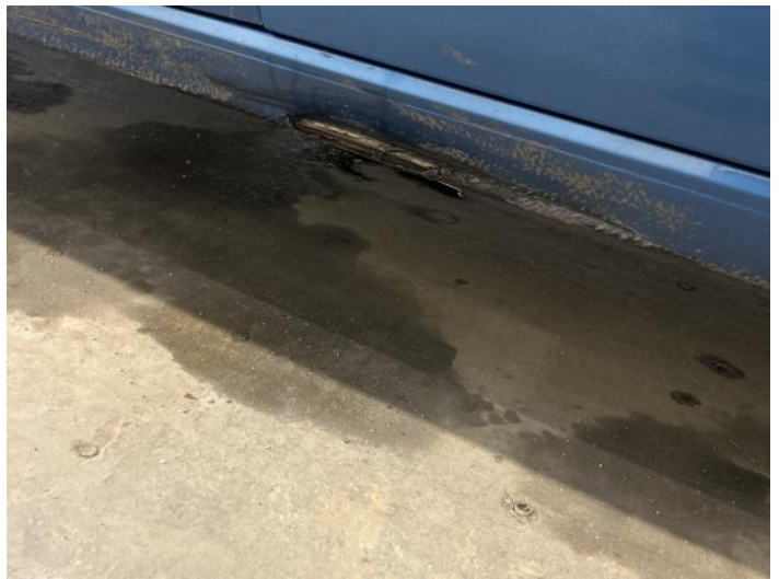
12: Sill ns Hole Over 10mm