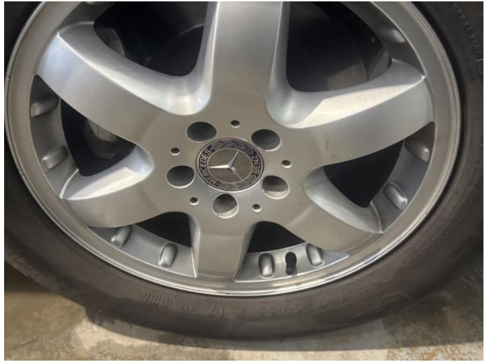
10: Wheel nsf Scratched Over 50mm