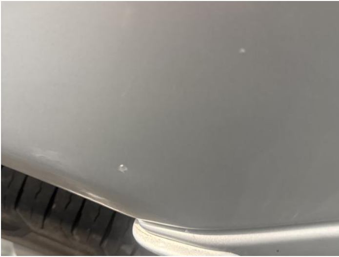
9: Qtr Panel nsr Chipped 1 To 5