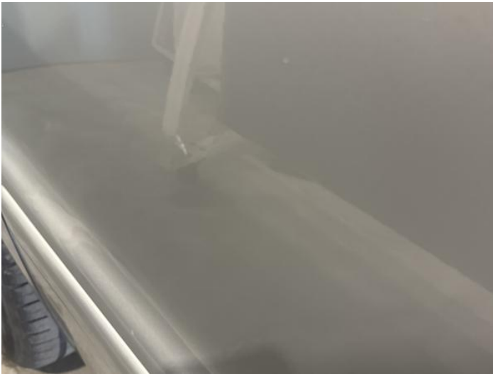
5: Door osr Chipped 1 To 5