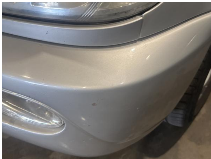
2: Bumper Front Poor Previous Repair Paint Flake