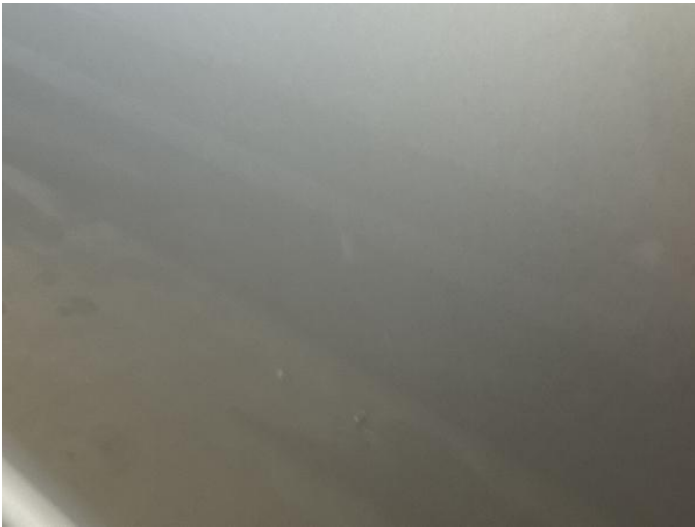
11: Door nsr Chipped 1 To 5