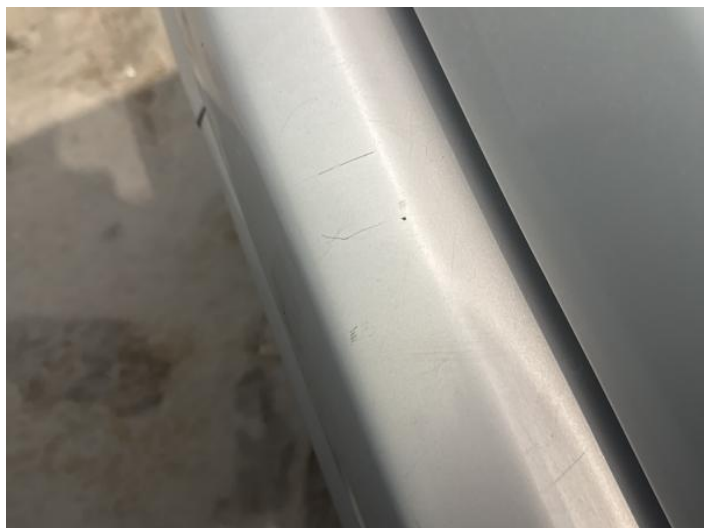
8: Bumper Rear Poor Previous Repair Poor Paint