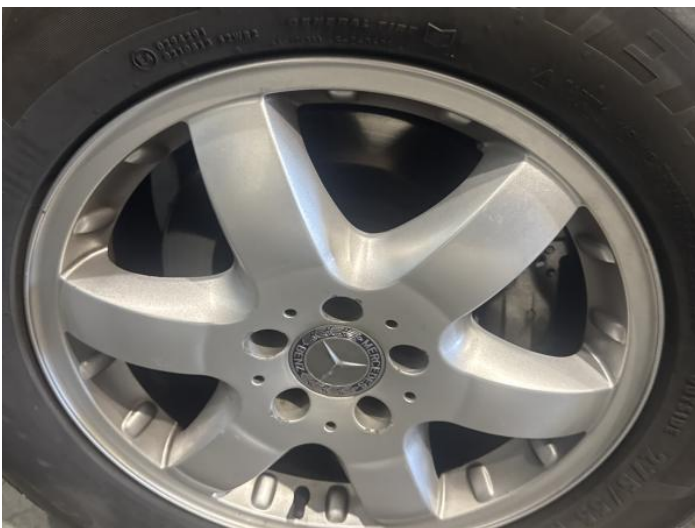
7: Wheel osr Scratched Over 50mm