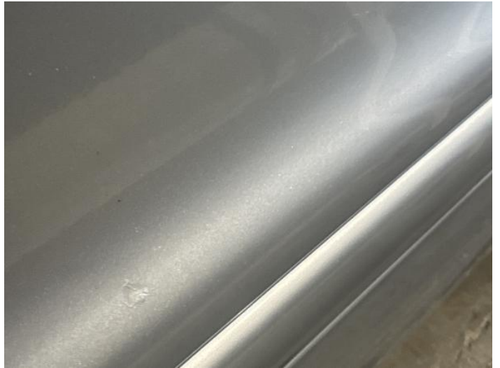
4: Door osf Chipped 1 To 5