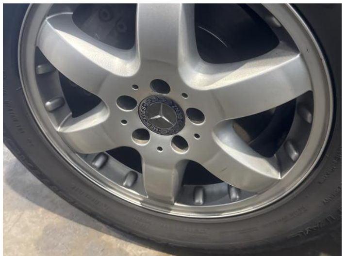
14: Wheel nsf Scratched Over 50mm