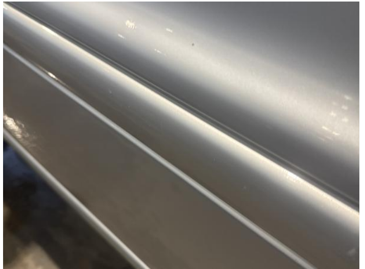
12: Door nsf Chipped 1 To 5