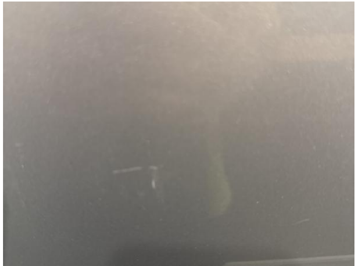
6: Qtr Panel osr Scratched UpTo 25mm Thru Paint