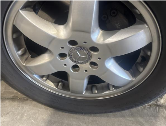
3: Wheel osf Scratched Over 50mm