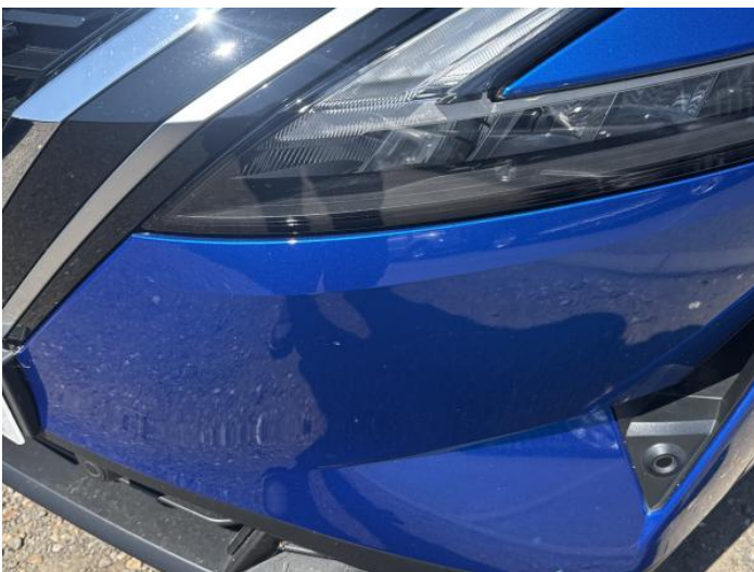
7: Bumper Front Chipped Multiple Chips