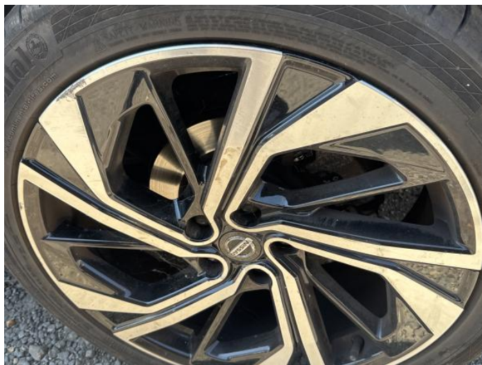
2: Wheel nsr Scratched Over 50mm