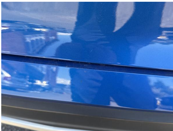
1: Bumper Rear Scratched 25 to 100mm Thru Paint