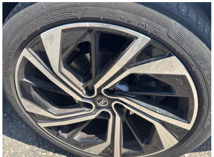
8: Wheel osf Scratched Up To 50mm