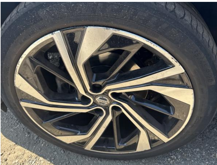
5: Wheel nsf Scratched Over 50mm