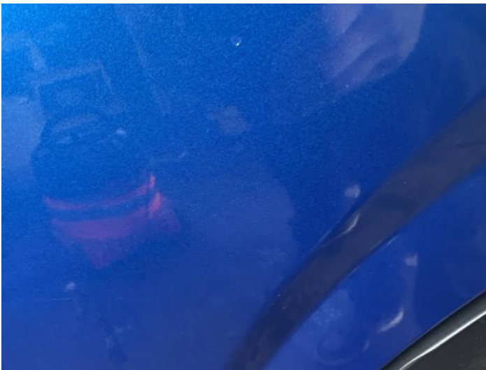
11: Door nsr Scratched Over 25mm Thru Paint