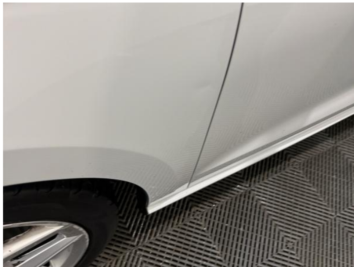
4: Wing nsf Dented Between 10mm + 30mm