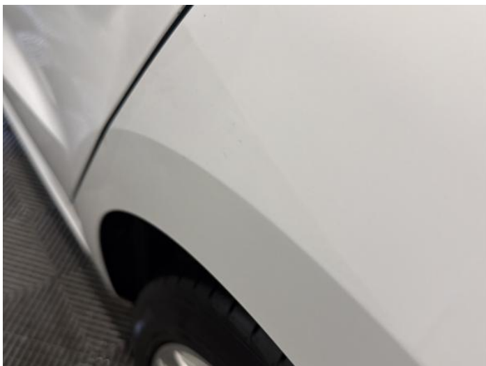
9: Qtr Panel nsr Dented Between 10mm + 30mm