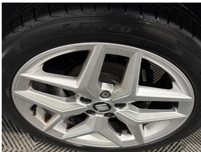
8: Wheel nsr Scratched Up To 50mm