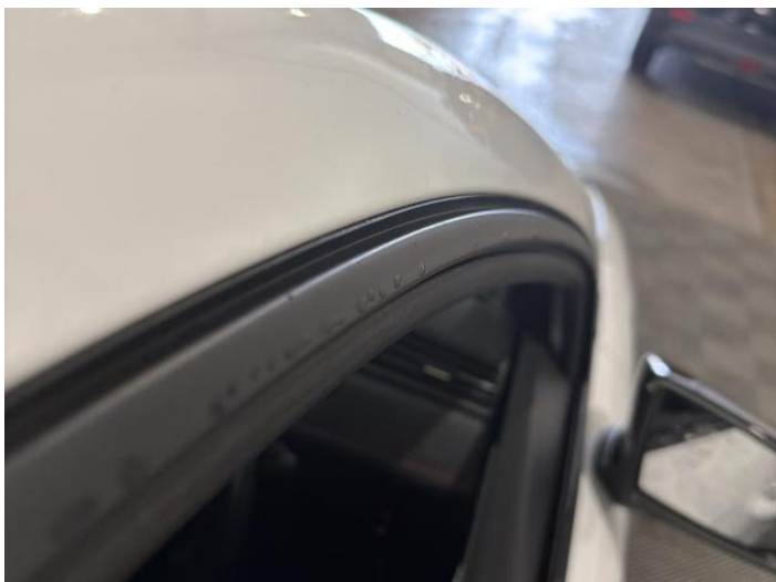
15: A Post os Dented Over 30mm