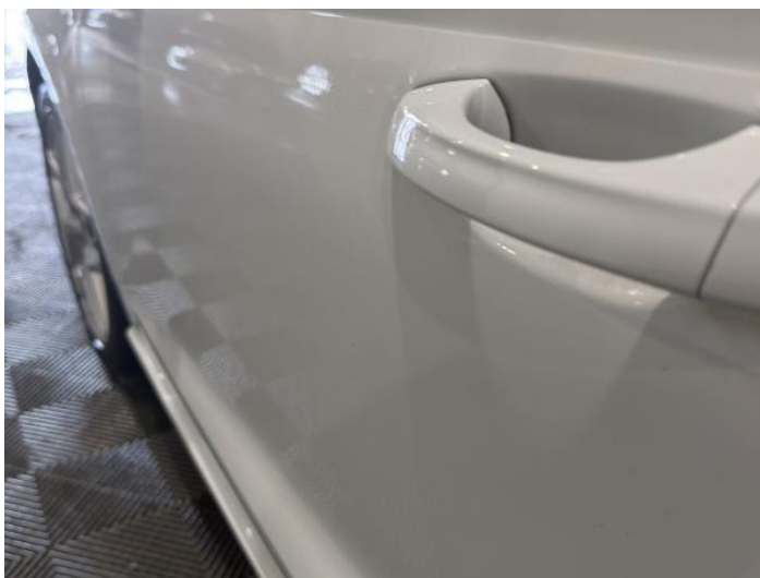
5: Door nsf Dented Over 2 UpTo 10mm