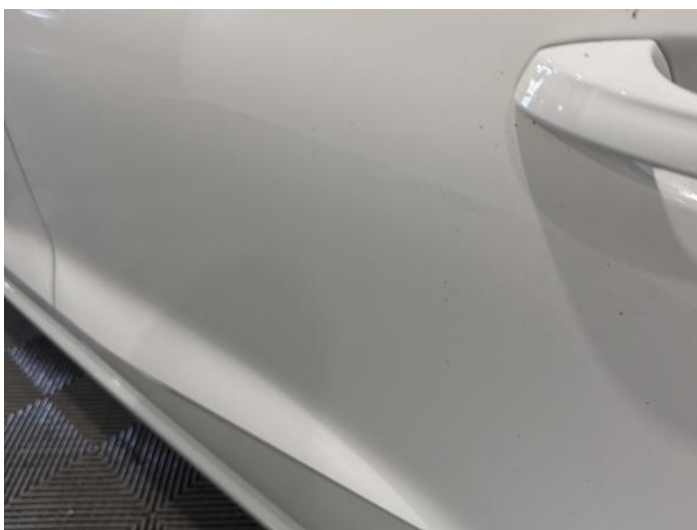
7: Door nsr Chipped 1 To 5