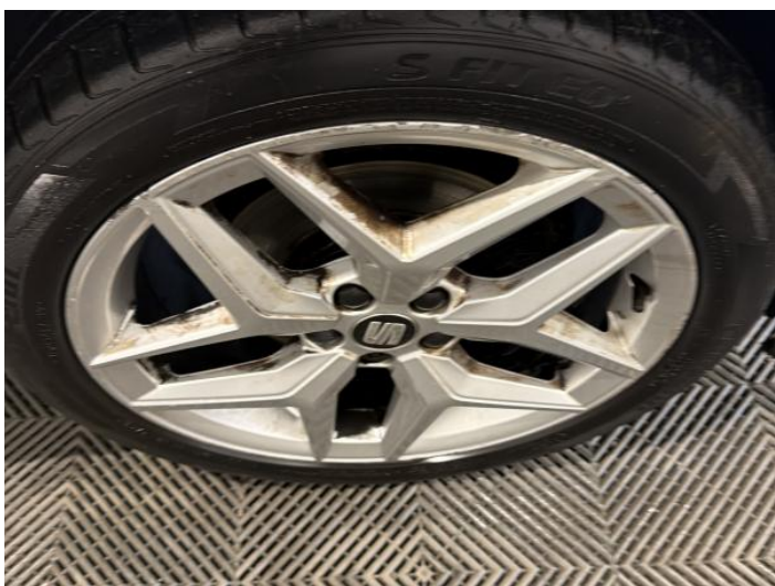
19: Wheel osf Scratched Over 50mm