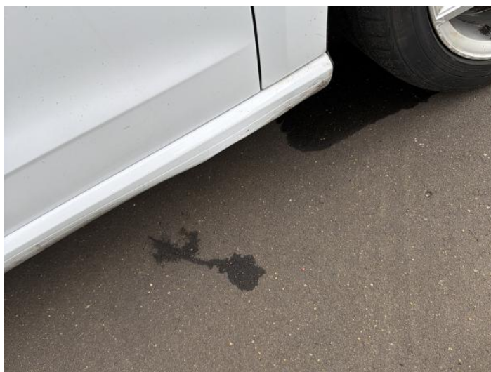
20: Sill os Dented Over 30mm