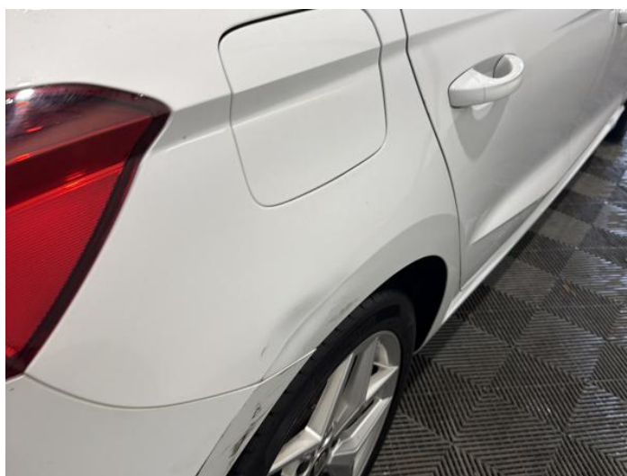
12: Qtr Panel osr Dented With Paint Damage