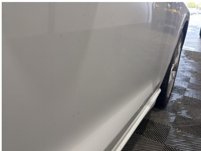
16: Door osf Dented Over 2 UpTo 10mm