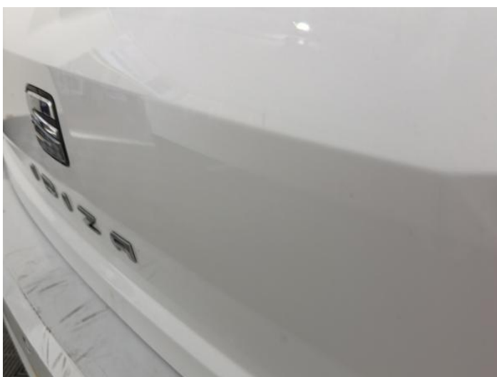
11: Boot Lid Dented Over 2 UpTo 10mm