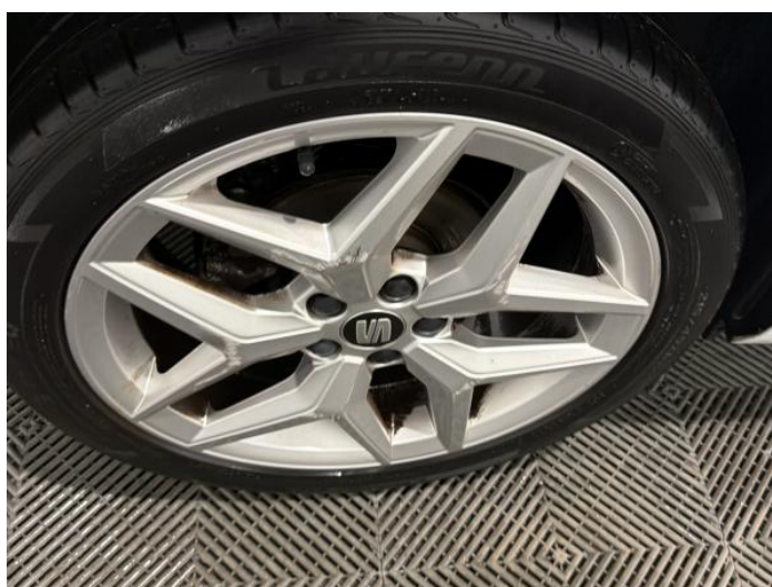
14: Wheel osr Scratched Over 50mm