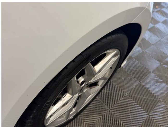
18: Wing osf Chipped 1 To 5