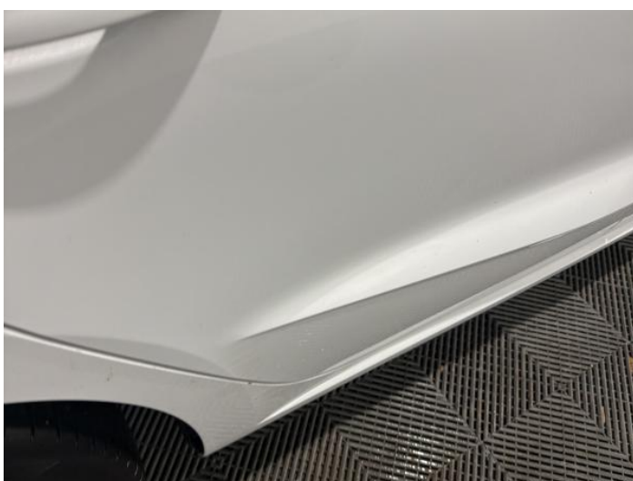
13: Qtr Panel osr Dented With Paint Damage