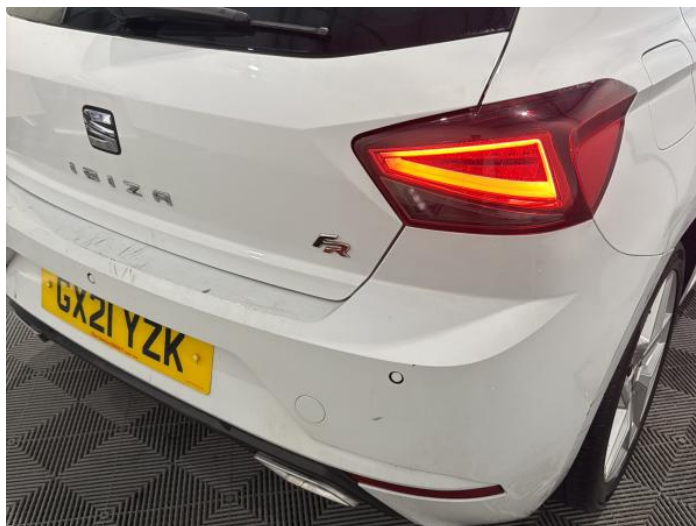
10: Bumper Rear Scratched Over 100mm Thru Paint