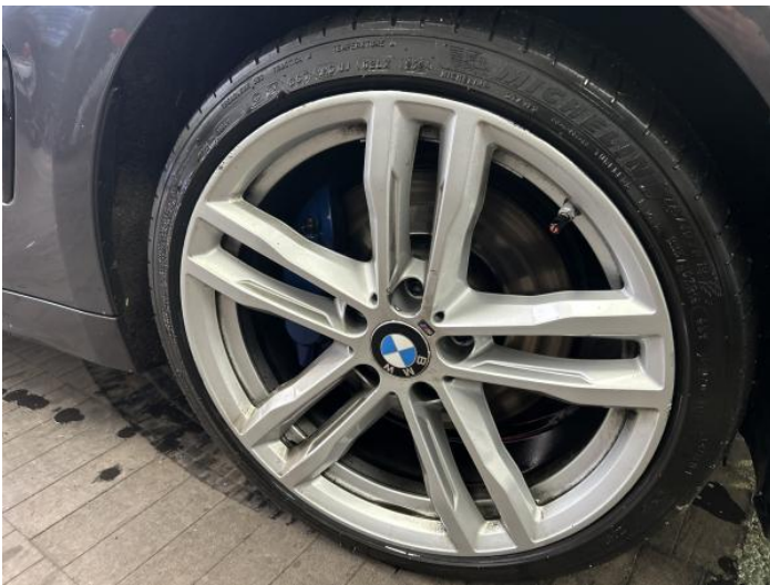
1: Wheel osf Scratched Over 50mm