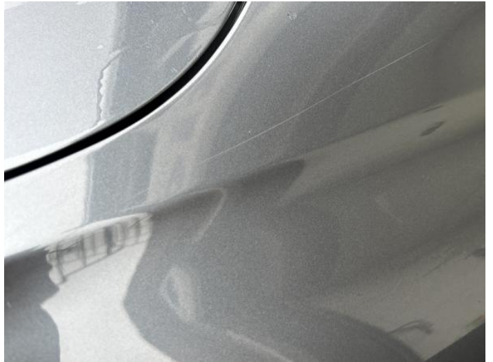
4: Qtr Panel osr Scratched Over 25mm Not Thru Paint