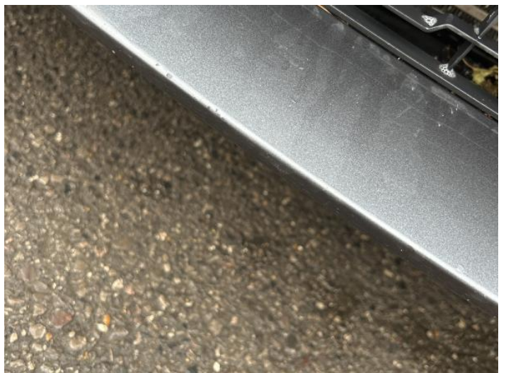
8: Bumper Front Chipped Multiple Chips