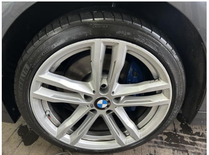
2: Wheel nsf Scratched Over 50mm