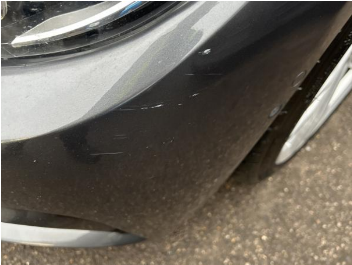
9: Bumper Front Scratched Over 25mm Not Thru Paint