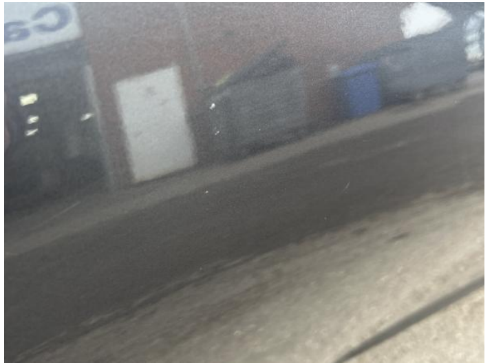
6: Qtr Panel osr Chipped 1 To 5