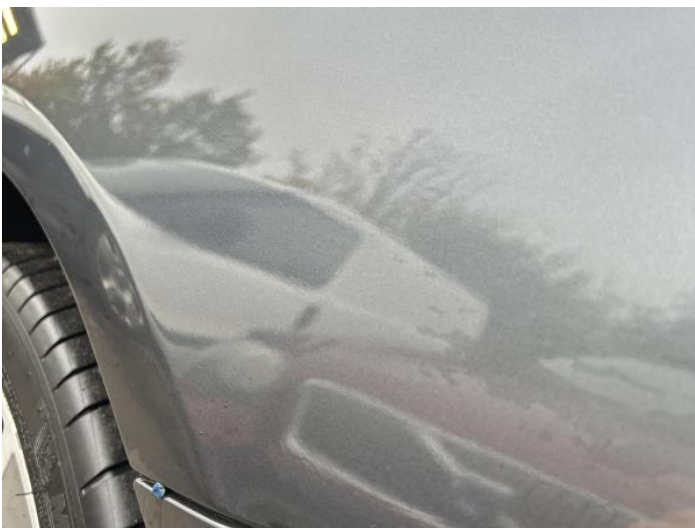
7: Qtr Panel nsr Poor Previous Repair Poor Paint