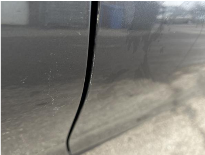
5: Door osf Chipped Edge Chip