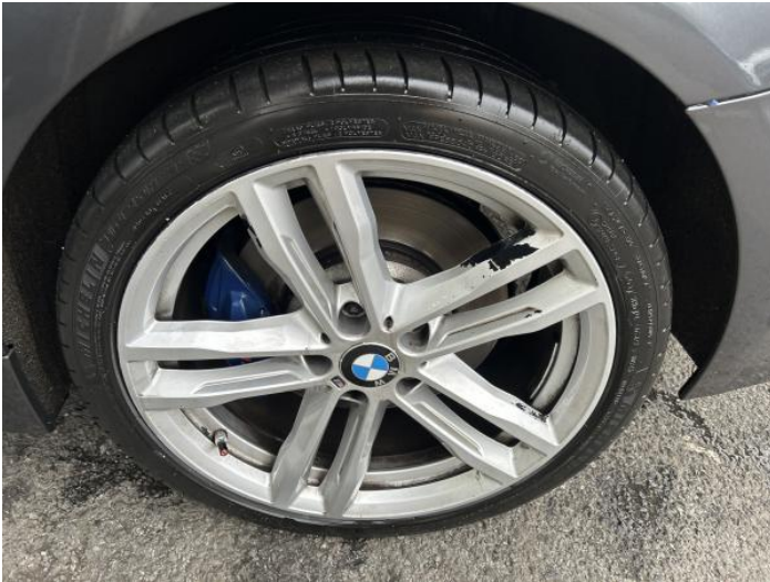
3: Wheel nsr Scratched Over 50mm