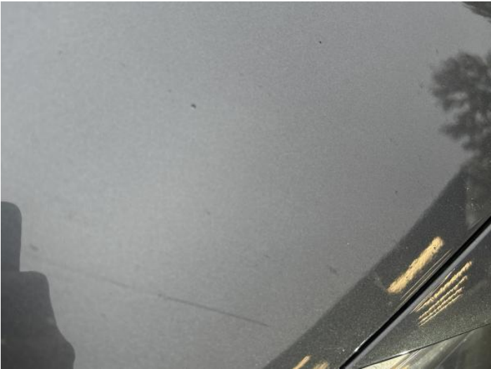
10: Bonnet Chipped 1 To 5