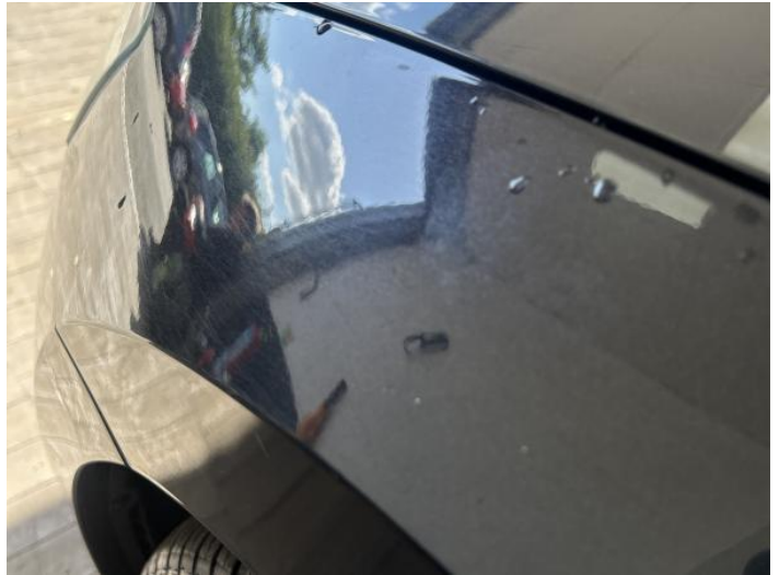
4: Wing nsf Scratched Over 25mm Not Thru Paint