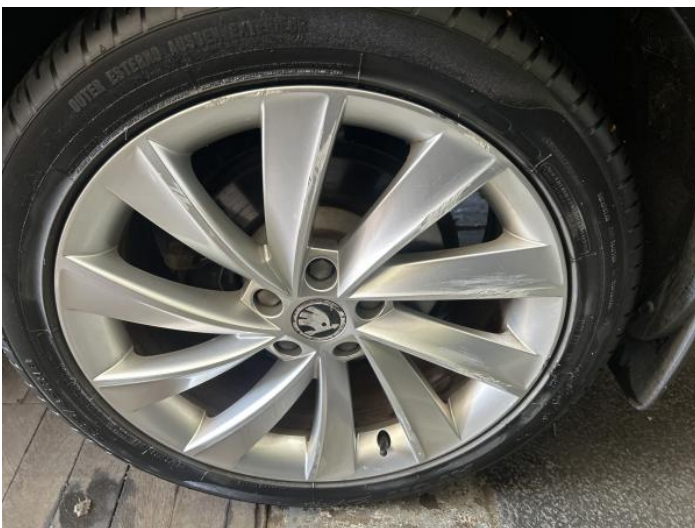
7: Wheel nsr Scratched Over 50mm