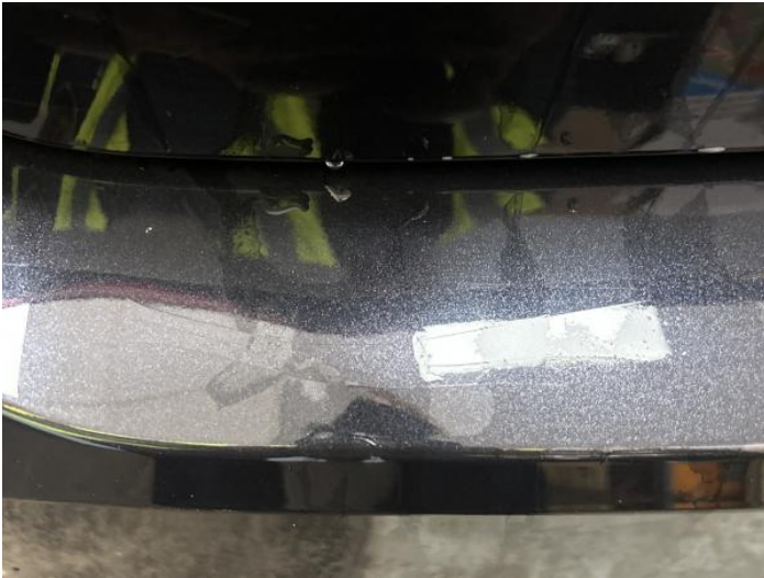
3: Bumper Rear Scratched 25 to 100mm Thru Paint