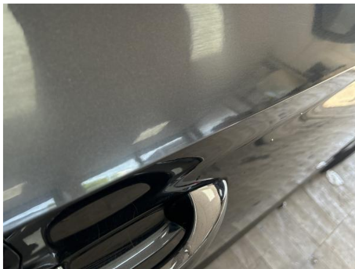
2: Door osf Scratched Over 25mm Not Thru Paint