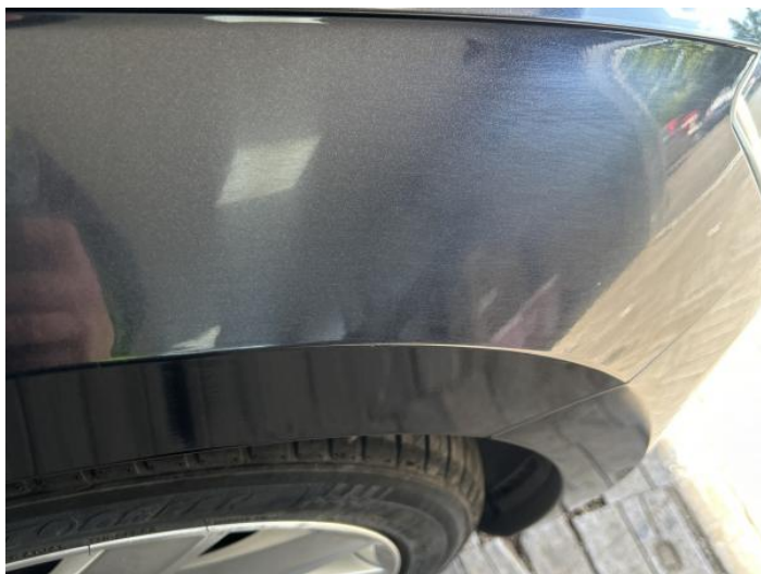
1: Wing osf Scratched Over 25mm Not Thru Paint