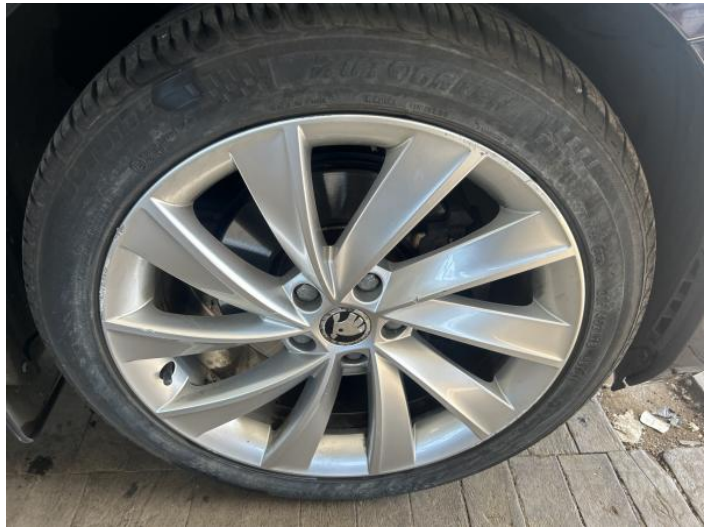
6: Wheel osf Scratched Over 50mm