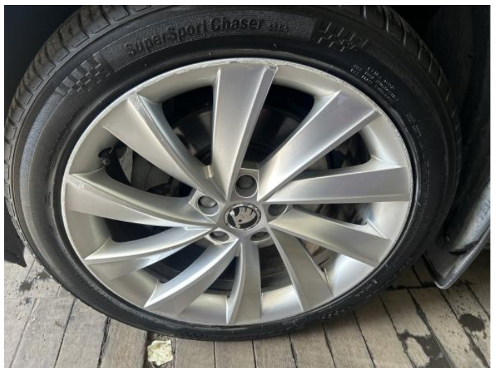
8: Wheel nsf Scratched Over 50mm