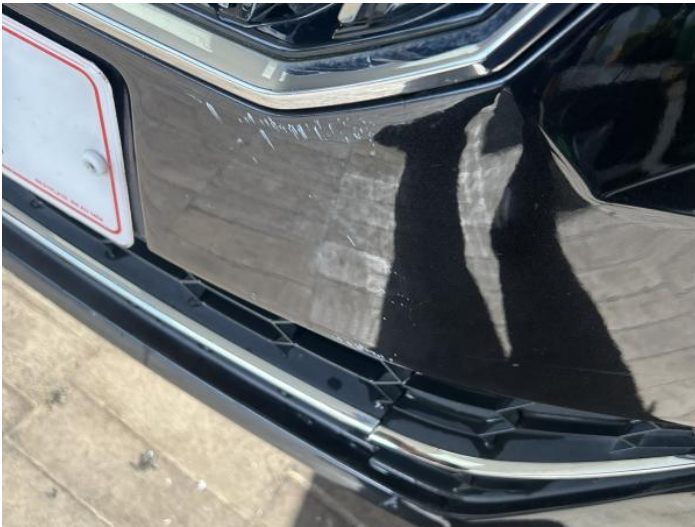
5: Bumper Front Scratched 25 to 100mm Thru Paint