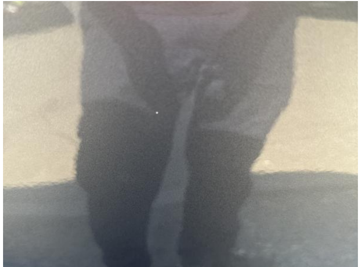
4: Qtr Panel nsr Chipped 1 To 5