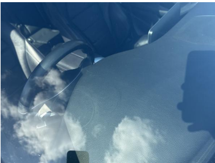
13: Screen Front Chipped UpTo 10mm