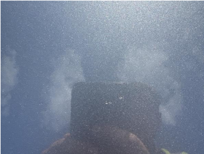
9: Bonnet Chipped 1 To 5