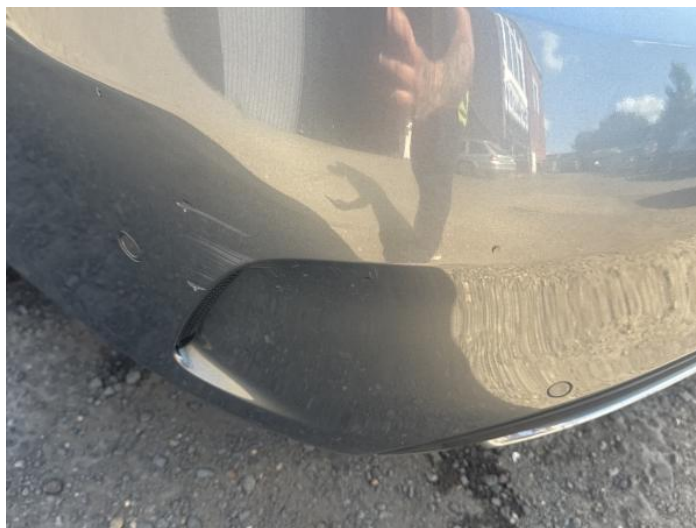
2: Bumper Rear Scratched 25 to 100mm Thru Paint