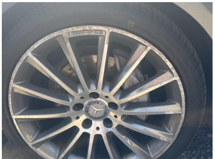
8: Wheel nsf Scratched Over 50mm