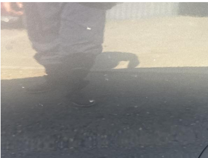
7: Door nsf Chipped 1 To 5