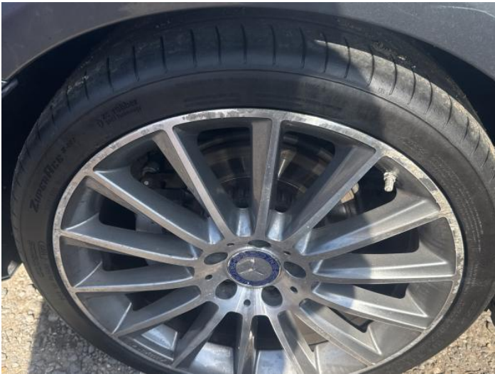
17: Wheel osr Scratched Over 50mm