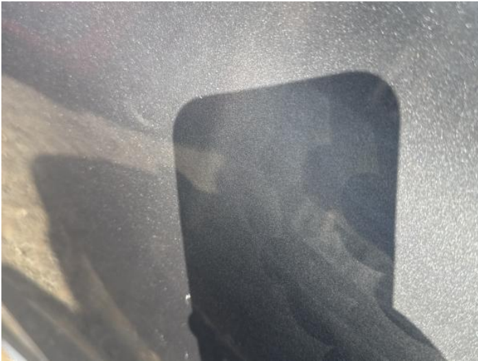
15: Door osr Chipped 1 To 5