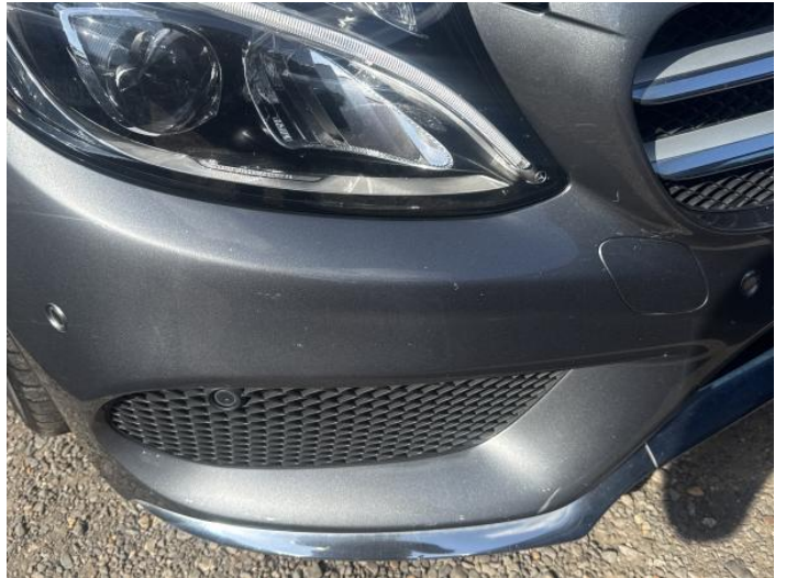
10: Bumper Front Scratched 25 to 100mm Thru Paint