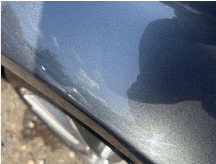
11: Wing osf Chipped 1 To 5