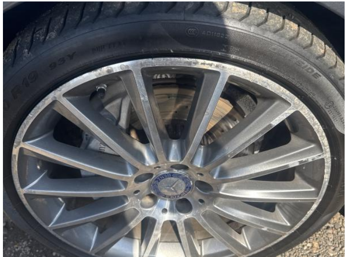
12: Wheel osf Scratched Over 50mm