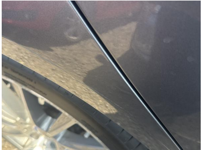
16: Qtr Panel osr Scratched Over 25mm Thru Paint