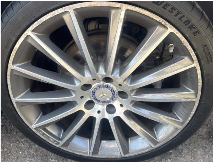
5: Wheel nsr Scratched Over 50mm