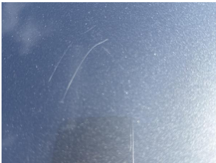
1: Boot Lid Scratched Over 25mm Thru Paint