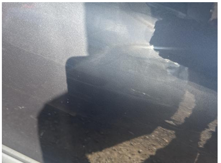
14: Door osf Chipped 1 To 5