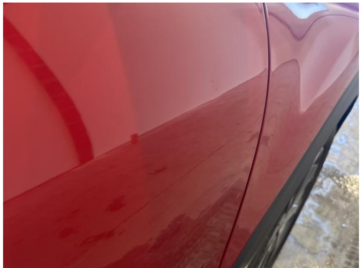
10: Door osf Dented Over 2 UpTo 10mm