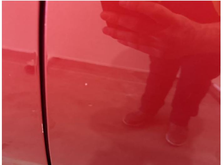
4: Door nsr Chipped 1 To 5