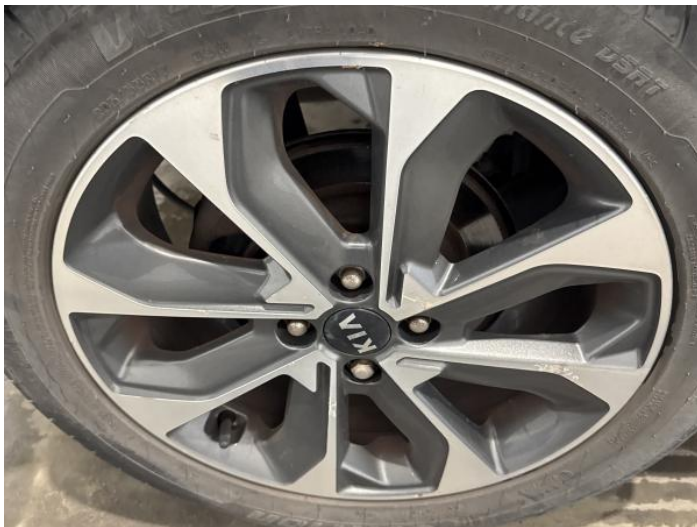
9: Wheel osf Scratched Over 50mm