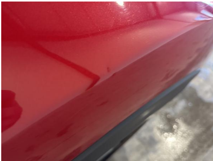
11: Wing osf Dented Over 2 UpTo 10mm