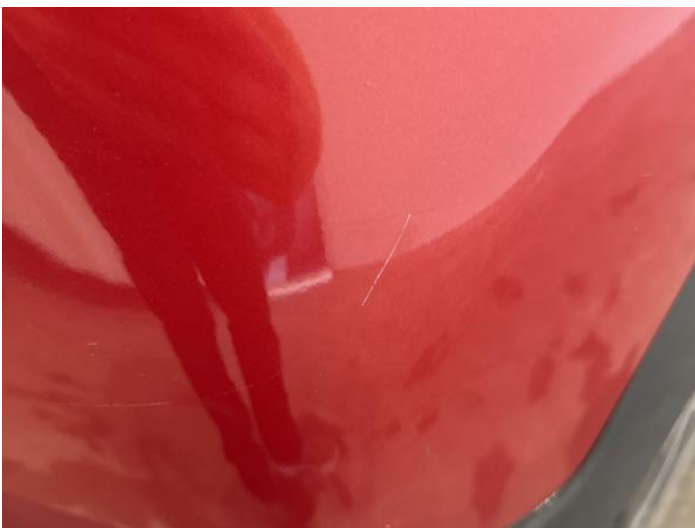
7: Bumper Rear Scratched 25 to 100mm Thru Paint