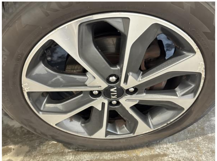
12: Wheel osf Scratched Over 50mm