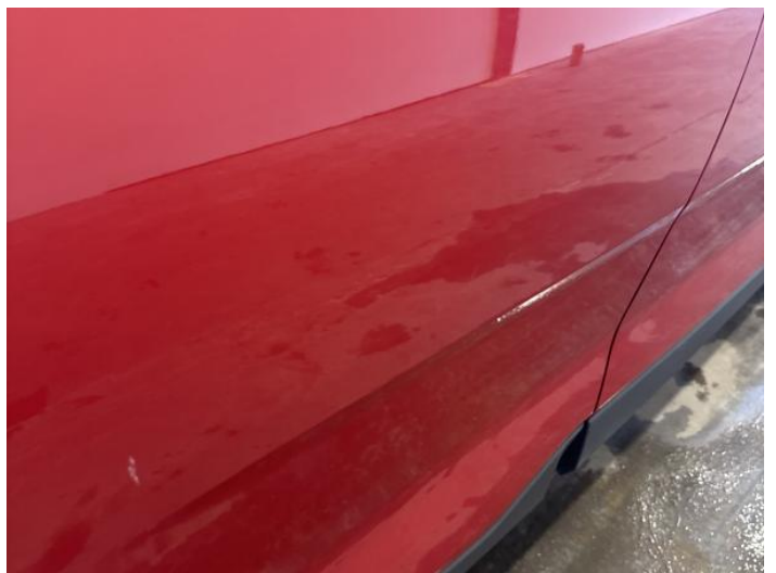
8: Door osr Chipped 1 To 5