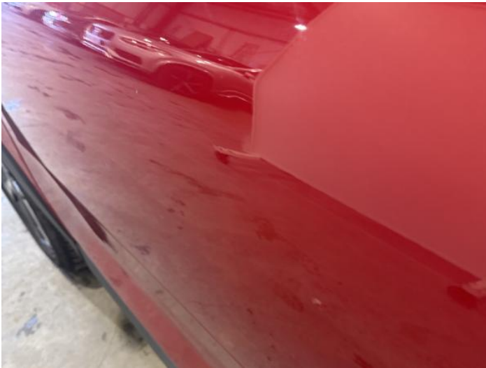
5: Door nsf Dented Between 10mm + 30mm