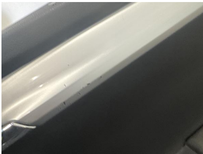
1: Door Pad osf Scuffed UpTo 25mm