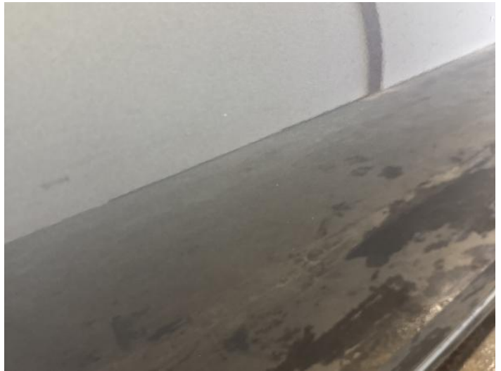
12: Door osr Chipped 1 To 5