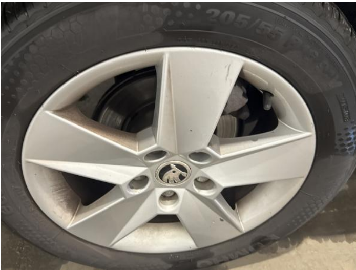
11: Wheel osr Scratched Over 50mm