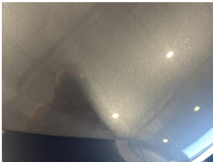
2: Bonnet Chipped 1 To 5