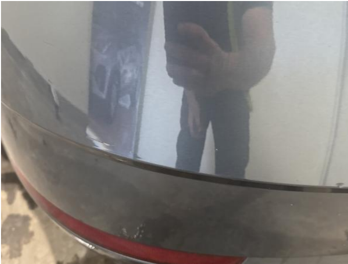
9: Bumper Rear Scratched 25 to 100mm Thru Paint