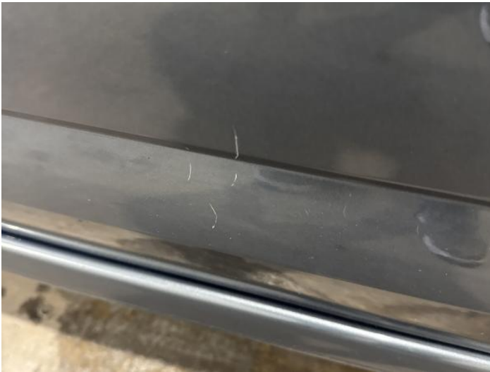
5: Door nsr Scratched Over 25mm Thru Paint