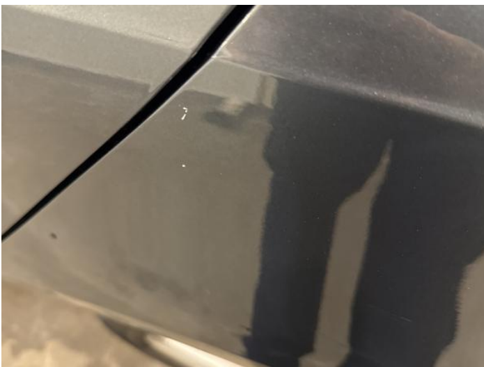
7: Qtr Panel nsr Chipped 1 To 5