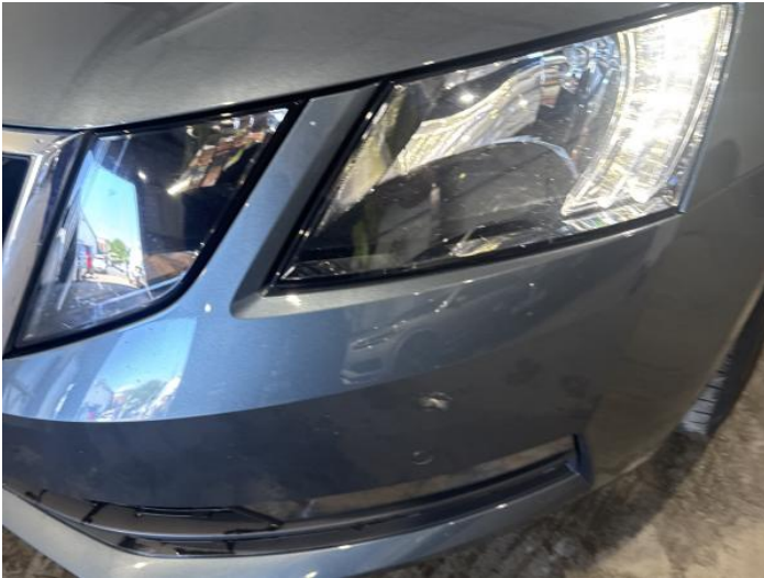
3: Bumper Front Chipped Multiple Chips