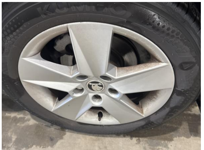
8: Wheel nsr Corroded Light