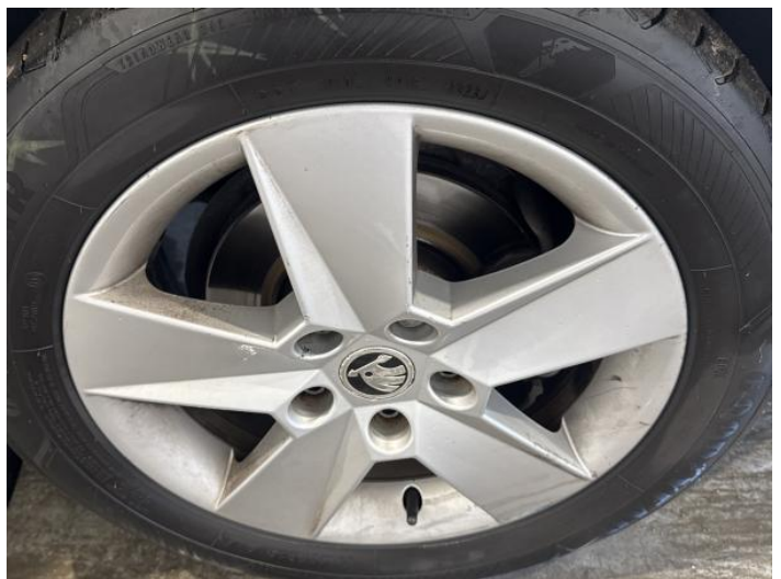
14: Wheel osf Corroded Light