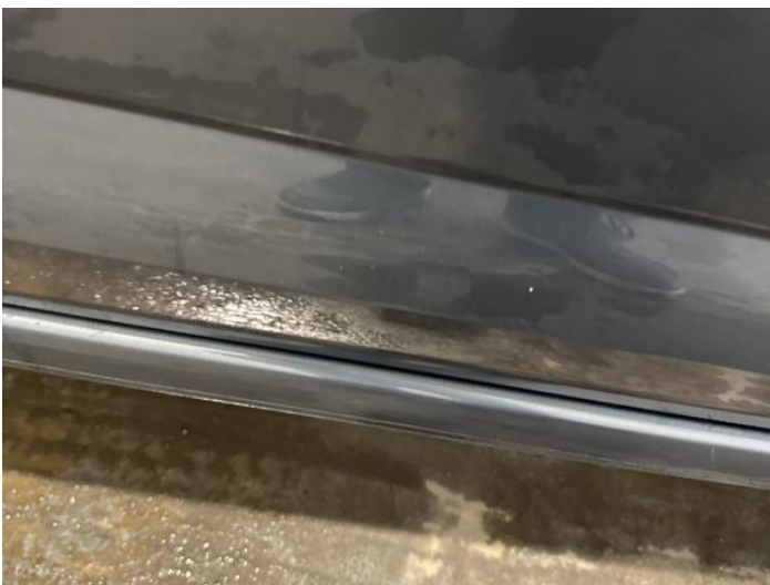
13: Door osf Dented Over 2 UpTo 10mm