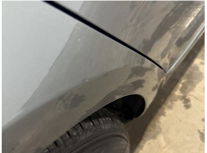
10: Qtr Panel osr Dented Between 10mm + 30mm