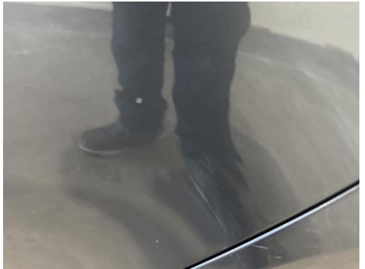
6: Door nsr Chipped 1 To 5