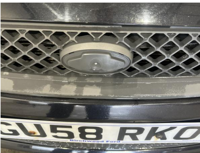
13: Badgedecal Front Missing Replace