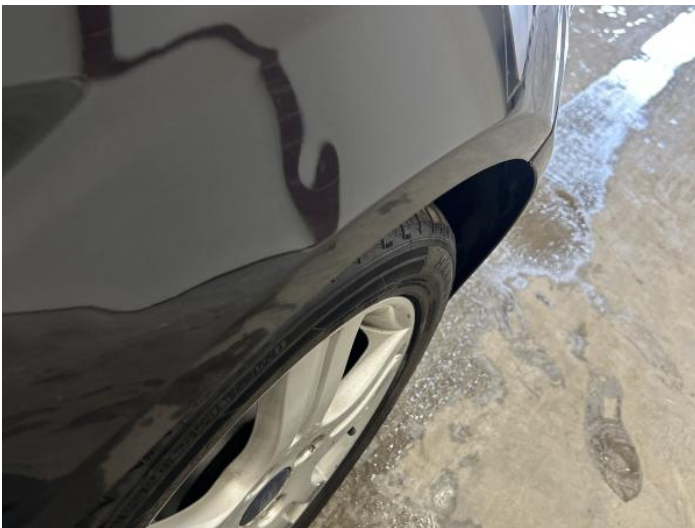
1: Wing of Dented 2 Or Less Up To 10mm