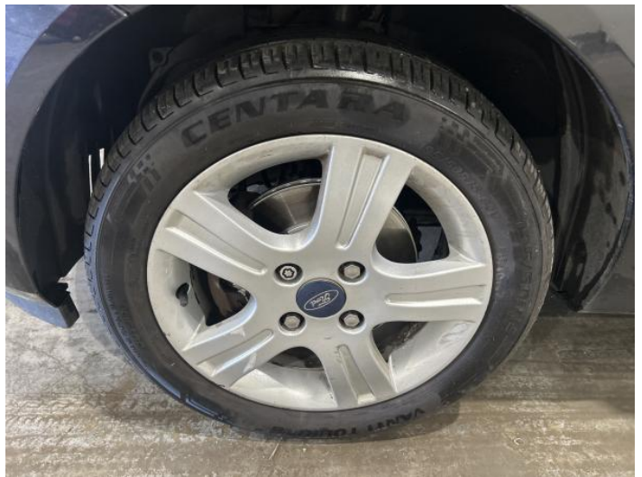
12: Wheel nsf Scratched Over 50mm