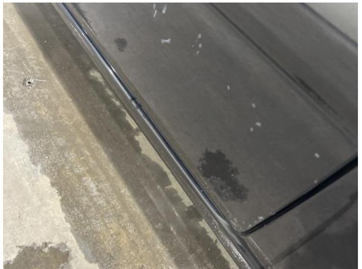
6: Door nsf Chipped Multiple Chips