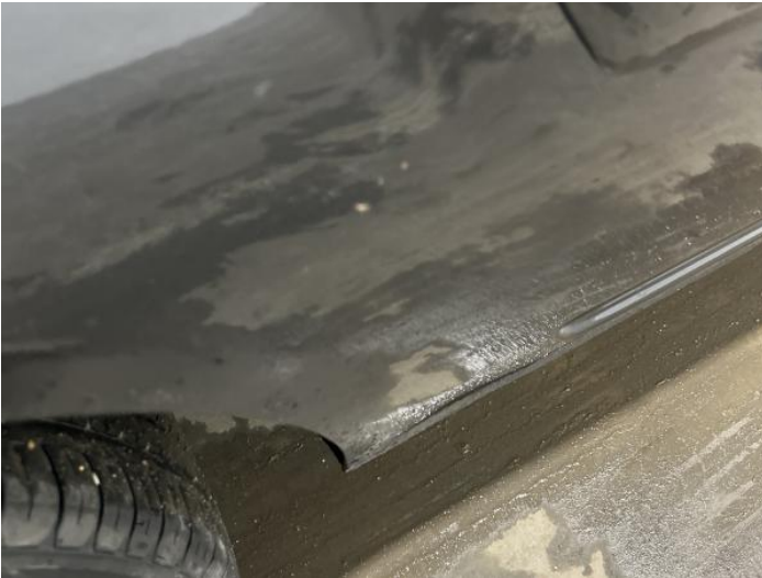
3: Qtr Panel osr Chipped 1 To 5