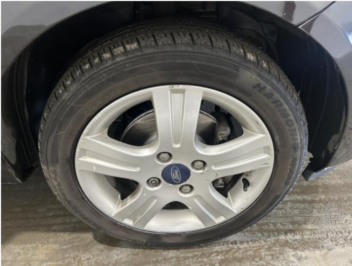
9: Wheel osf Scratched Over 50mm