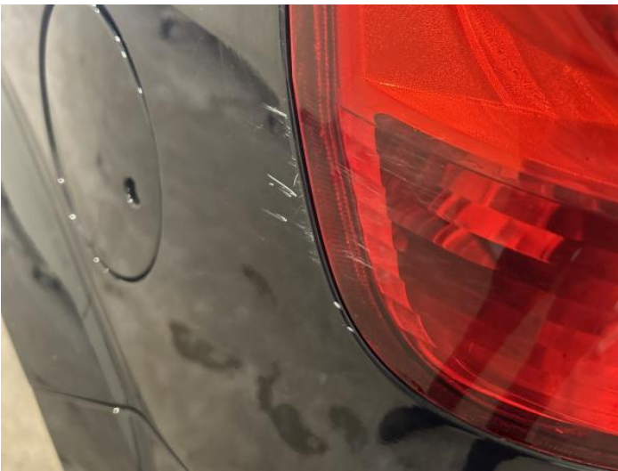
5: Qtr Panel nsr Scratched Over 25mm Thru Paint