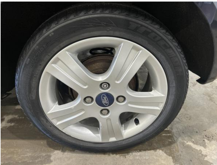
11: Wheel nsr Scratched Over 50mm