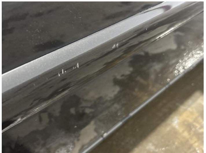
2: Door Moulding of Scratched (Painted) Up To 25mm Thru Paint