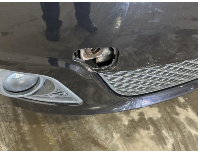
7: Other N/A N/A