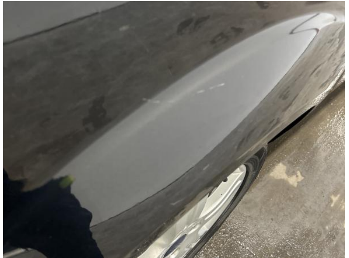
4: Qtr Panel osr Scratched Over 25mm Not Thru Paint