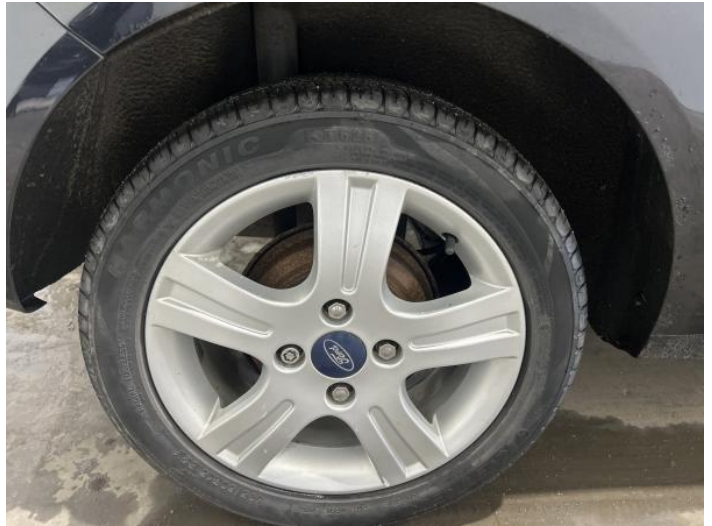
10: Wheel osr Scratched Over 50mm