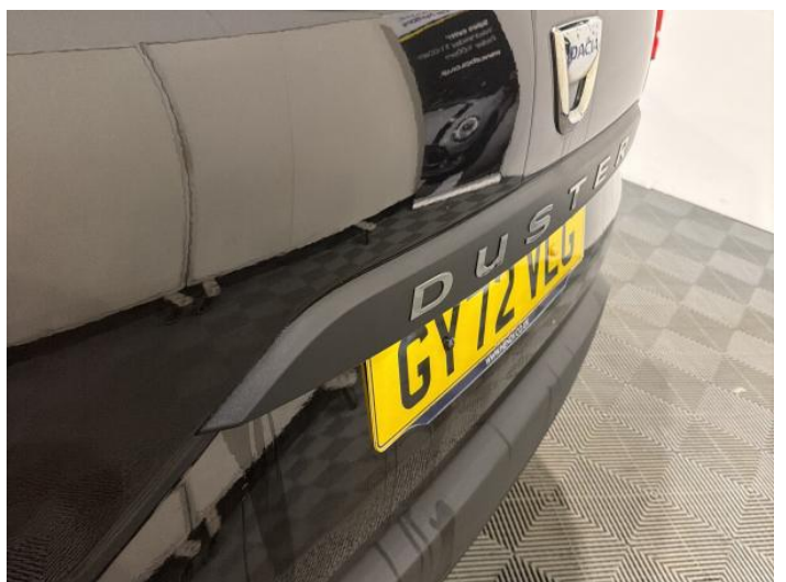
13: Bumper Rear Scratched Over 25mm Not Thru Paint