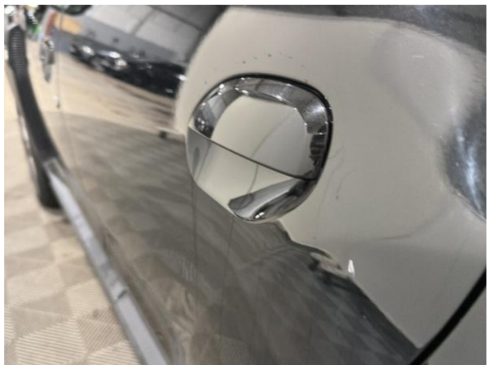
7: Door nsf Scratched Over 25mm Not Thru Paint