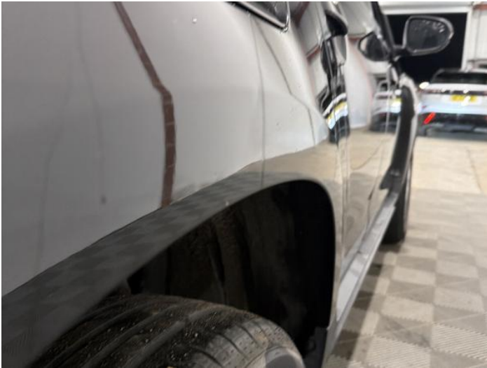
15: Qtr Panel osr Dented Between 10mm + 30mm