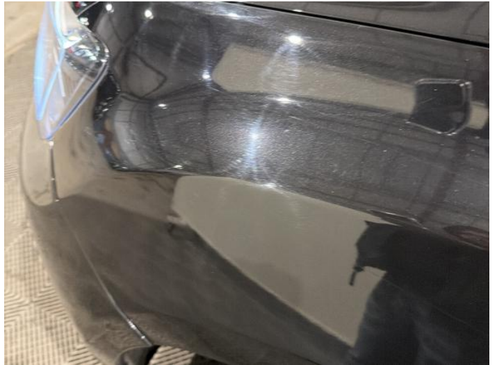
3: Bumper Front Scratched Over 25mm Not Thru Paint