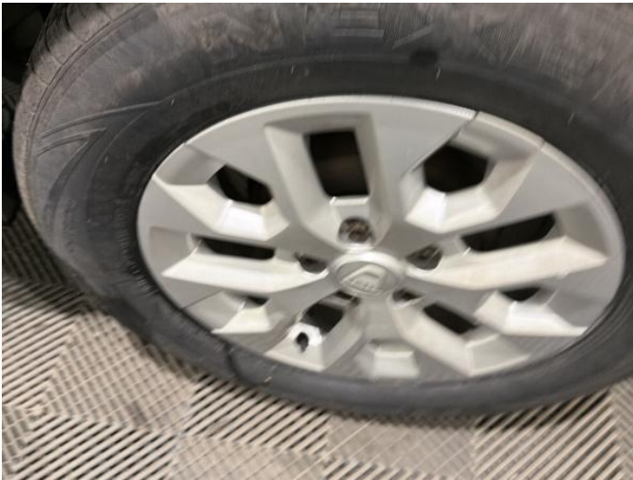
11: Wheel nsr Scratched Up To 50mm