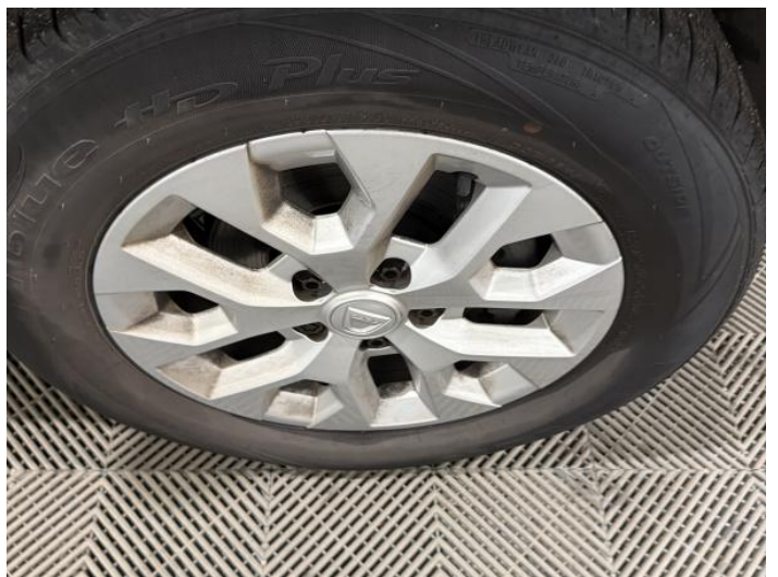
20: Wheel osf Scratched Up To 50mm