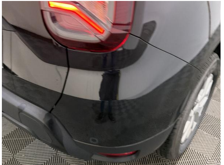
12: Bumper Rear Chipped Multiple Chips