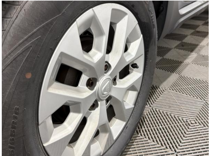
16: Wheel osr Scratched Up To 50mm