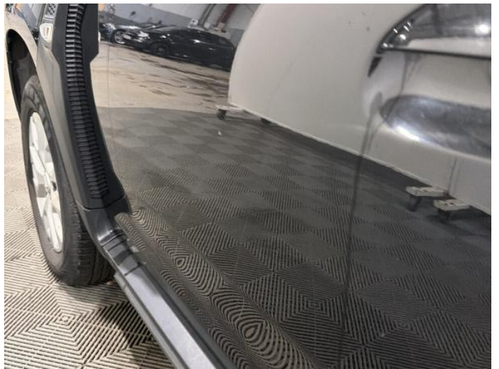
6: Door nsf Chipped 1 To 5