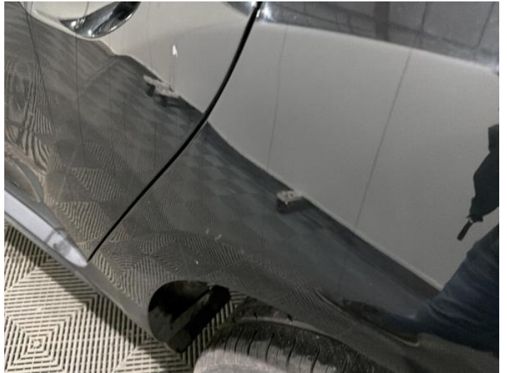
9: Door nsr Scratched Over 25mm Not Thru Paint