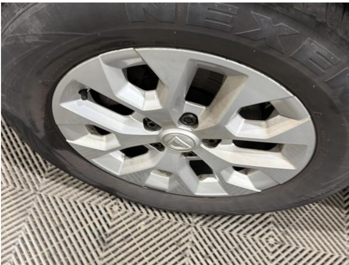
5: Wheel nsf Scratched Up To 50mm