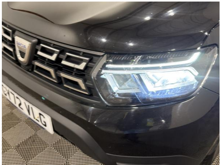
2: Bumper Front Chipped Multiple Chips