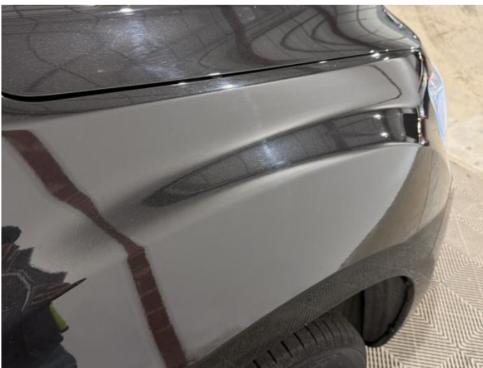
19: Wing osf Chipped 1 To 5