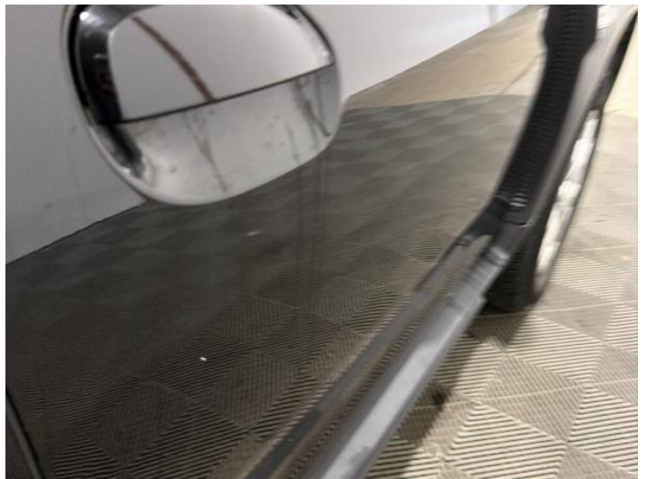
18: Door osf Dented Over 30mm