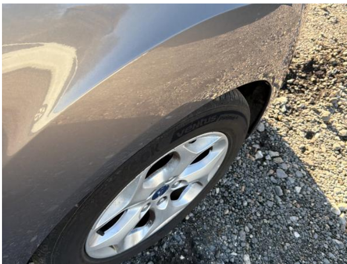
7: Wing osf Dented Over 30mm