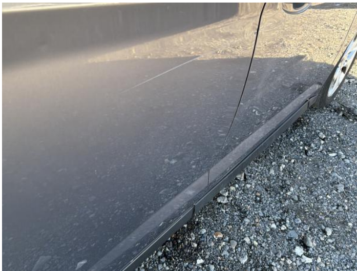
5: Door osr Dented With Paint Damage