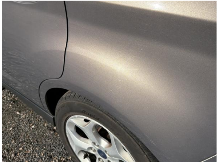
16: Qtr Panel nsr Dented With Paint Damage