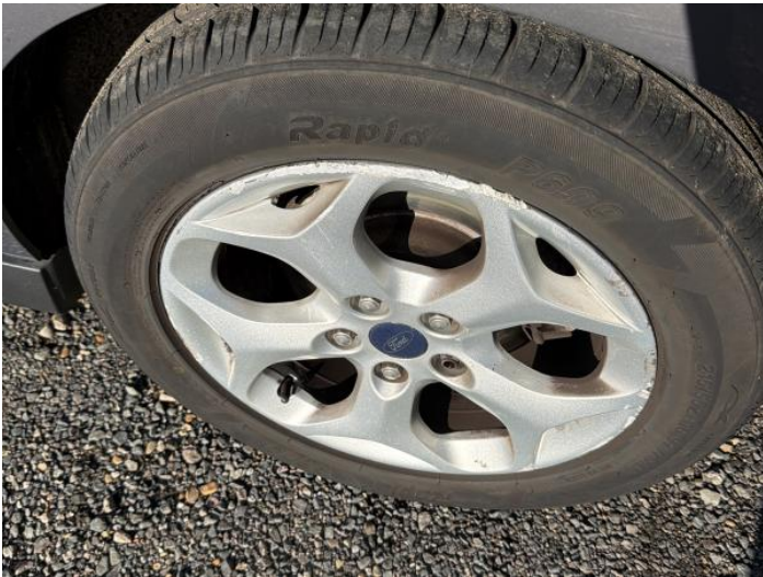
17: Wheel nsr Scratched Over 50mm