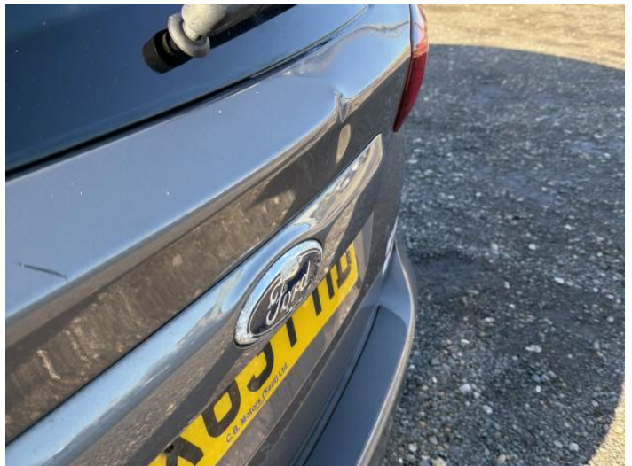
2: Boot Lid Dented With Paint Damage