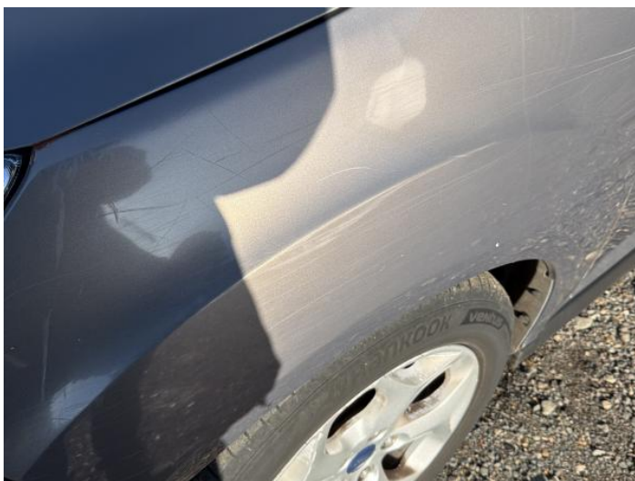
11: Wing nsf Dented With Paint Damage