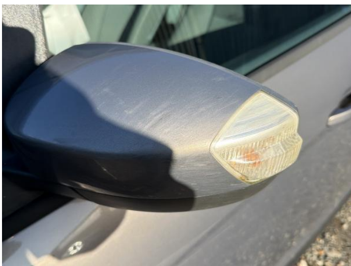
13: Door Mirror Assy nsf Scratched (Painted) Over 25mm Thru Paint