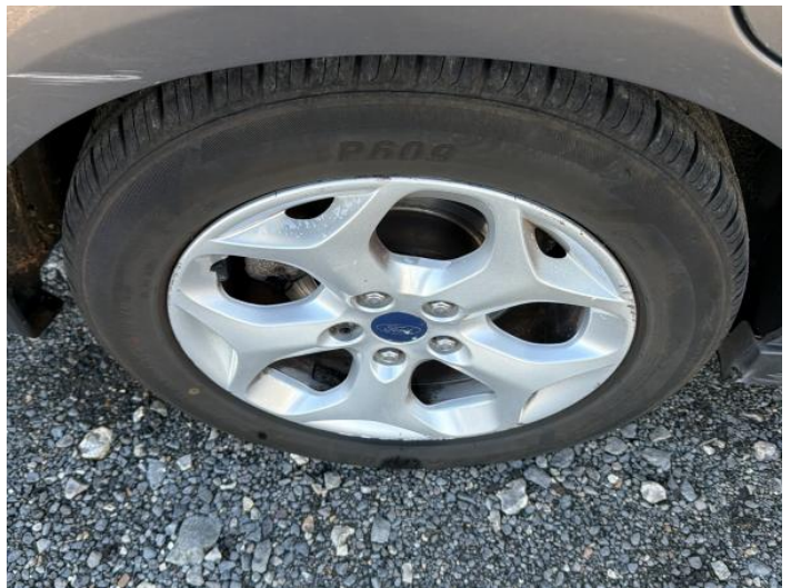
4: Wheel osr Scratched Over 50mm