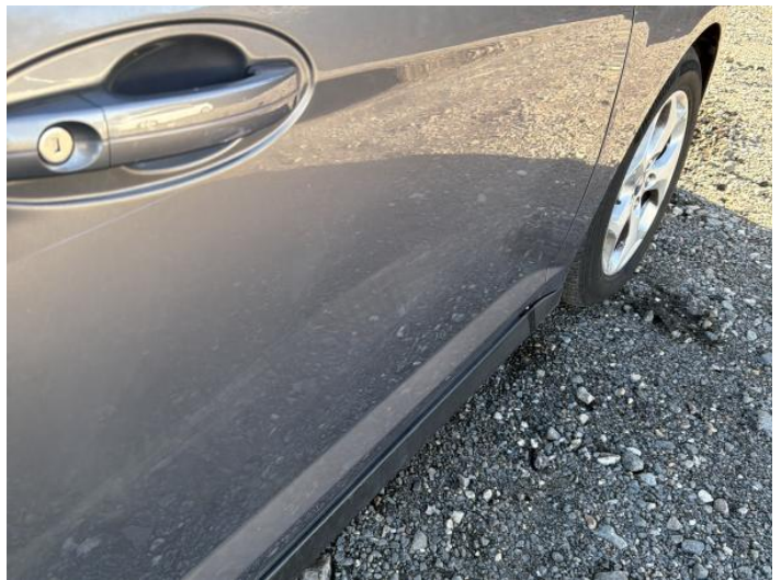
6: Door osf Dented With Paint Damage