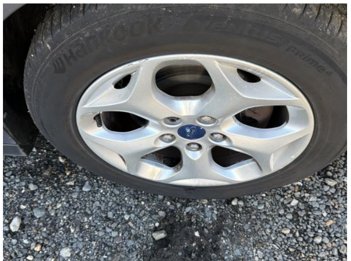
8: Wheel osf Scratched Over 50mm