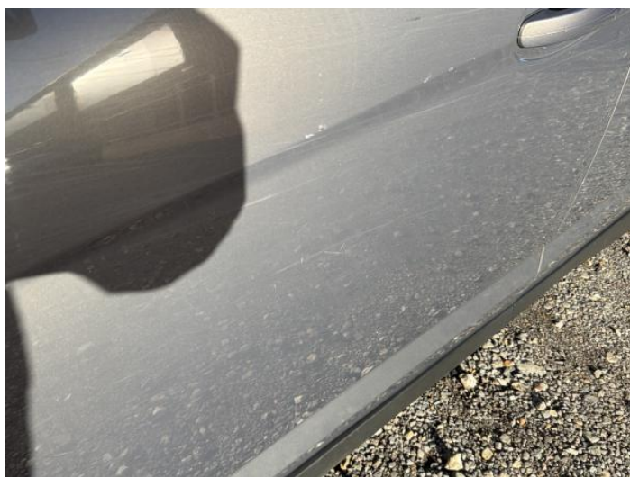
14: Door nsf Chipped Multiple Chips