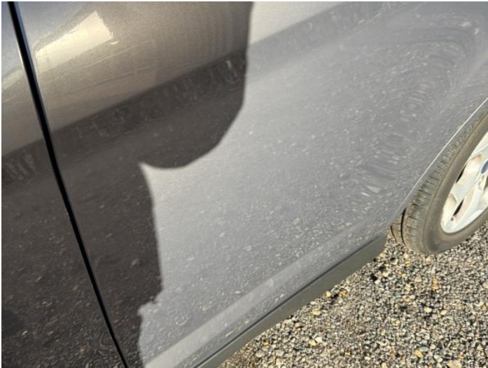
15: Door nsr Dented With Paint Damage