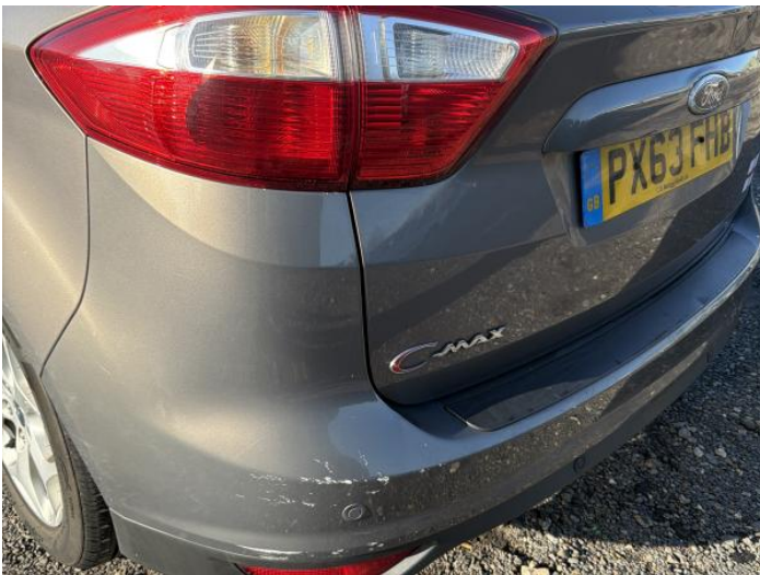
1: Bumper Rear Dented With Paint Damage