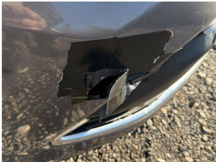
10: Bumper Front Cracked Over 25mm