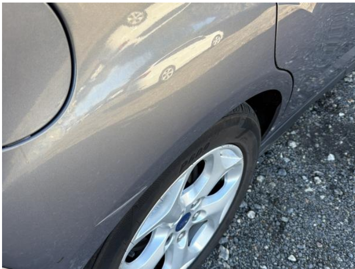
3: Qtr Panel osr Dented With Paint Damage