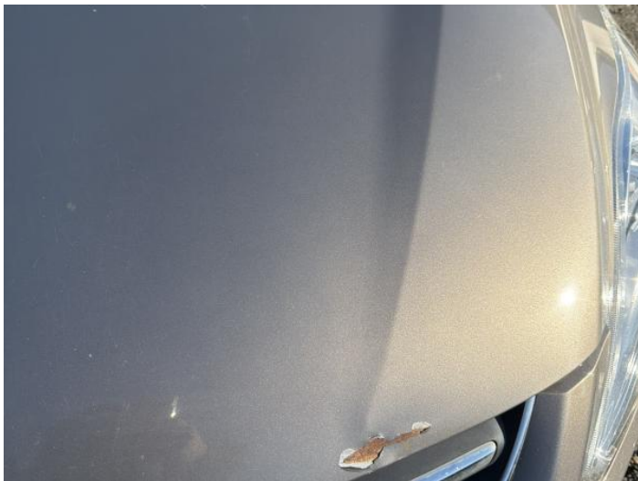
9: Bonnet Dented With Paint Damage