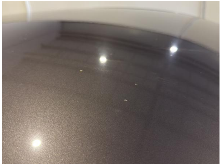
18: Roof Dented Between 10mm + 30mm