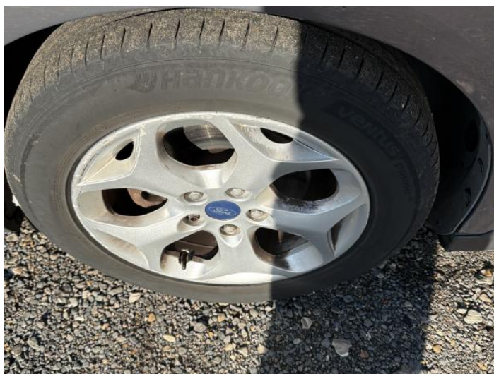
12: Wheel nsf Scratched Over 50mm