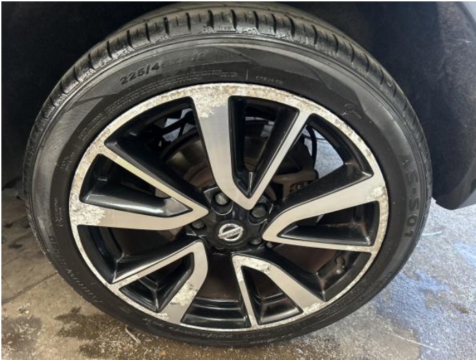
3: Wheel nsr Scratched Over 50mm