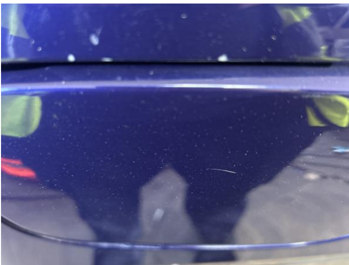
7: Qtr Panel nsr Chipped 1 To 5