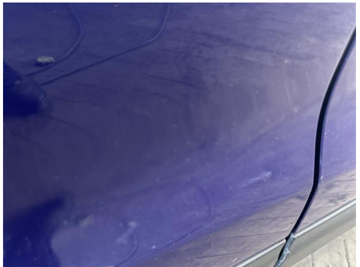
6: Door osr Scratched Over 25mm Thru Paint