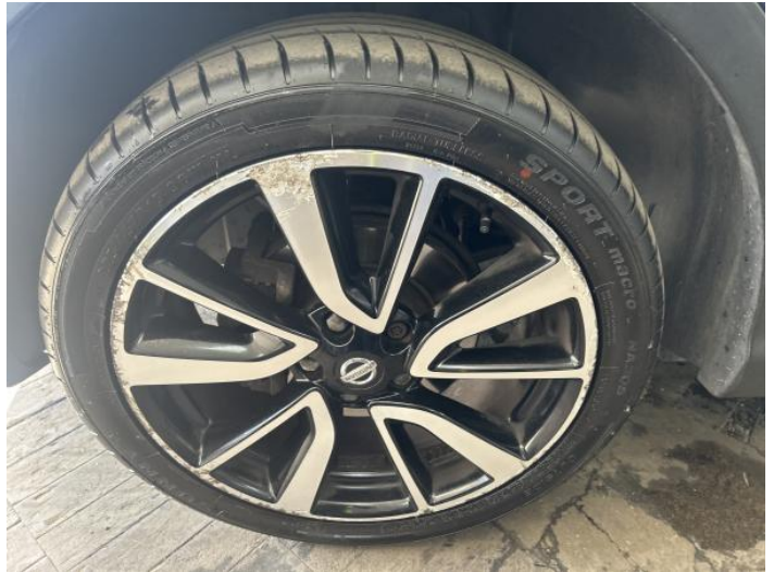
4: Wheel nsf Scratched Over 50mm