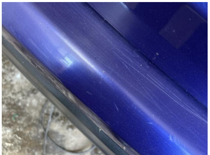
8: Bumper Rear Poor Previous Repair Poor Paint