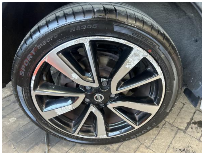
2: Wheel osr Scratched Over 50mm