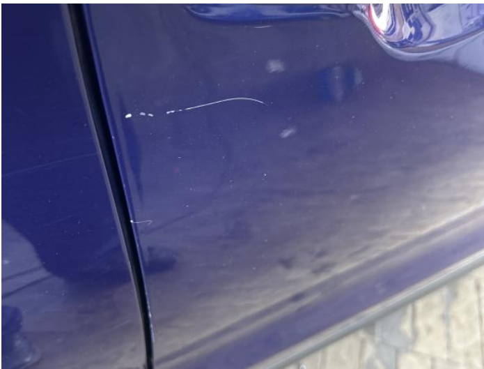
5: Door osf Scratched Over 25mm Thru Paint