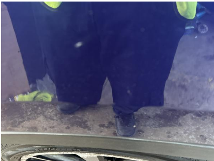
9: Qtr Panel nsr Chipped 1 To 5