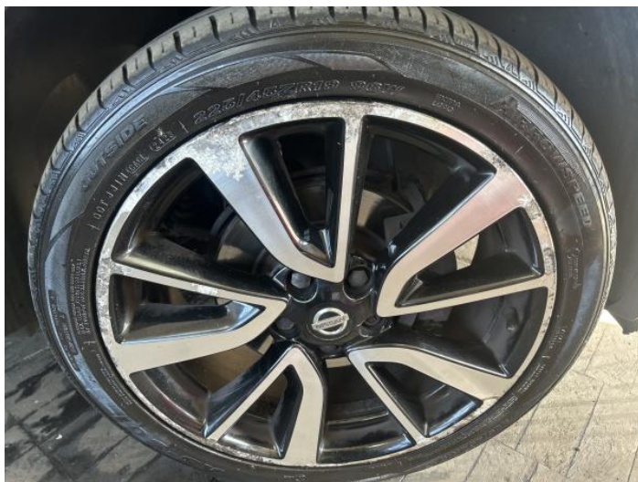
1: Wheel osf Scratched Over 50mm