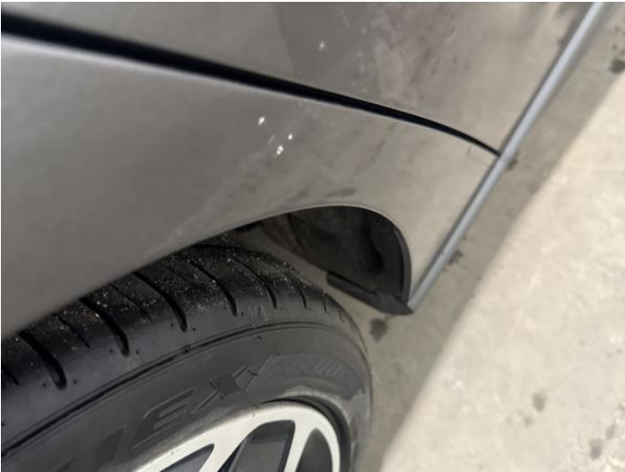
10: Qtr Panel osr Chipped 1 To 5