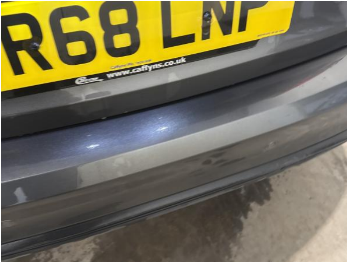
9: Bumper Rear Chipped Multiple Chips