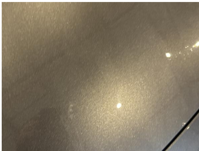
2: Bonnet Chipped 1 To 5