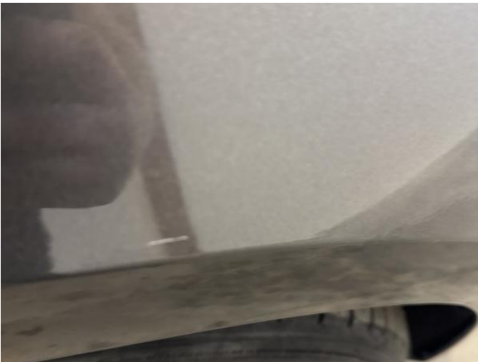
14: Wing osf Scratched UpTo 25mm Thru Paint