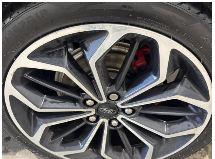
8: Wheel nsr Corroded Light