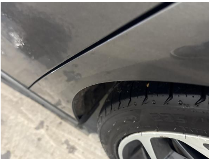
7: Qtr Panel nsr Dented Over 2 UpTo 10mm