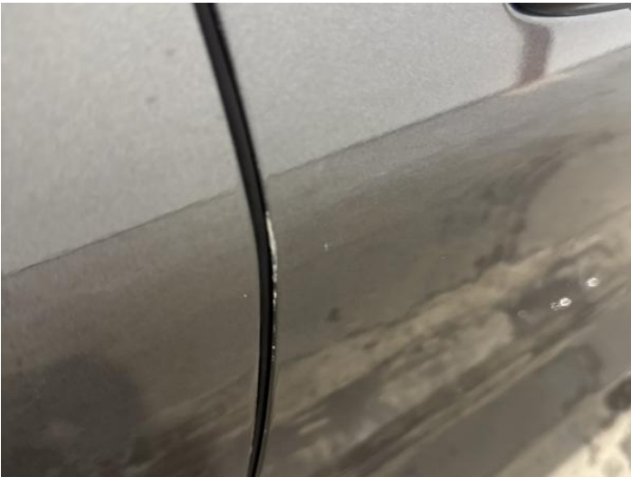
12: Door osf Chipped Edge Chip