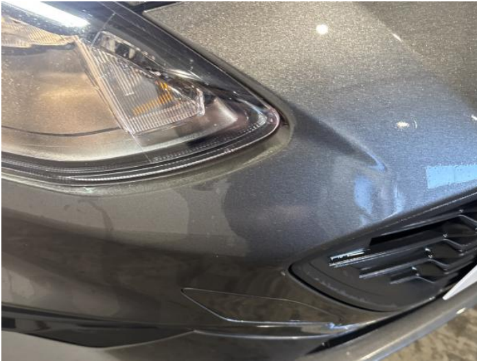
3: Bumper Front Chipped Multiple Chips