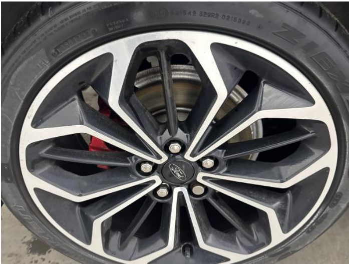
11: Wheel osr Scratched Up To 50mm