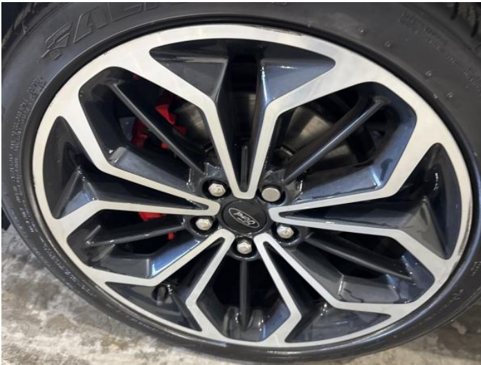
5: Wheel nsf Scratched Up To 50mm