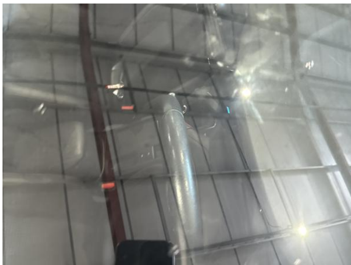
1: Screen Front Chipped UpTo 10mm