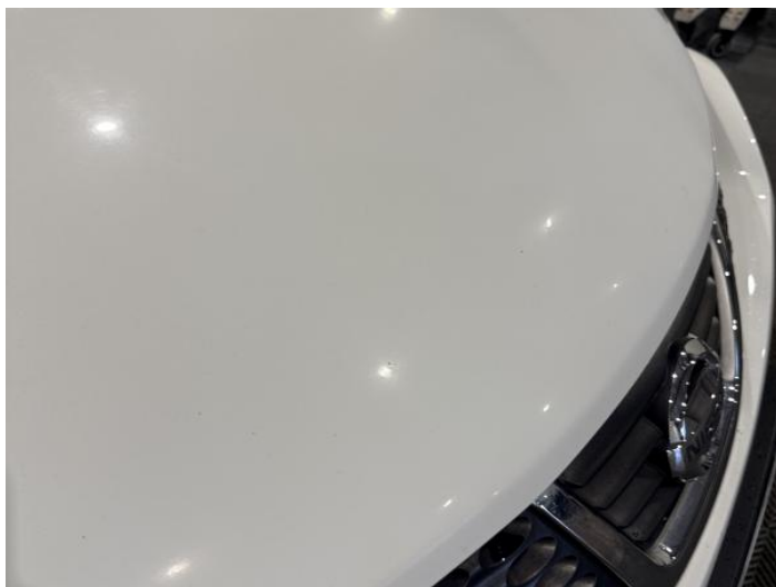
1: Bonnet Chipped 1 To 5