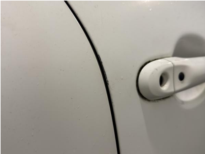
15: Door osf Chipped Edge Chip