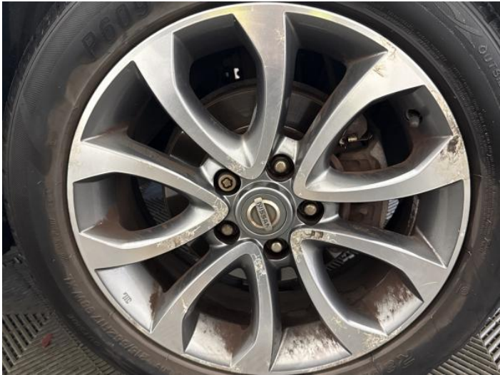
16: Wheel osf Scratched Over 50mm