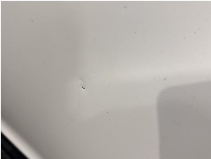
9: Door nsr Scratched UpTo 25mm Thru Paint