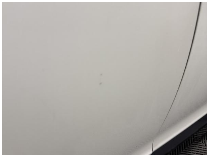
14: Door osr Scratched UpTo 25mm Thru Paint