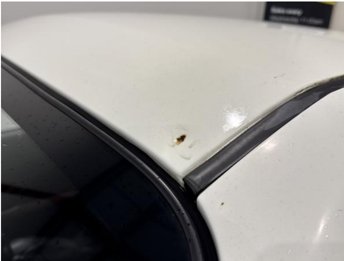
5: Roof Dented With Paint Damage