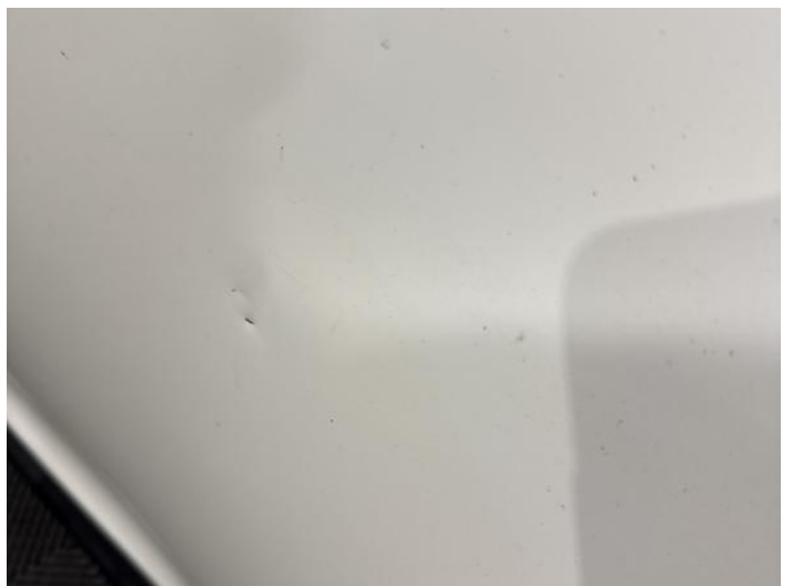
8: Door nsr Dented Between 10mm + 30mm