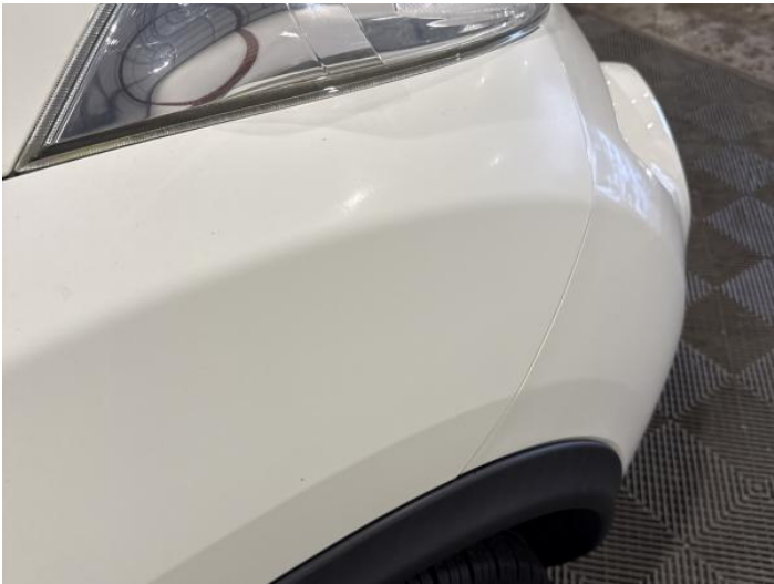
17: Wing osf Chipped 1 To 5

Carpet Condition Average Seat Condition Average