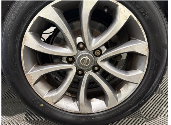
10: Wheel nsr Scratched Over 50mm