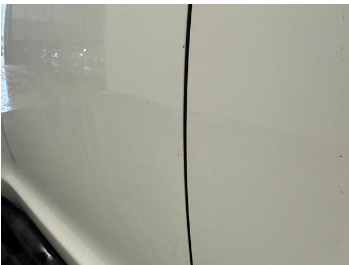
7: Door nsf Chipped 1 To 5