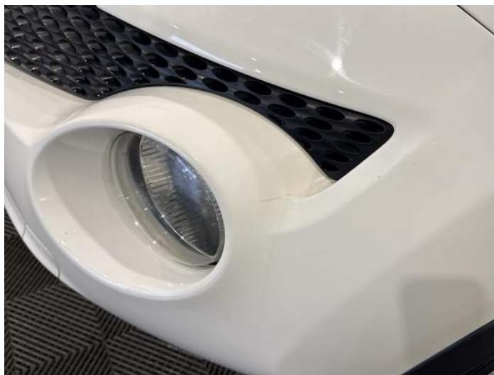
2: Bumper Front Scratched UpTo 25mm Thru Paint