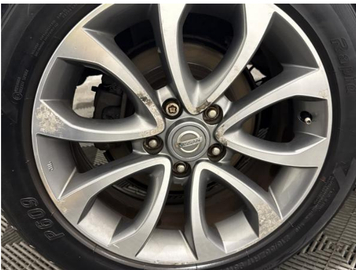
13: Wheel osr Corroded Light