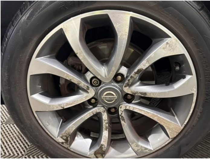
3: Wheel nsf Corroded Light