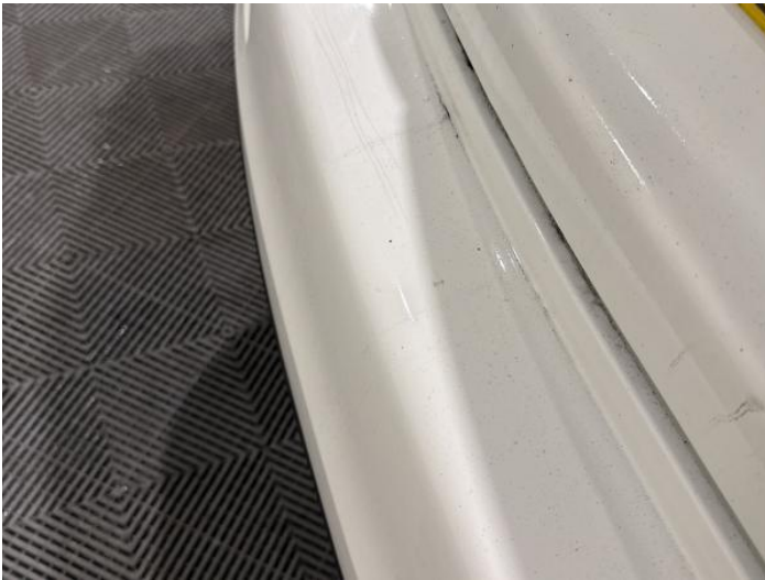
11: Bumper Rear Scratched 25 to 100mm Thru Paint