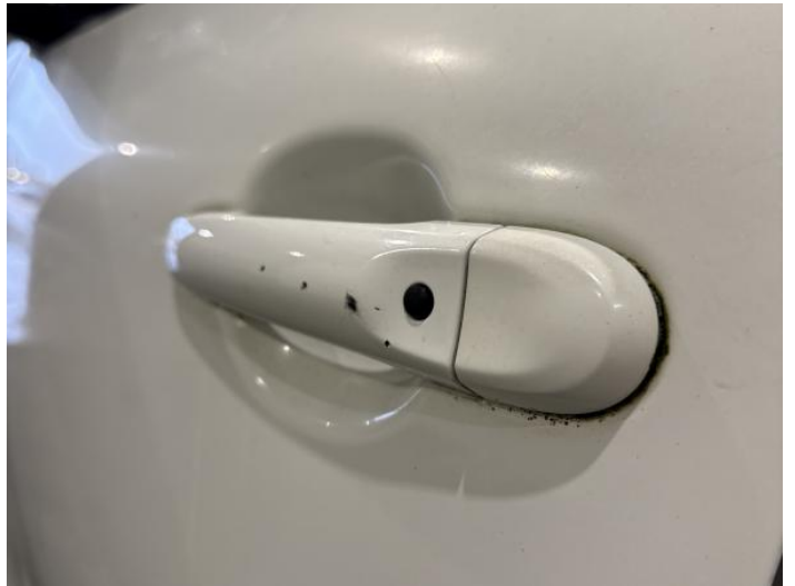
6: Handle Outer nsf Scratched (Painted) Over 25mm Thru Paint