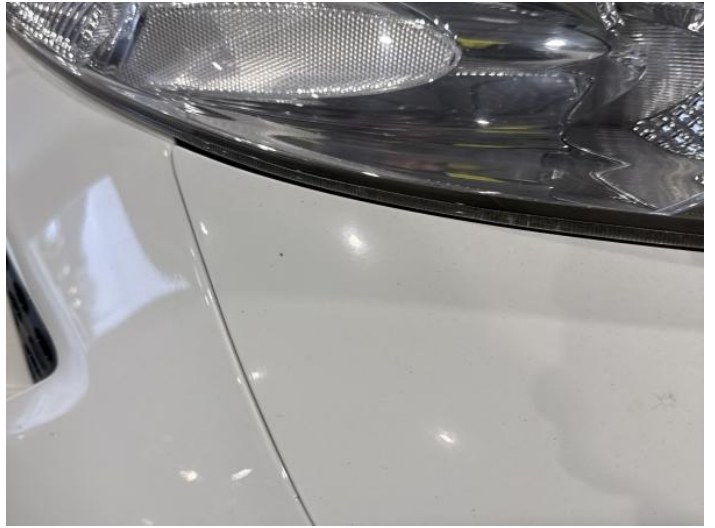
4: Wing nsf Chipped 1 To 5