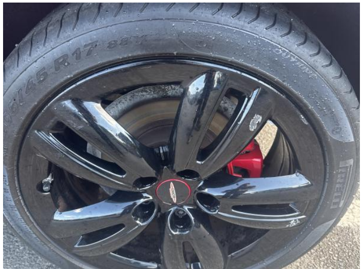
2: Wheel nsr Scratched Over 50mm