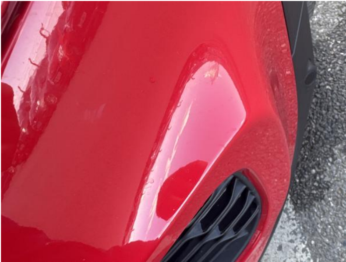
9: Bumper Front Scratched 25 to 100mm Thru Paint