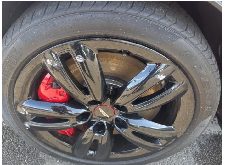
6: Wheel nsf Scratched Over 50mm