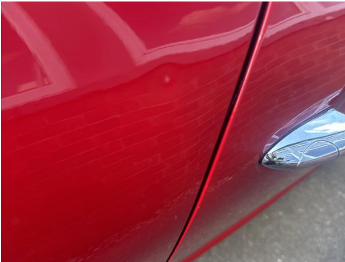
11: Qtr Panel osr Dented 2 Or Less UpTo 10mm