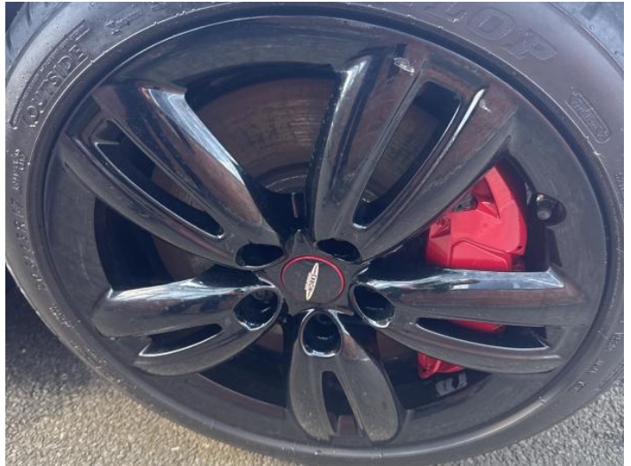
10: Wheel osf Scratched Over 50mm