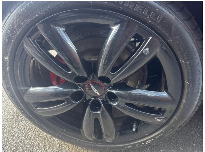
12: Wheel osr Scratched Over 50mm