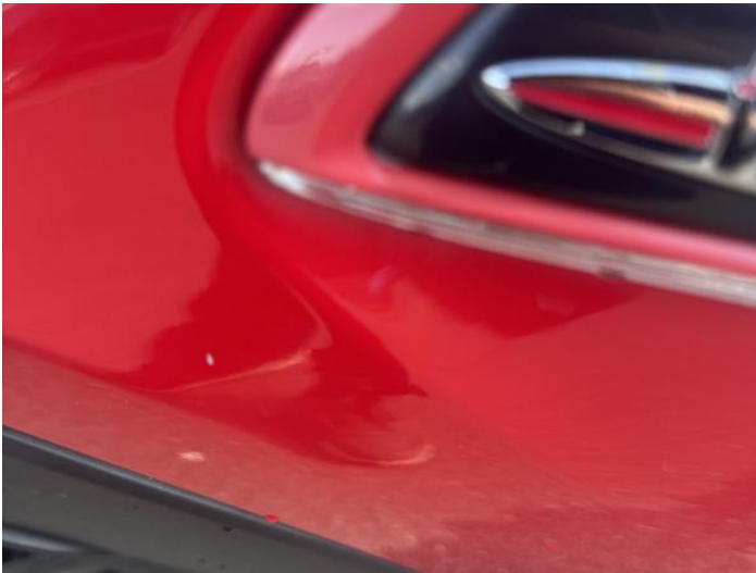
5: Wing nsf Chipped 1 To 5