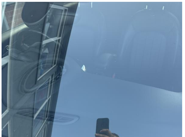
8: Screen Front Chipped UpTo 10mm