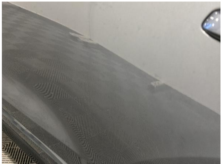
8: Door nsr Chipped 1 To 5