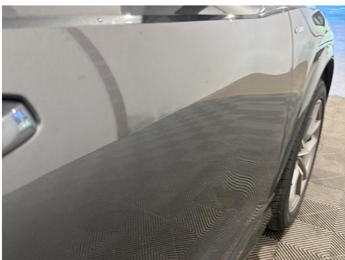
19: Door osf Chipped 1 To 5