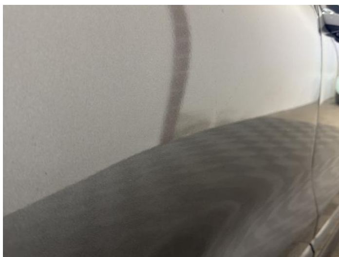
18: Door osr Chipped 1 To 5