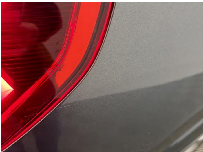
15: Qtr Panel osr Scratched UpTo 25mm Thru Paint