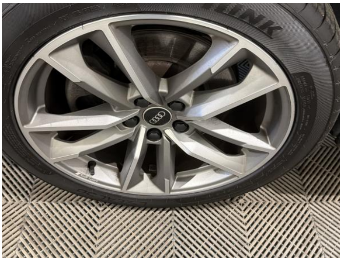
5: Wheel nsf Scratched Up To 50mm