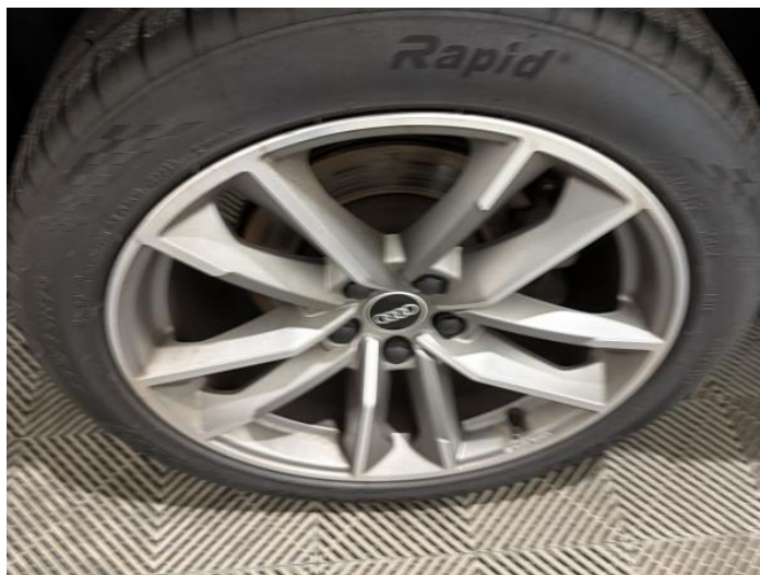
16: Wheel osr Scratched Up To 50mm