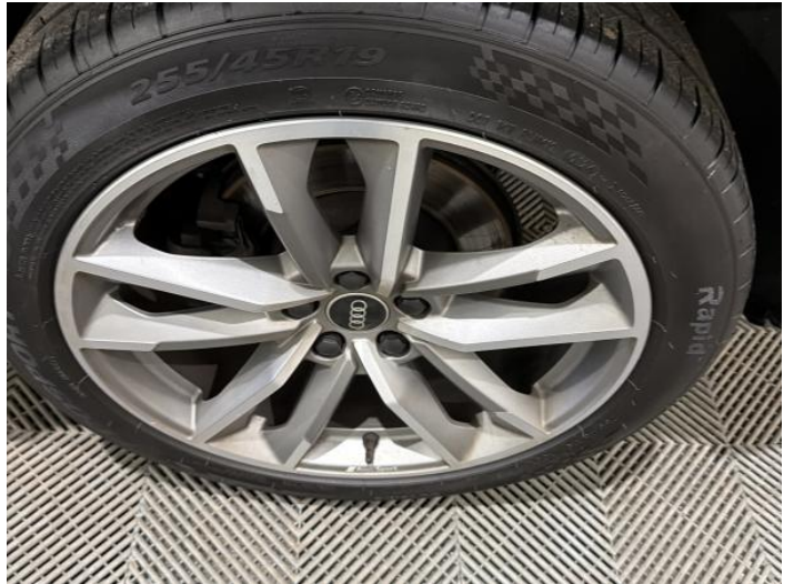
9: Door nsr Scratched Over 25mm Not Thru Paint