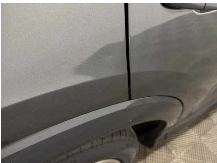
17: Qtr Panel osr Dented Between 10mm + 30mm