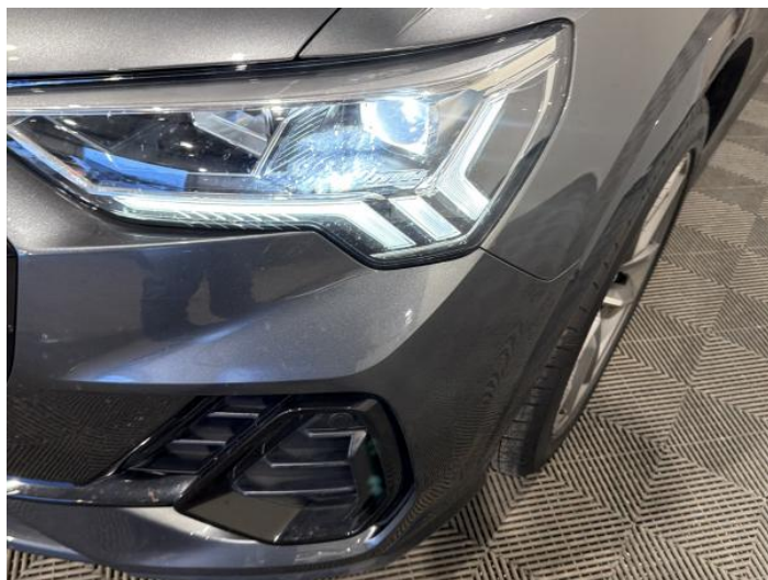
2: Bumper Front Chipped Multiple Chips