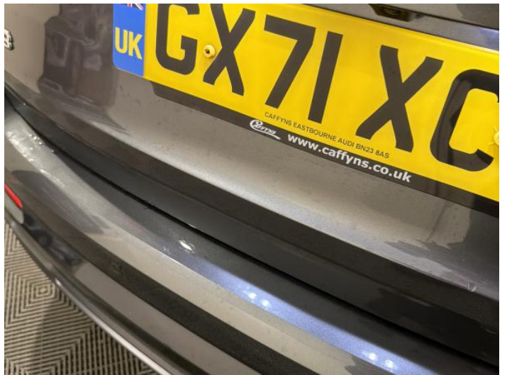
11: Qtr Panel nsr Scratched Over 25mm Not Thru Paint