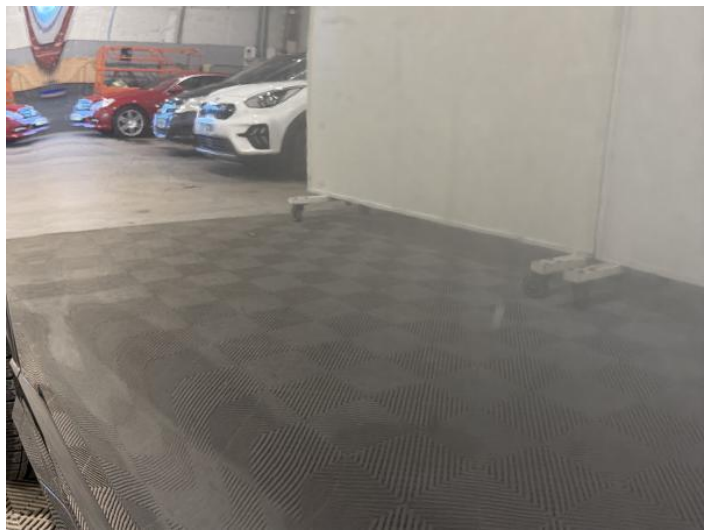
6: Door nsf Chipped 1 To 5