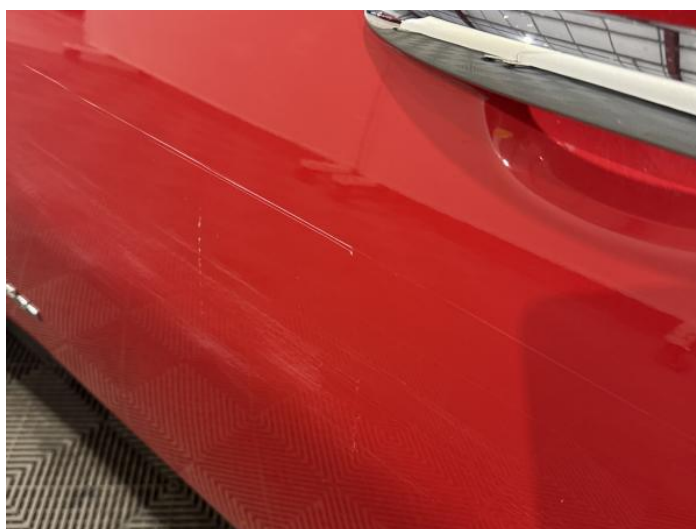
6: Door nsf Scratched Over 25mm Thru Paint