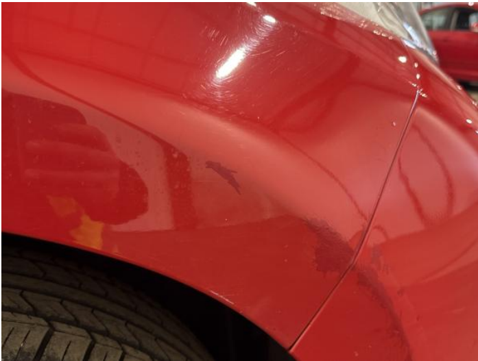
17: Wing osf Scratched Over 25mm Thru Paint