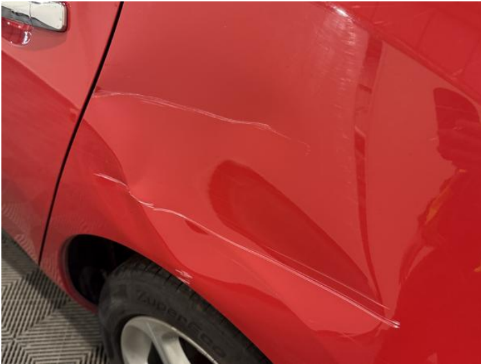
9: Qtr Panel nsr Dented With Paint Damage