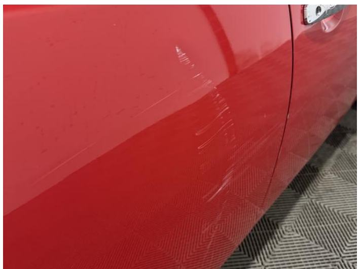
14: Door osr Dented With Paint Damage