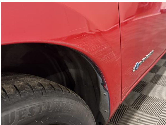
3: Wing nsf Scratched Over 25mm Thru Paint