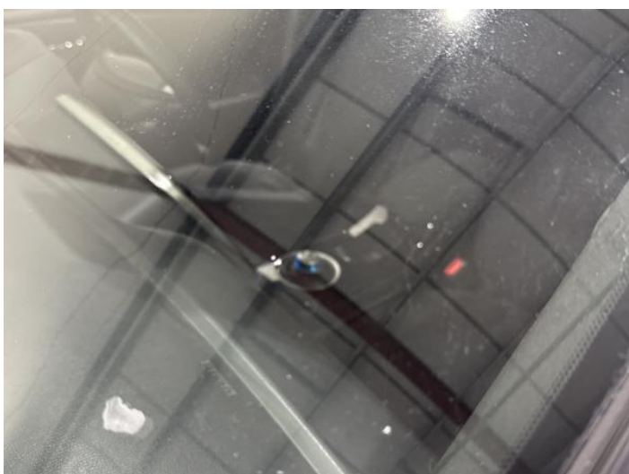
5: Screen Front Chipped Up To 10mm