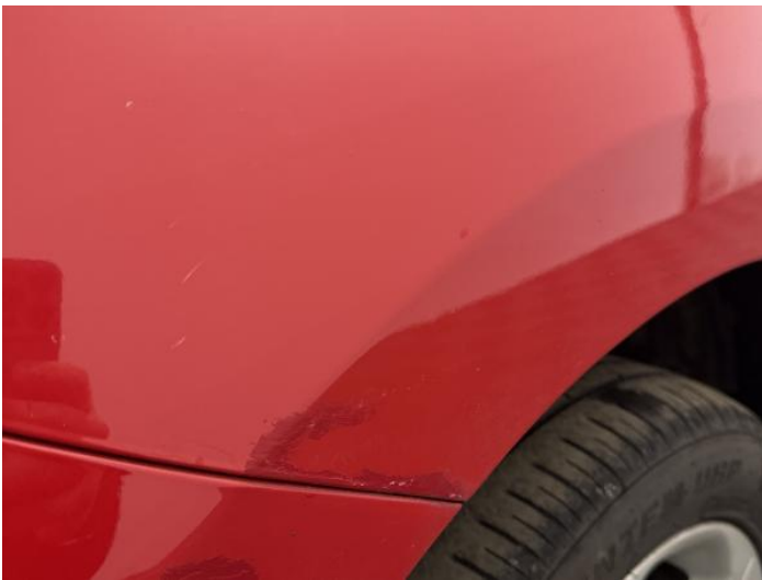
11: Qtr Panel osr Scratched Over 25mm Thru Paint