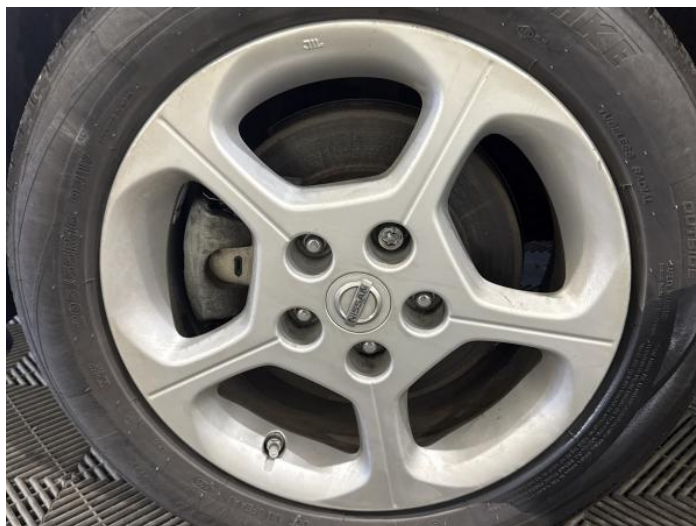
4: Wheel nsf Scratched Up To 50mm