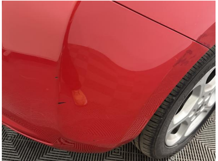
10: Bumper Rear Scratched Over 100mm Thru Paint