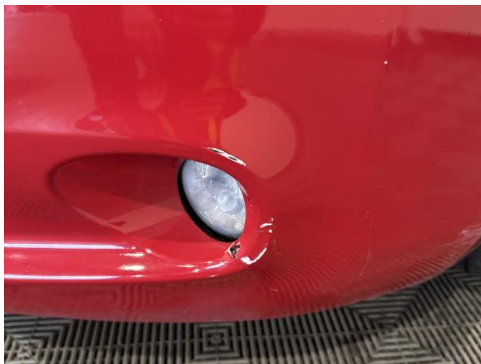
2: Bumper Front Cracked UpTo 25mm