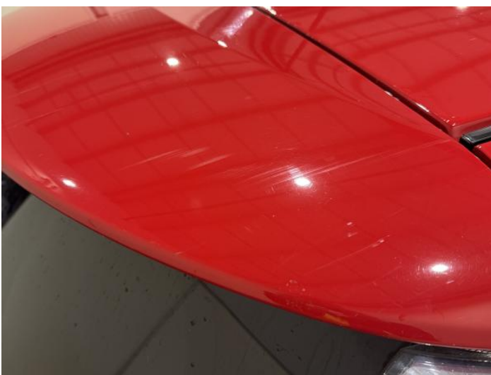
13: Spoiler Rear Scratched (Painted) Over 25mm Thru Paint