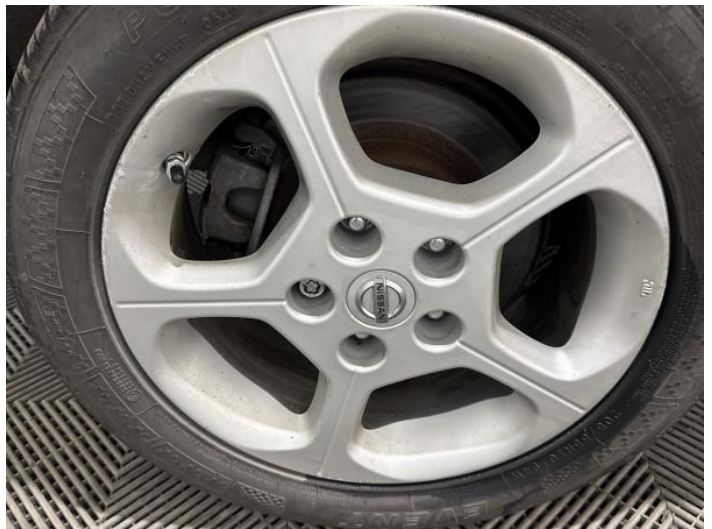
12: Wheel osr Scratched Over 50mm