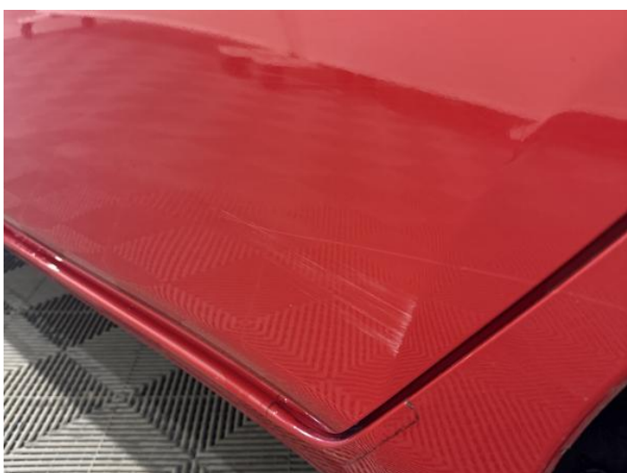
7: Door nsr Scratched Over 25mm Thru Paint