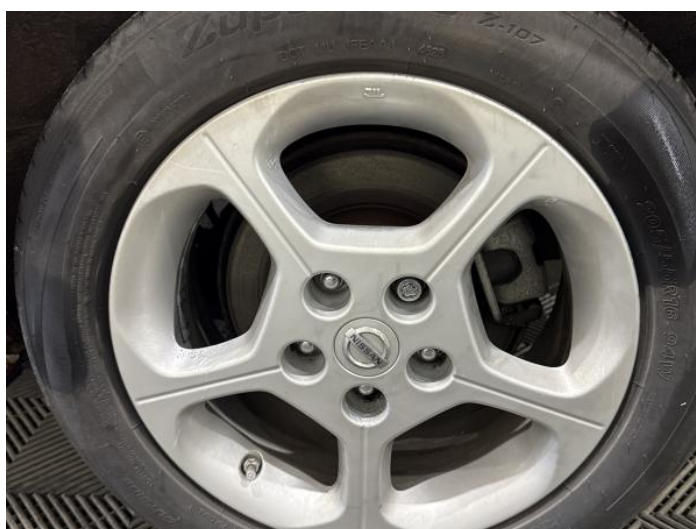
8: Wheel nsr Corroded Light