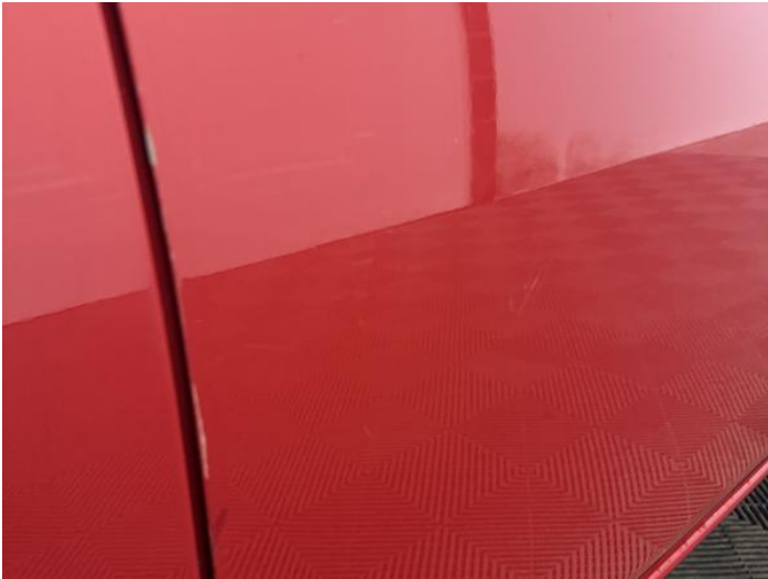
15: Door osf Scratched Over 25mm Thru Paint