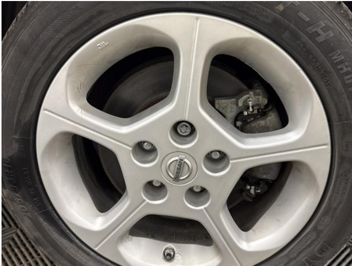
16: Wheel osf Scratched Over 50mm