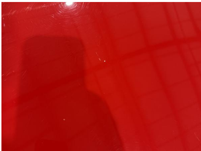
1: Bonnet Scratched Over 25mm Thru Paint