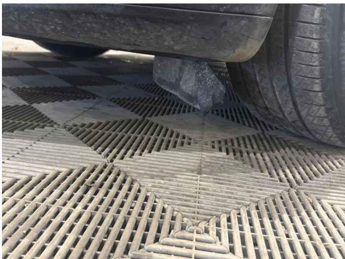
3: Bumper Front Moulding Broken Replace