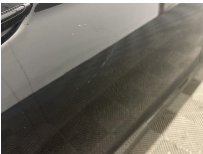
13: Door osr Scratched Over 25mm Thru Paint