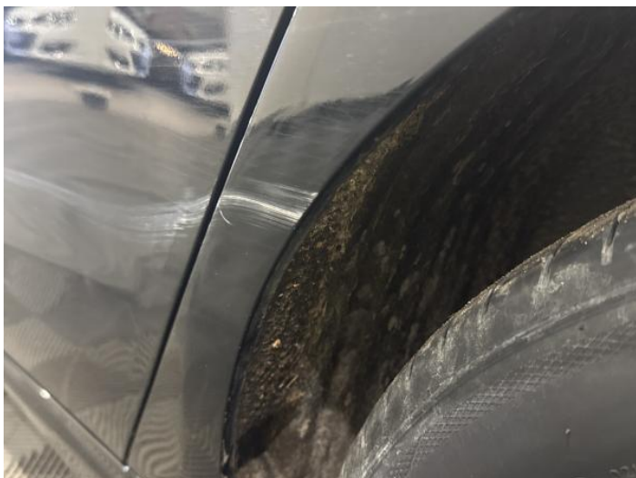
9: Qtr Panel nsr Dented Between 10mm + 30mm