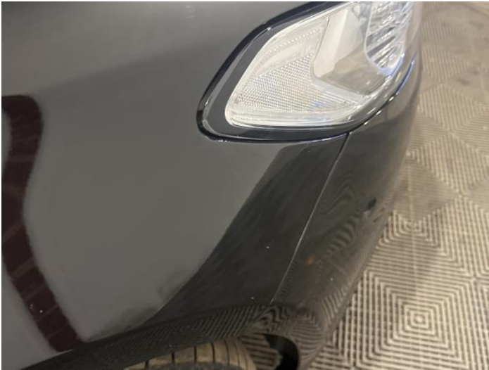
15: Wing osf Chipped 1 To 5