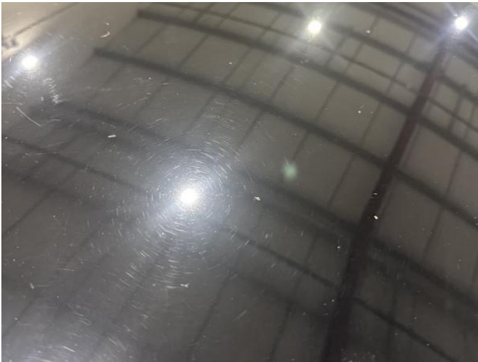
17: Roof Chipped Multiple Chips