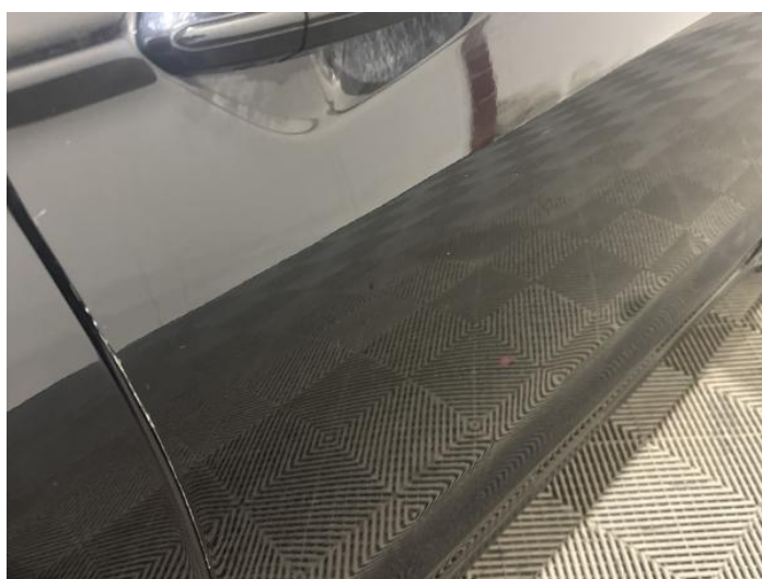
14: Door osf Scratched Over 25mm Thru Paint