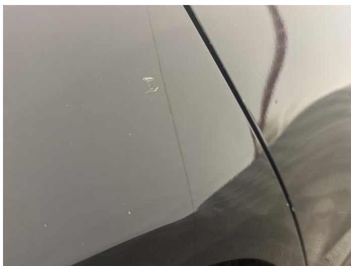
12: Qtr Panel osr Dented Between 10mm + 30mm