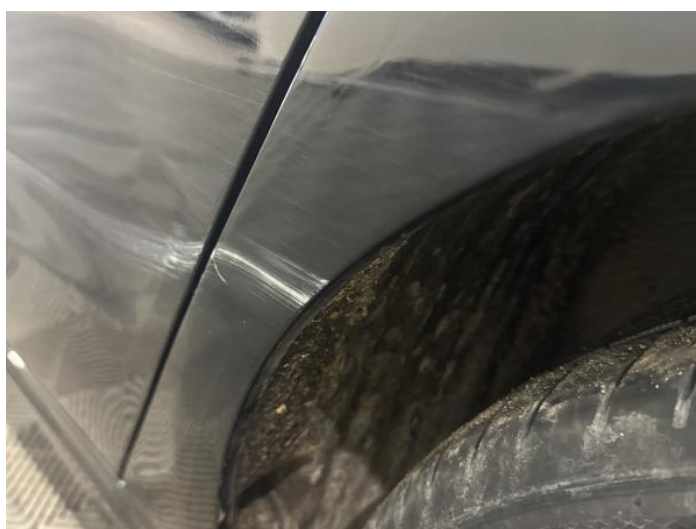
8: Qtr Panel nsr Scratched Over 25mm Thru Paint