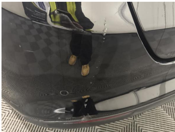
10: Bumper Rear Dented With Paint Damage