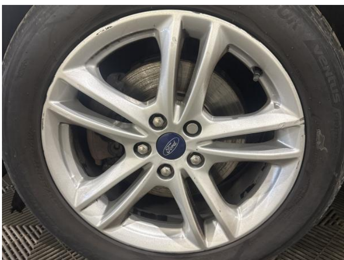
5: Wheel nsf Scratched Over 50mm