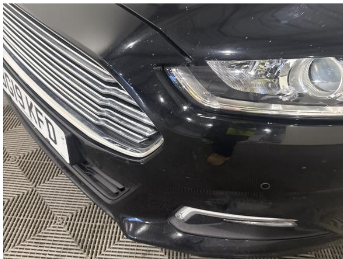
2: Bumper Front Chipped Multiple Chips