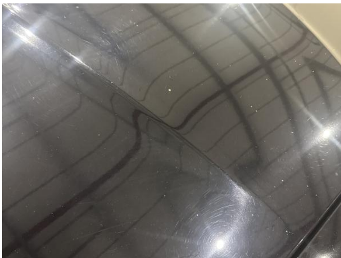
1: Bonnet Chipped Multiple Chips