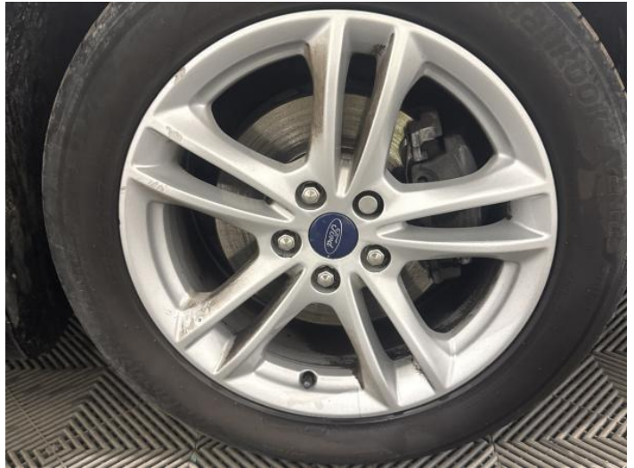
16: Wheel osf Scratched Over 50mm