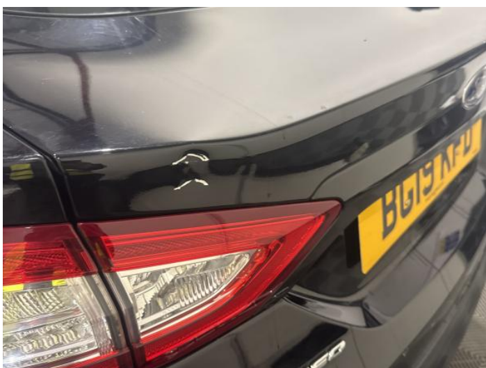
11: Tailgate Dented Over 30mm