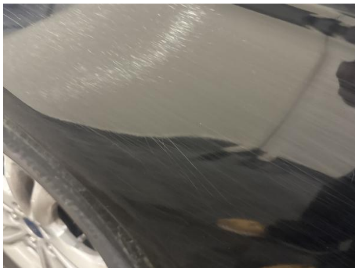
4: Wing nsf Scratched Over 25mm Thru Paint