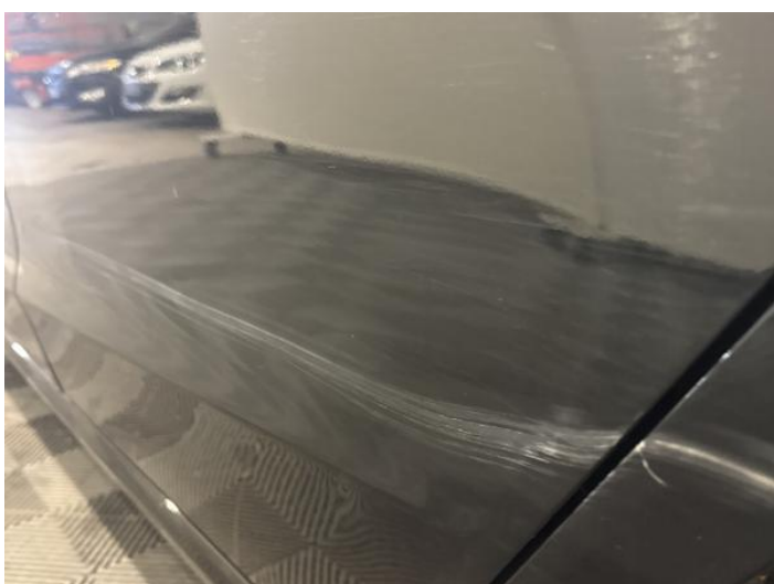
7: Door nsr Dented With Paint Damage